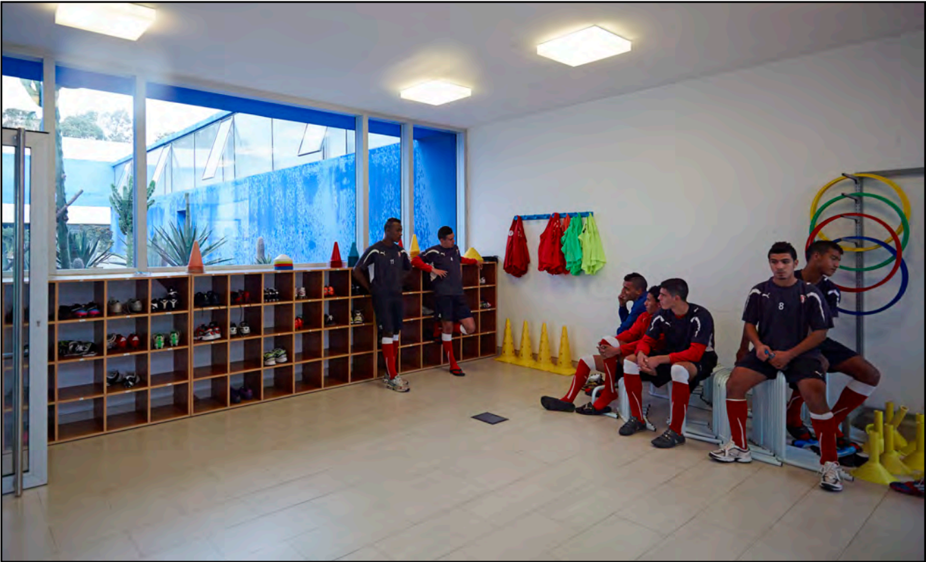
Room with windows opening on the central ble patio of the Sport building.