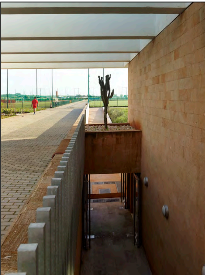
The path below the sportive block links the football grounds and the central square. The local stone “pierre de Salé” is interlaced with the massive white walls of the building..