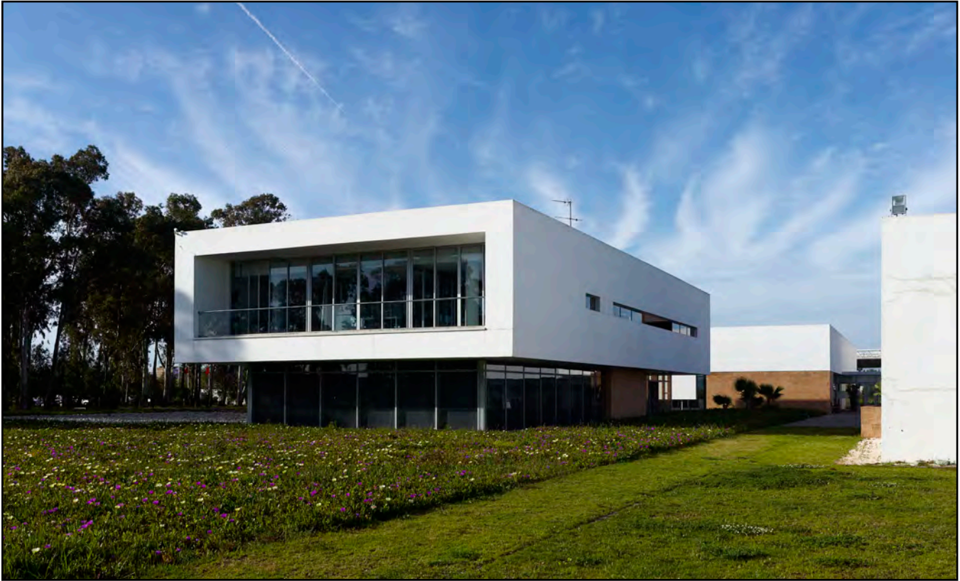
The administration block. Each building is differentiated by its functional role.