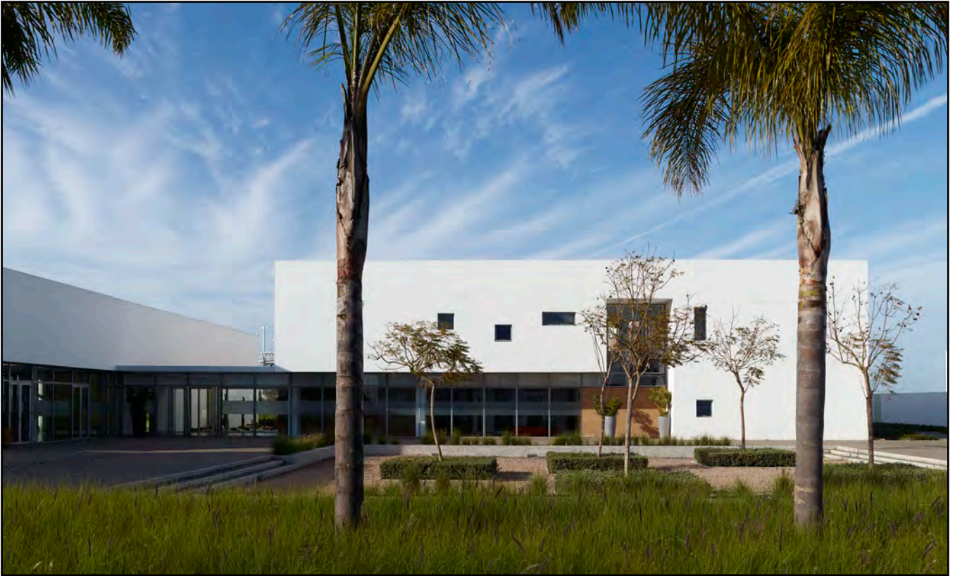
The student residential building entrance on the central square. The arrangements of the buildings around “la place carrée”, is easy to understand, and encourages communications and a clear sense of community.