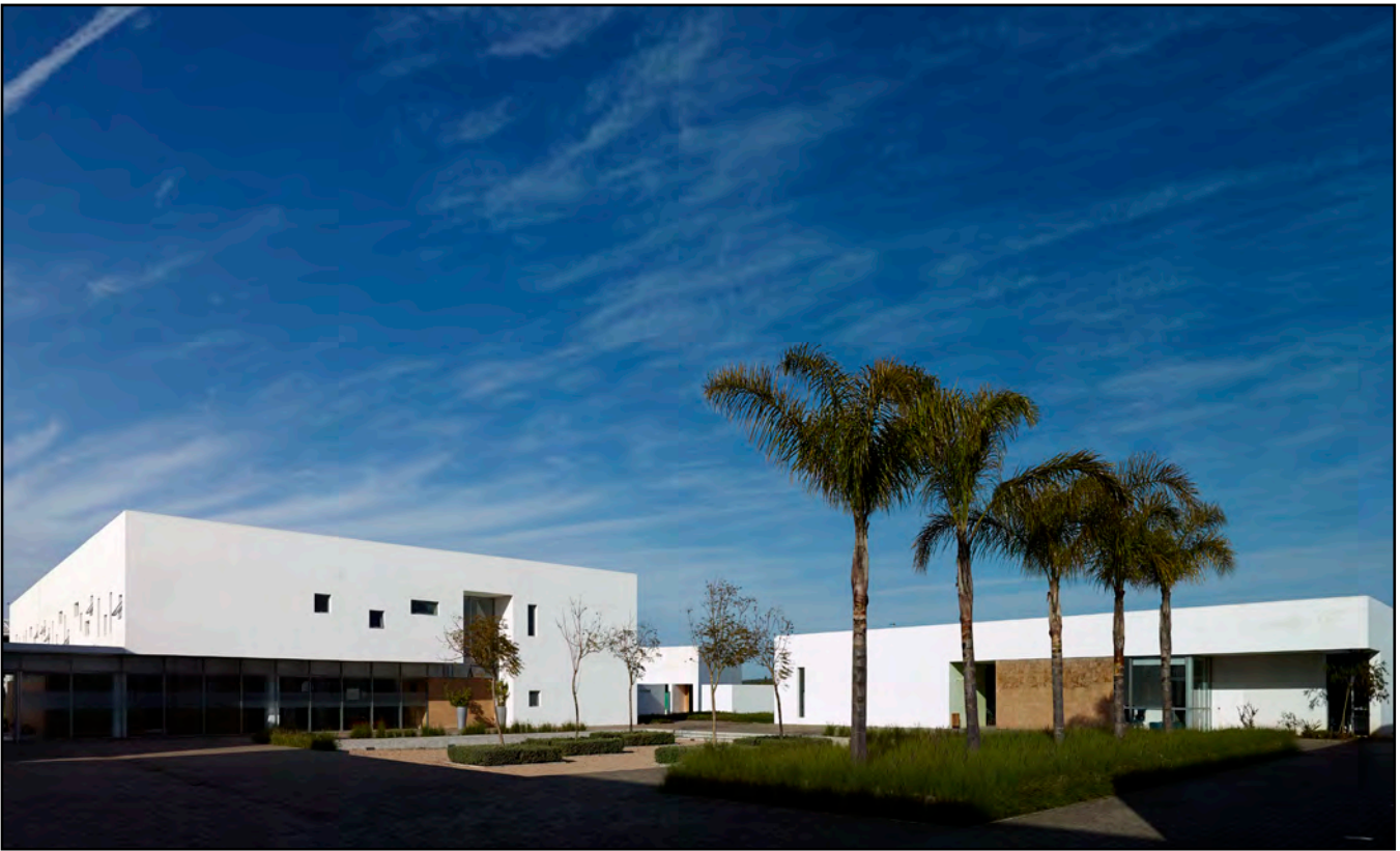
The Academy consists of 5 different buildings organised around a central square, reproducing the “douar” hamlet village typology with a central heart.