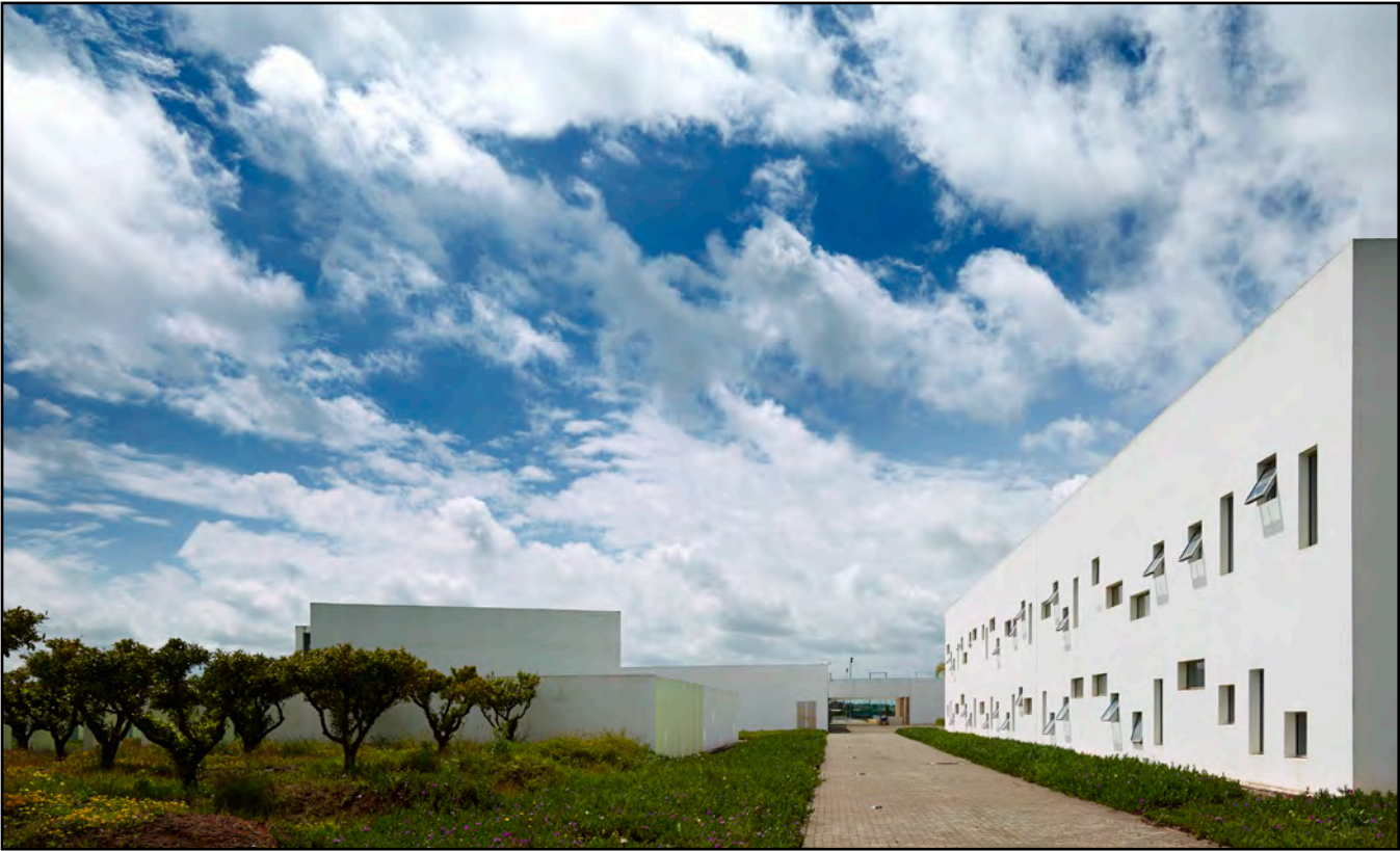
Rear view of the student residential building, in front of the mosque.