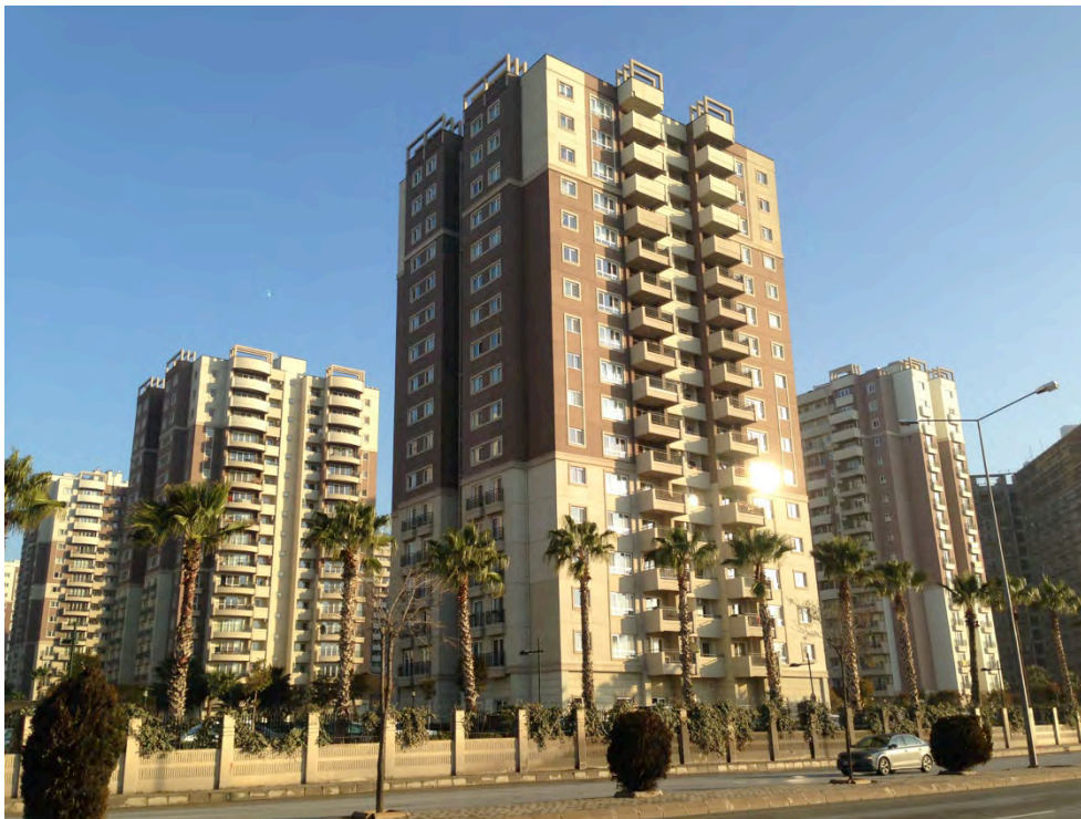
Figure 4: Soyak Mavisehir Houses.

Six parameters have been ascertained to determine the User's comfort, by interrogating the comfort of interior space in the houses: The thermal comfort, visual comfort, audio comfort, humidity and moisture control and design quality and the satisfaction of house user. Evaluation of the questionnaire results that held in four areas set forth the main line of work. In other words, user comfort has been studied preferentially and then tunnel formwork system has been questioned in terms of it provides and not provides.