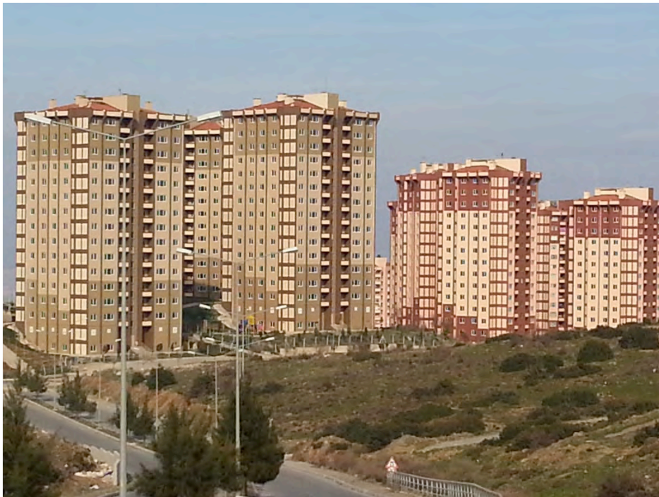
Figure 3: TOKI Uzundere Houses.

TOKI Uzundere Houses, which are built by considering low-incomers and Mavisehir Soyak Houses, where higher incomers live are built after the regulation (Figures 3&4).