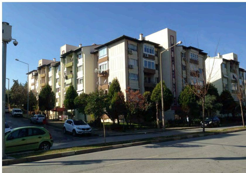
Figure 1: Gaziemir Emlak Bankasi Houses (Stage II) – (Source: Ozgul Y. Karaman).

In this context, four different mass housing areas built with tunnel formwork system in Izmir have been selected as cases of the paper to evaluate user comfort. These are: Gaziemir Emlak Bankasi Houses, TOKI Uzundere Houses, Mavisehir Stage I and Mavisehir Soyak Houses. Cases are selected on purpose to be able to make some comparisons and evaluate the effect of heat insulation regulation. Two of the housing areas had been built before thermal insulation regulation 2008 (Gaziemir Emlak Bankasi Houses Stage II and Mavisehir Stage I) and one of them built for higher incomers (Mavisehir Stage I) (Figures 1&2).