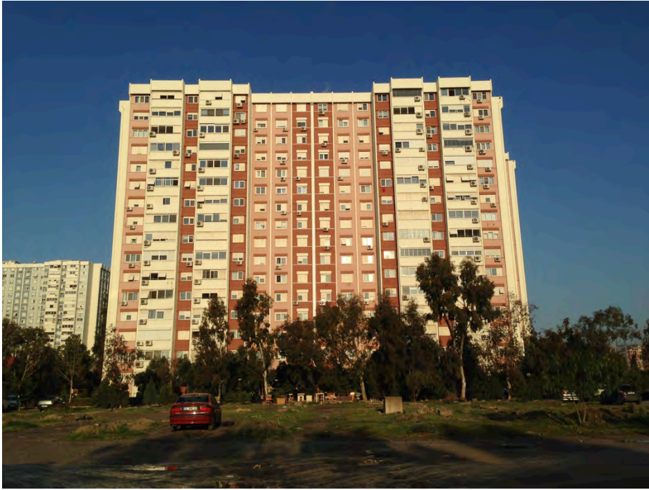
Figure 2: Mavisehir (Stage I) houses.

TOKI Uzundere Houses, which are built by considering low-incomers and Mavisehir Soyak Houses, where higher incomers live are built after the regulation (Figures 3&4).