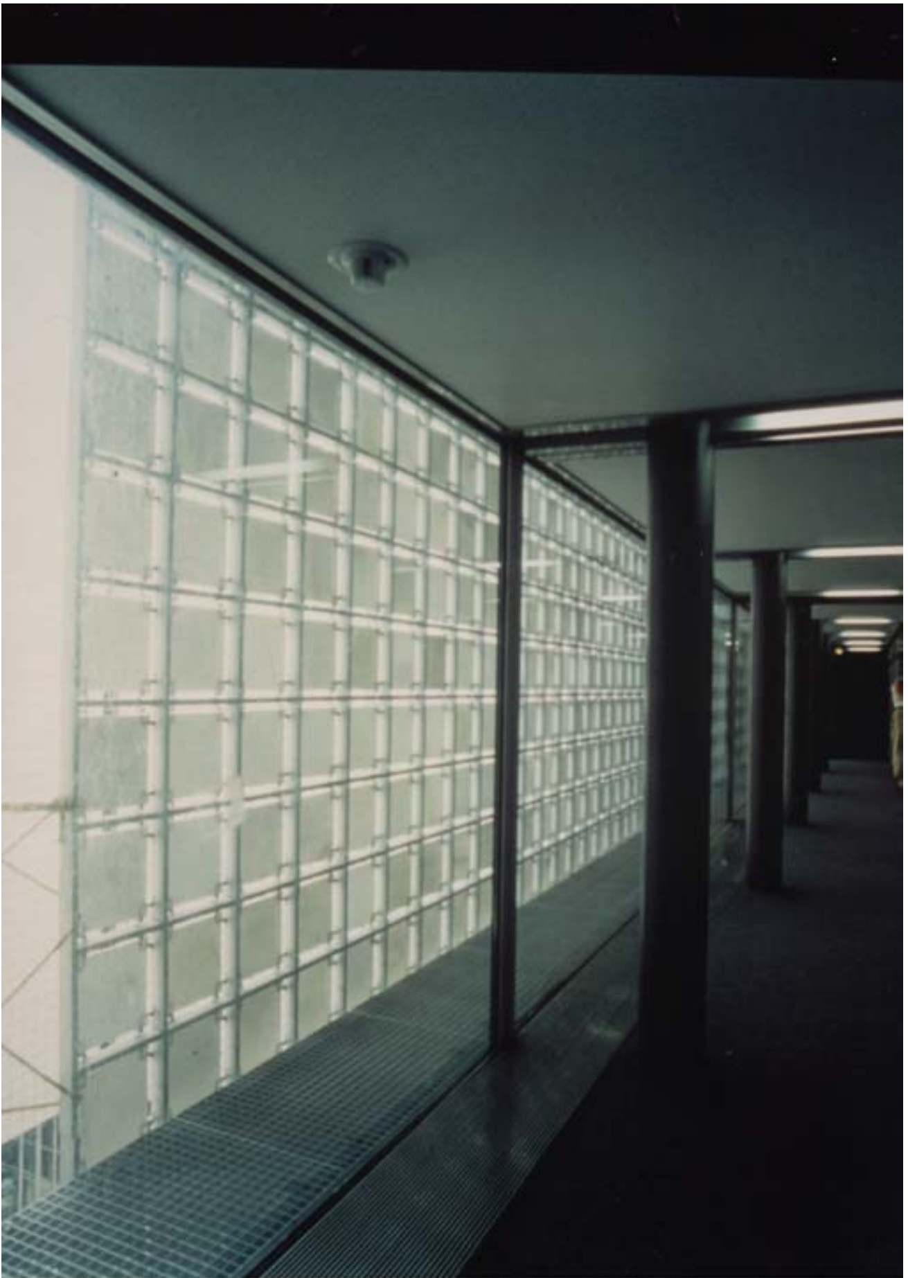
Translucent Marble Panels cover the internal Patio