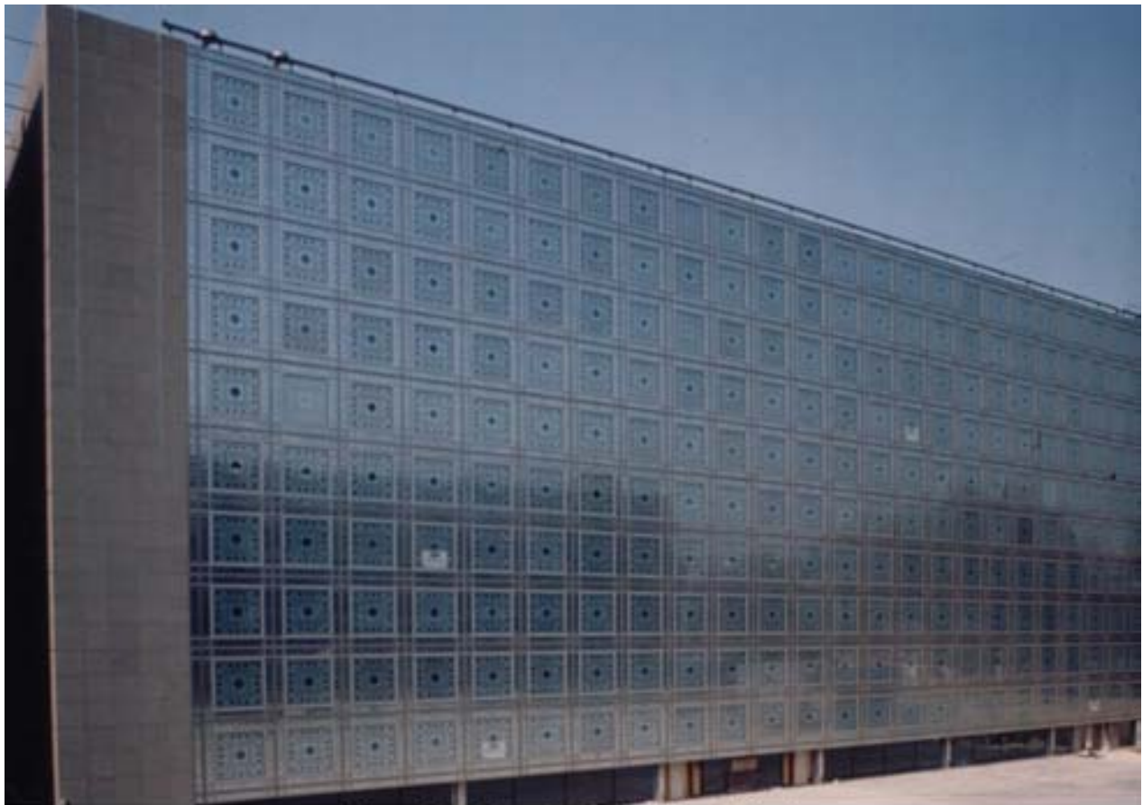
The 30x90m South-West Wall