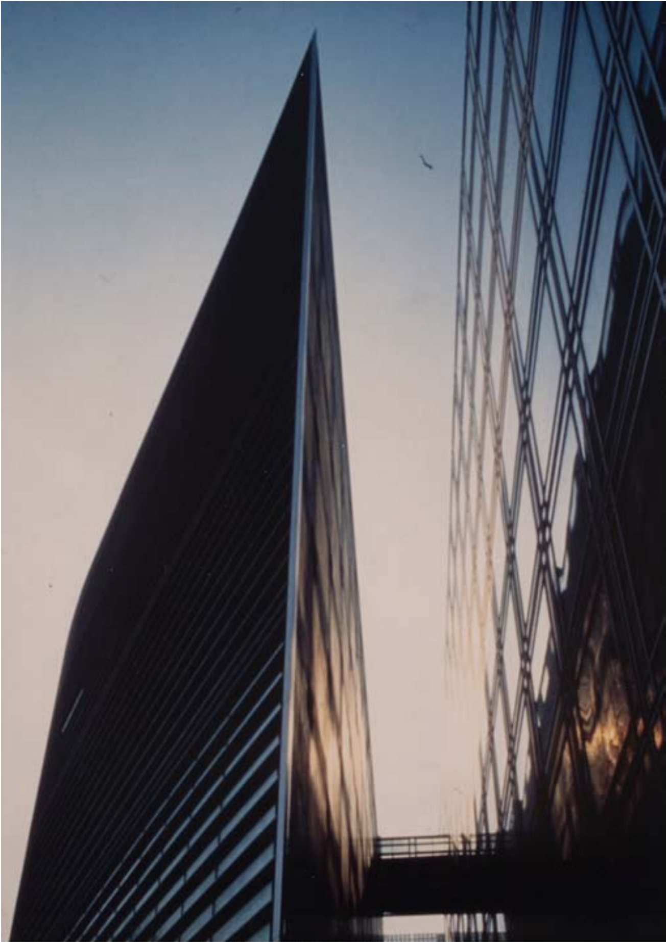
The curved North Façade of the IMA