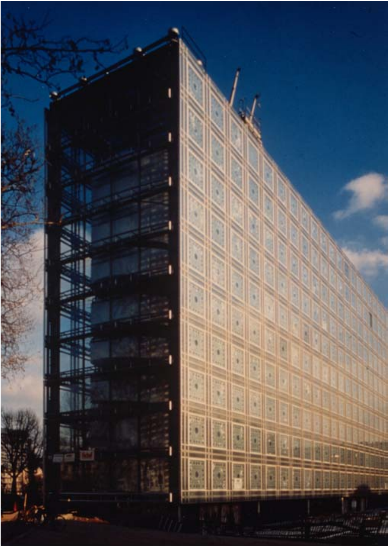
South-West Elevation with Diaphragms which respond electronically to Light Intensity