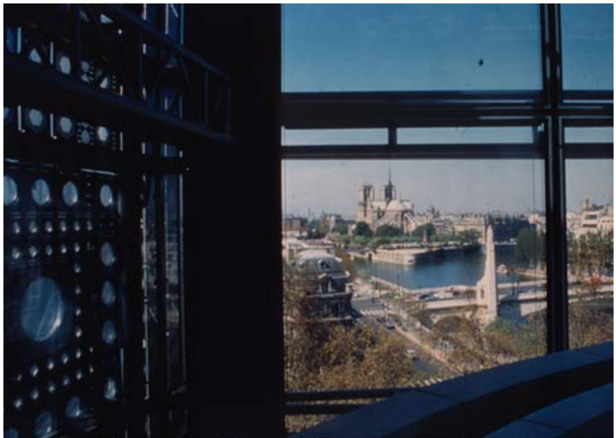
View over the Seine and Notre Dame from the IMA