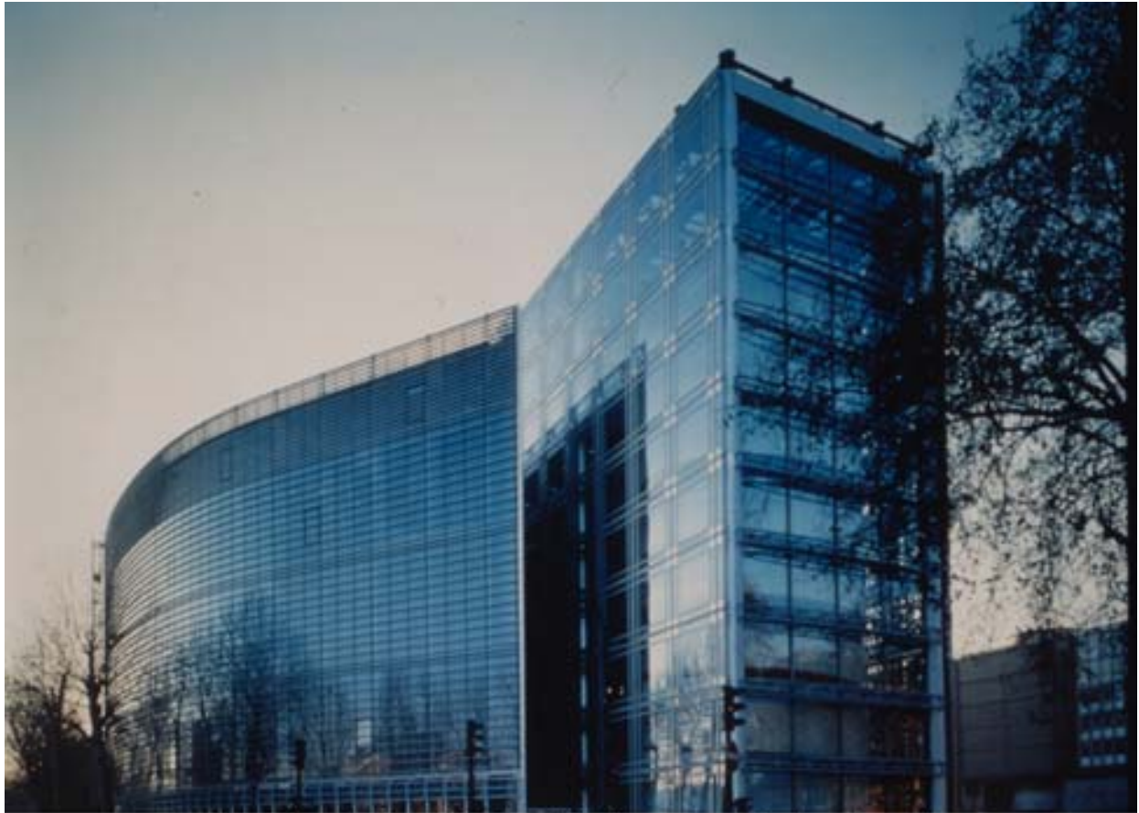
The North-East facing Walls are antirely glazed