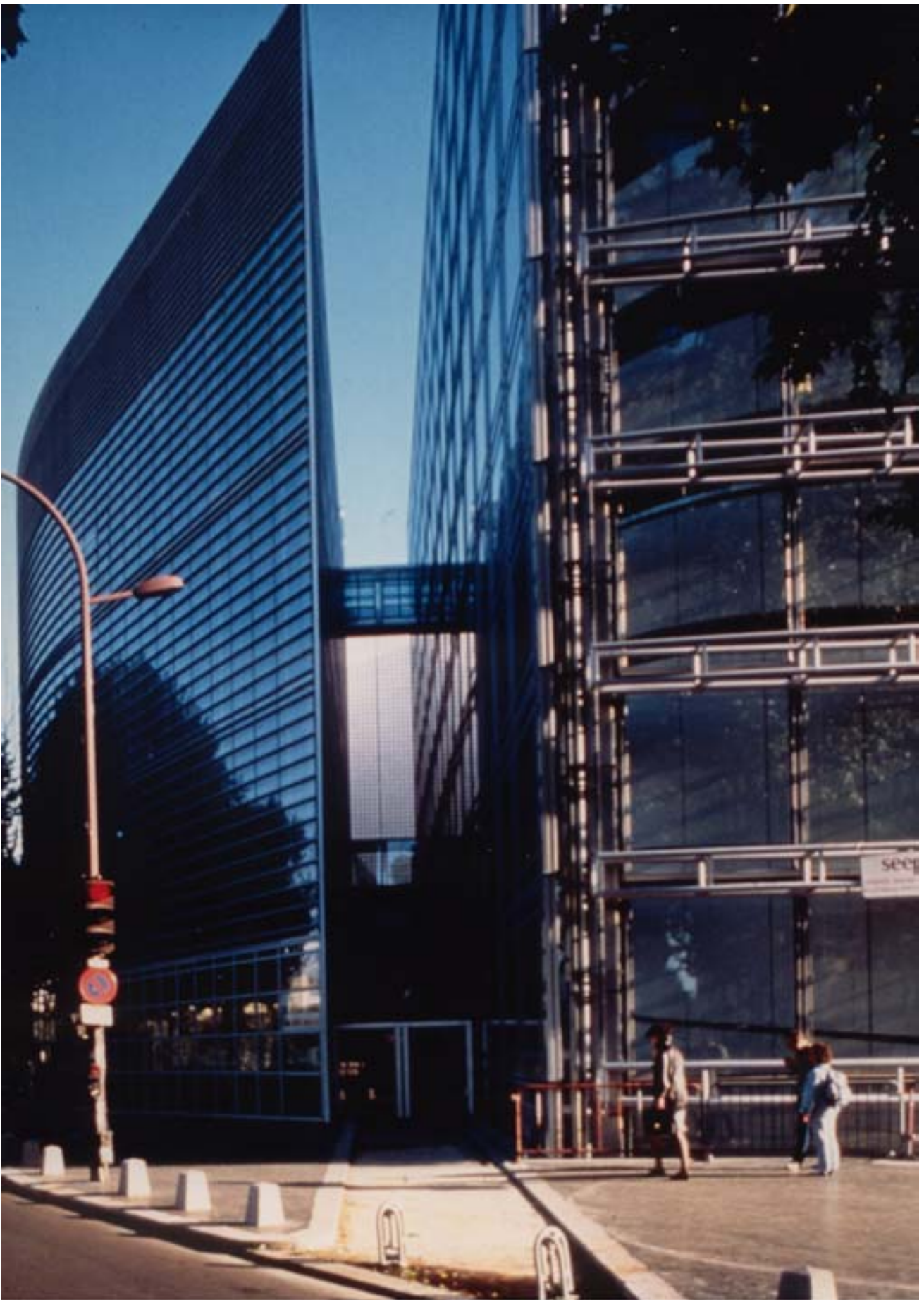
West Elevation with Driveway between the two Parts of the Building