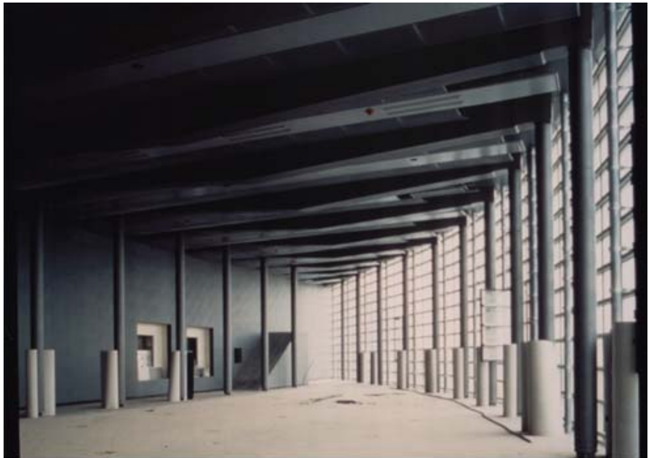
Interior View of the Exhibition Area