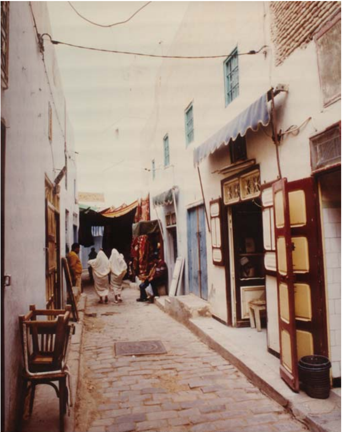
Streetscape in the Medina