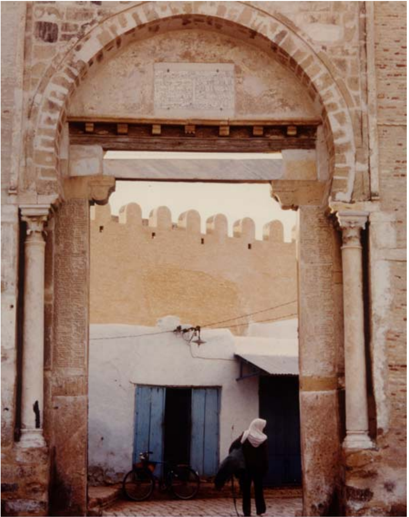
Gateway of the medina of Kairouan