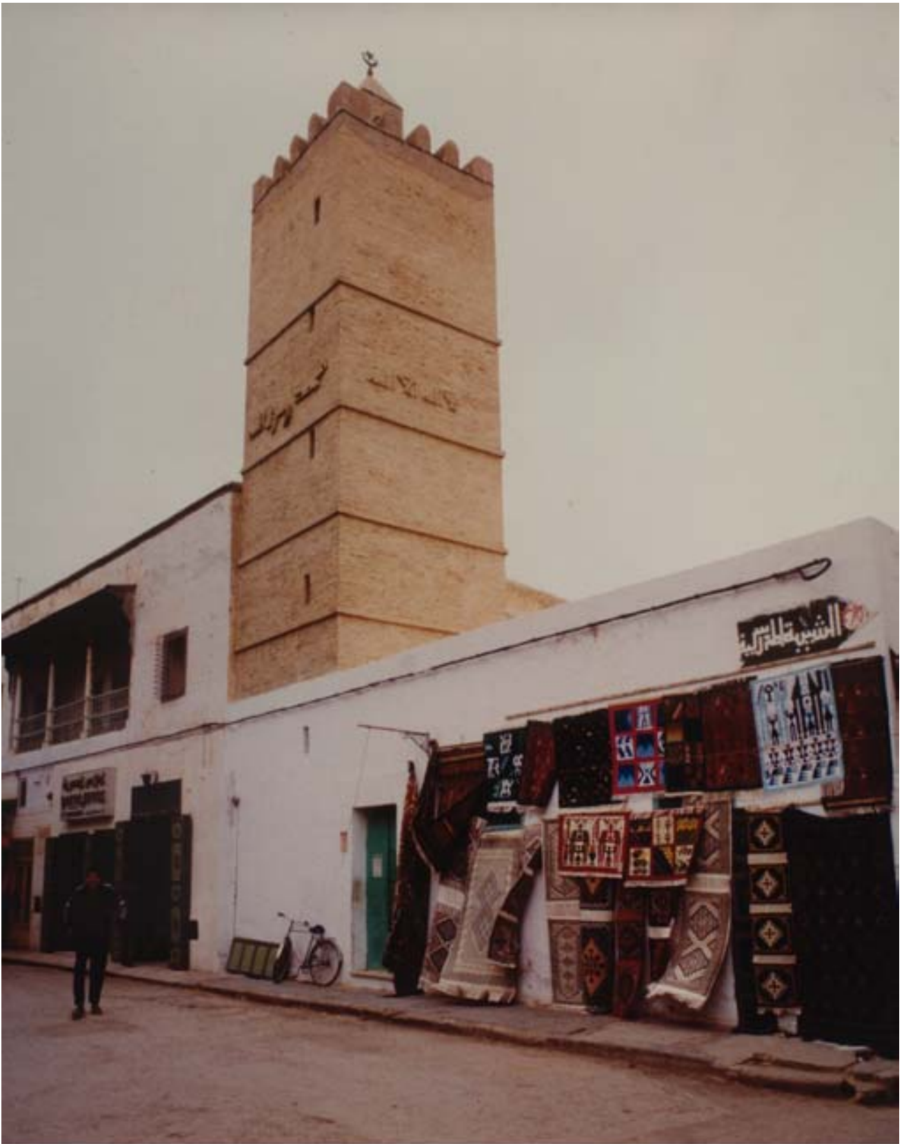
A restored Minaret