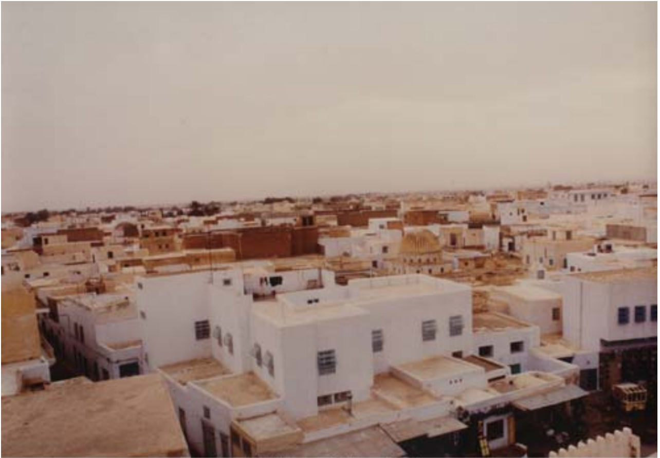
Aerial View of the Medina