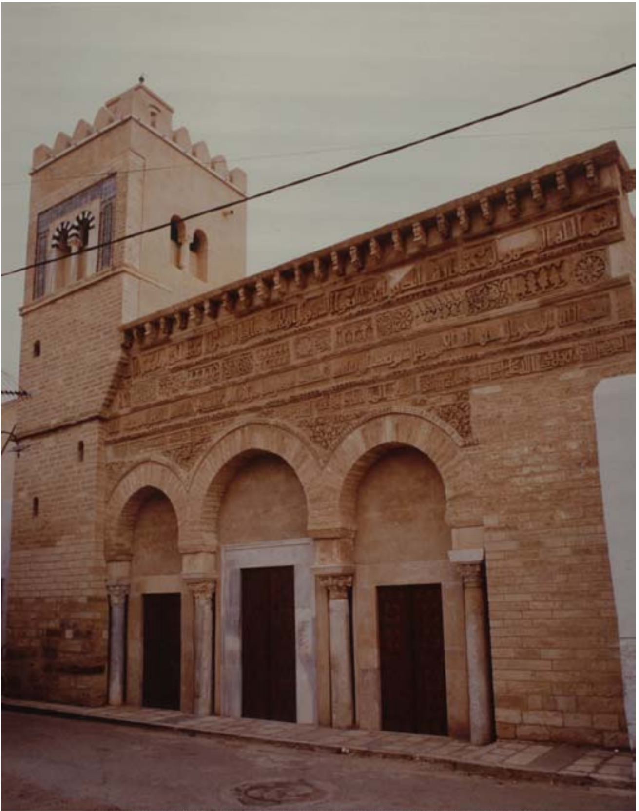
Façade of the Three Doors Mosque after Restoration