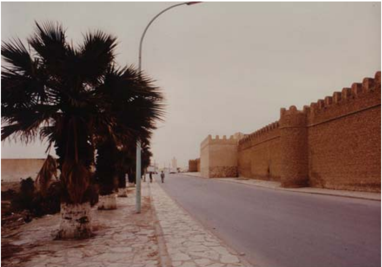
The Fortification Walls after Restoraion