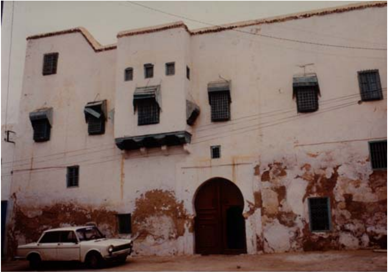
Dar Bouras before Restoration