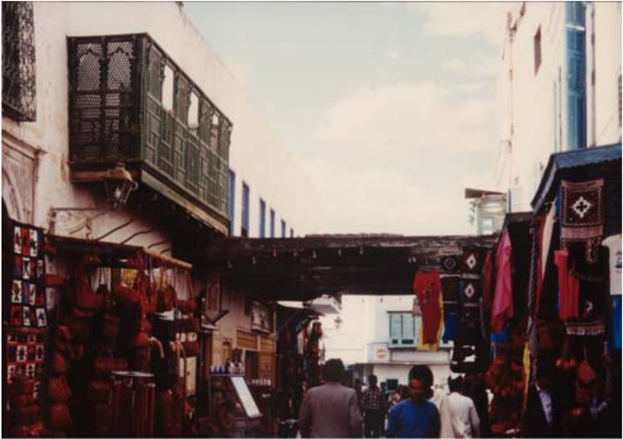
Suq in the Medina