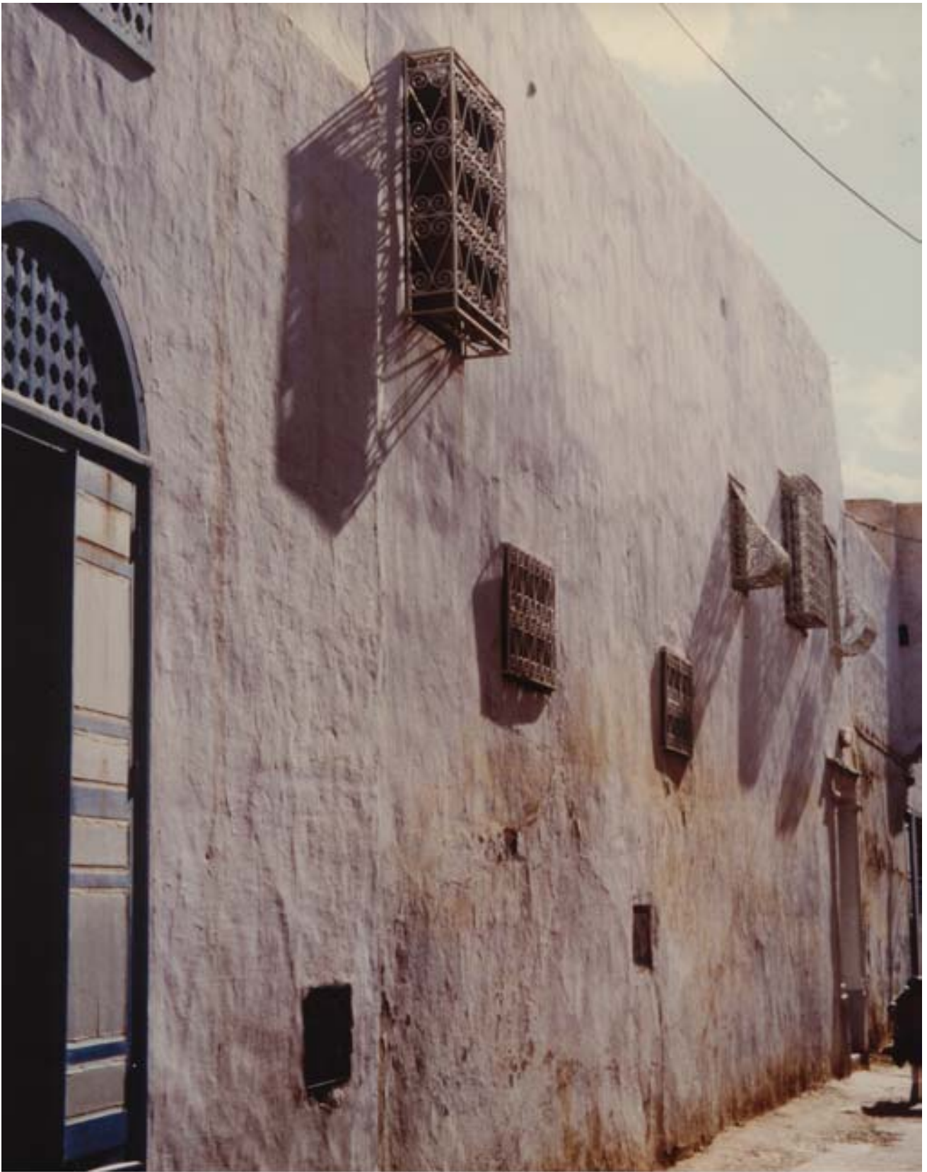
Façade of a House in the Medina