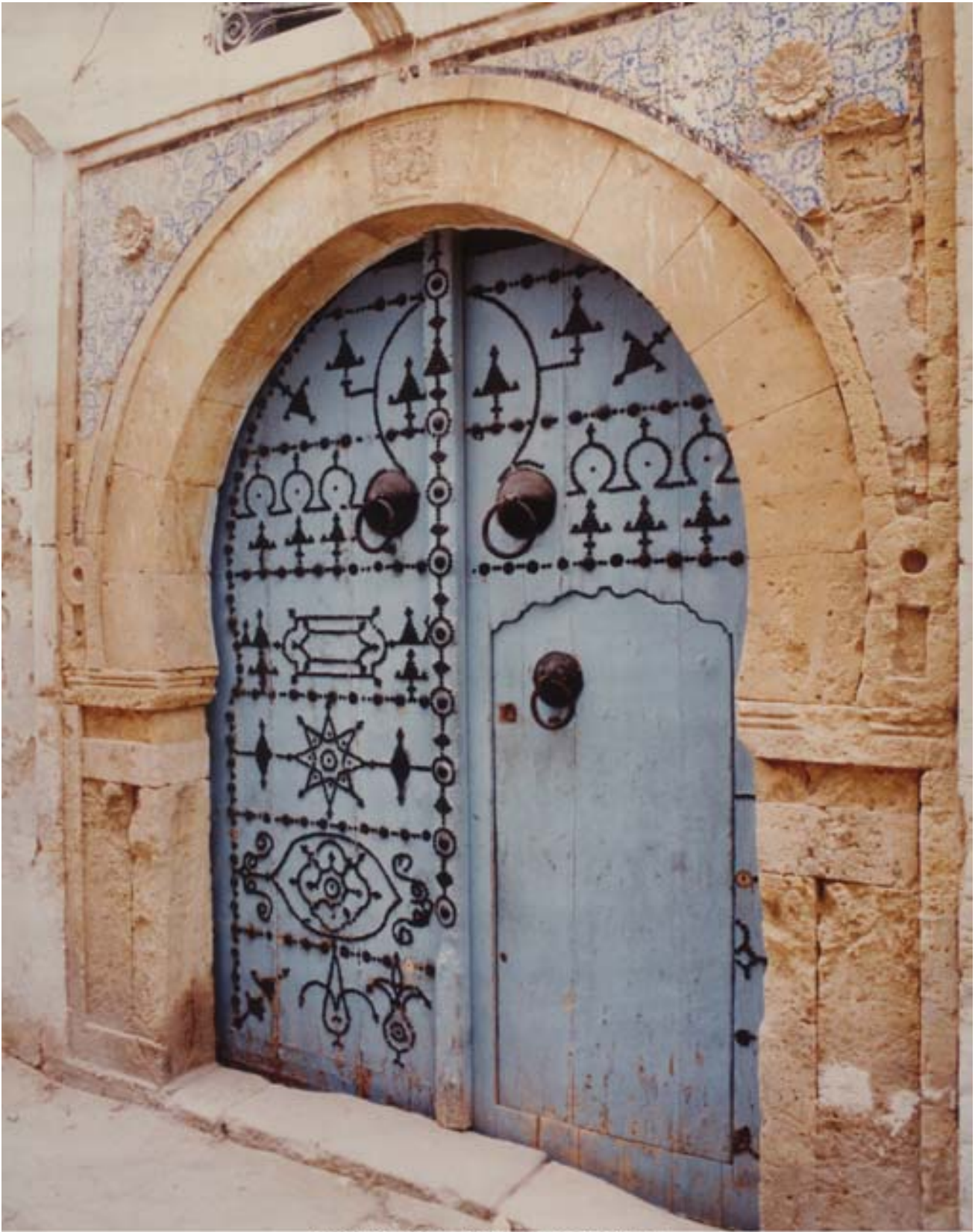
Detail of a decorated Door