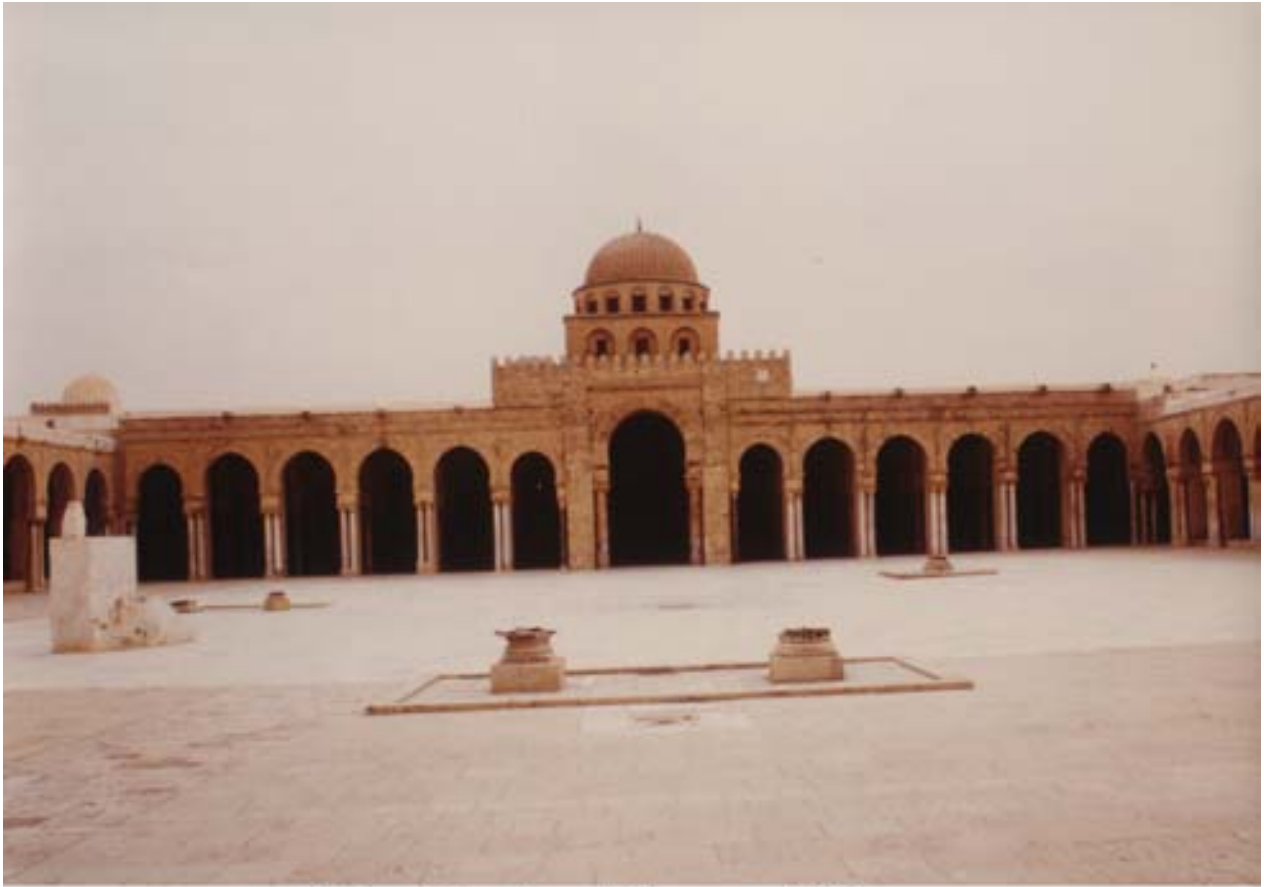
Sahn of the Great Mosque of Kairouan