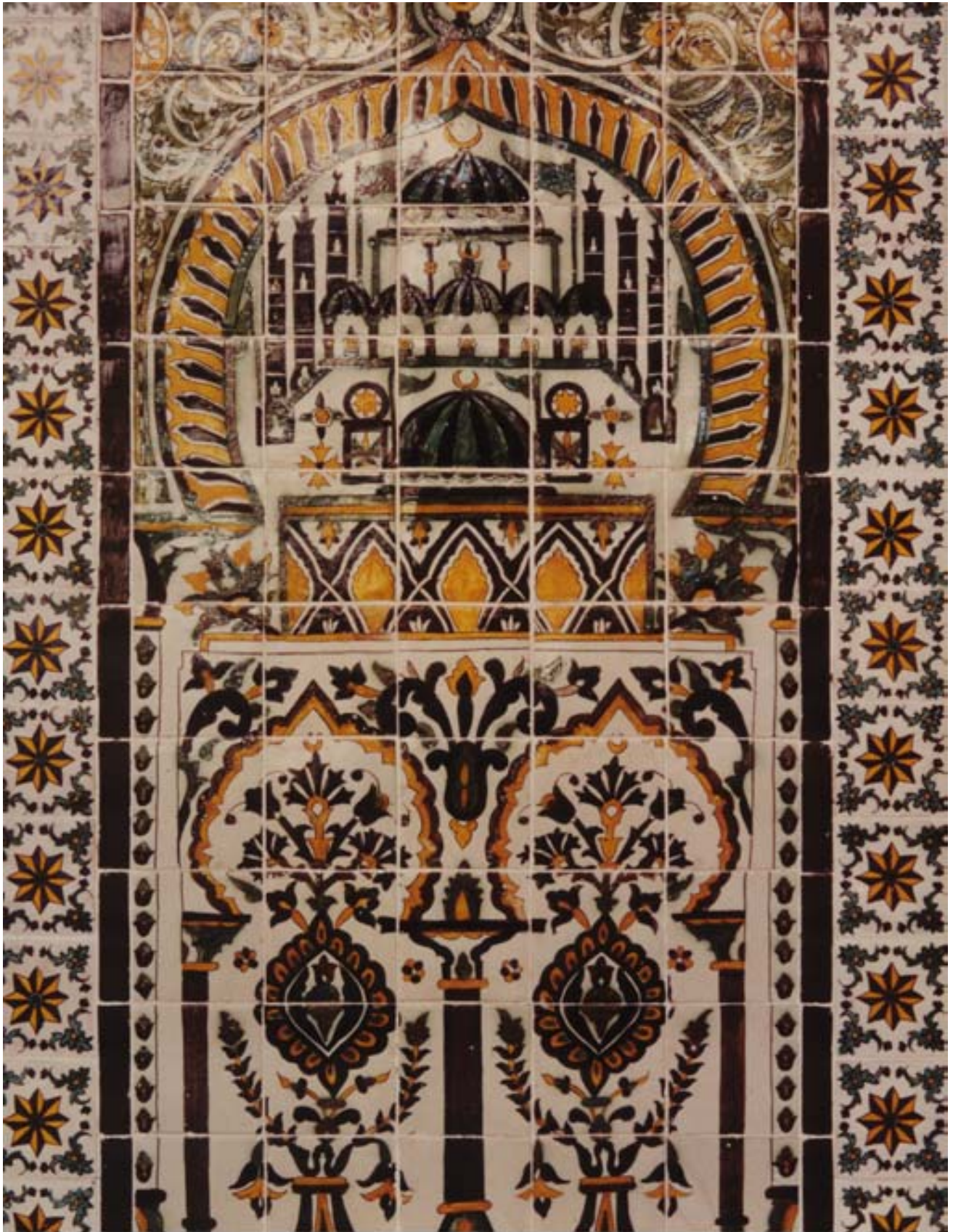
Detail of Ceramic-Tiled Panel