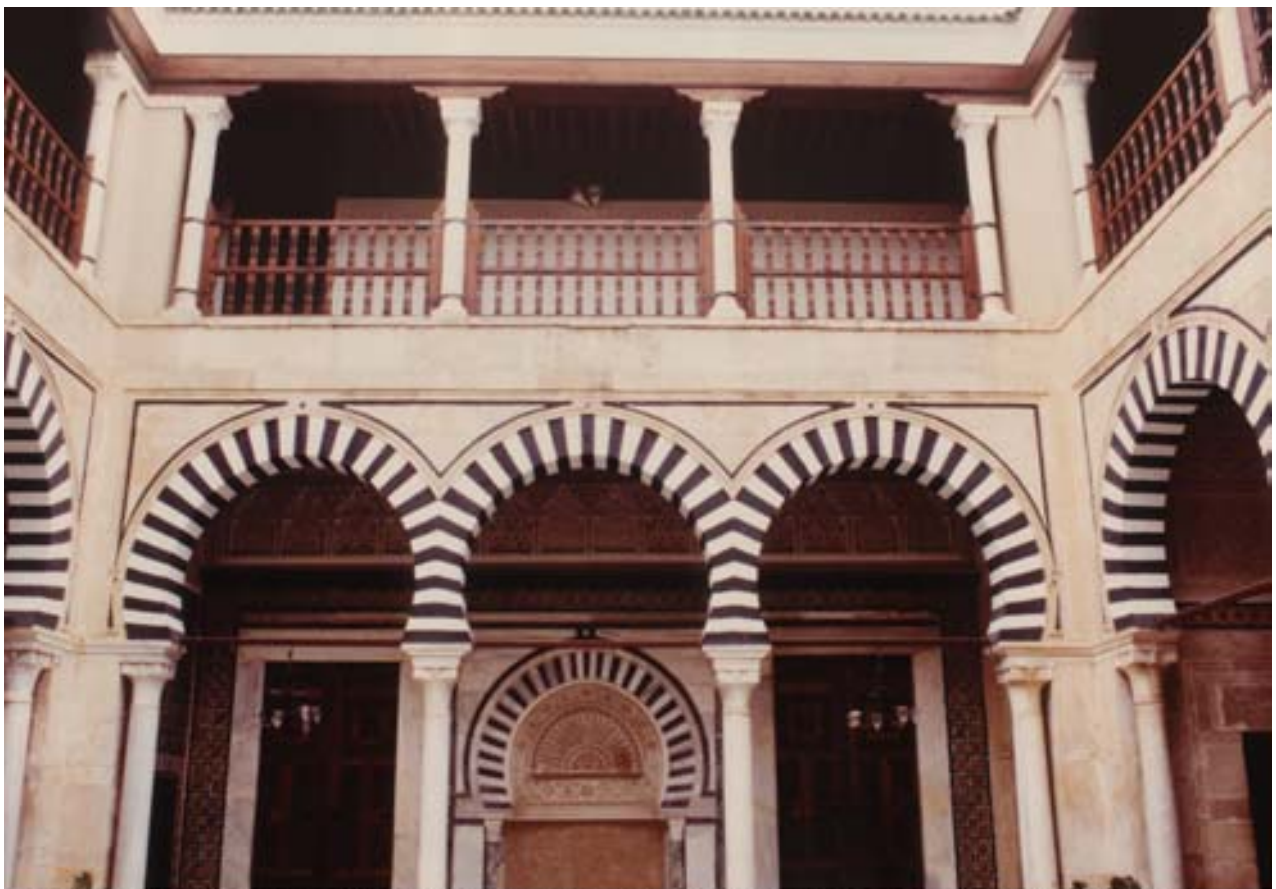
Inner Courtyard of Sidi Abid Mausileum now housing the ASM Offices