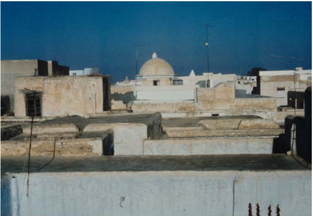
Roofscape of the Medina