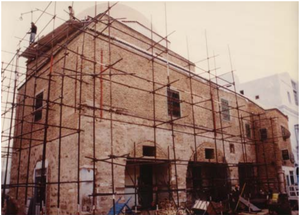
Puits Banouta under Restoration