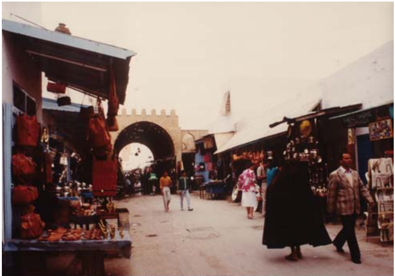
Suq and Medina Gateway in the back-ground