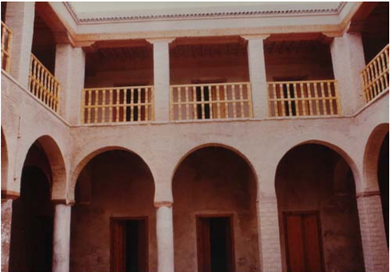
Inner Courtyard of Khan Banouta now a Crafts Center