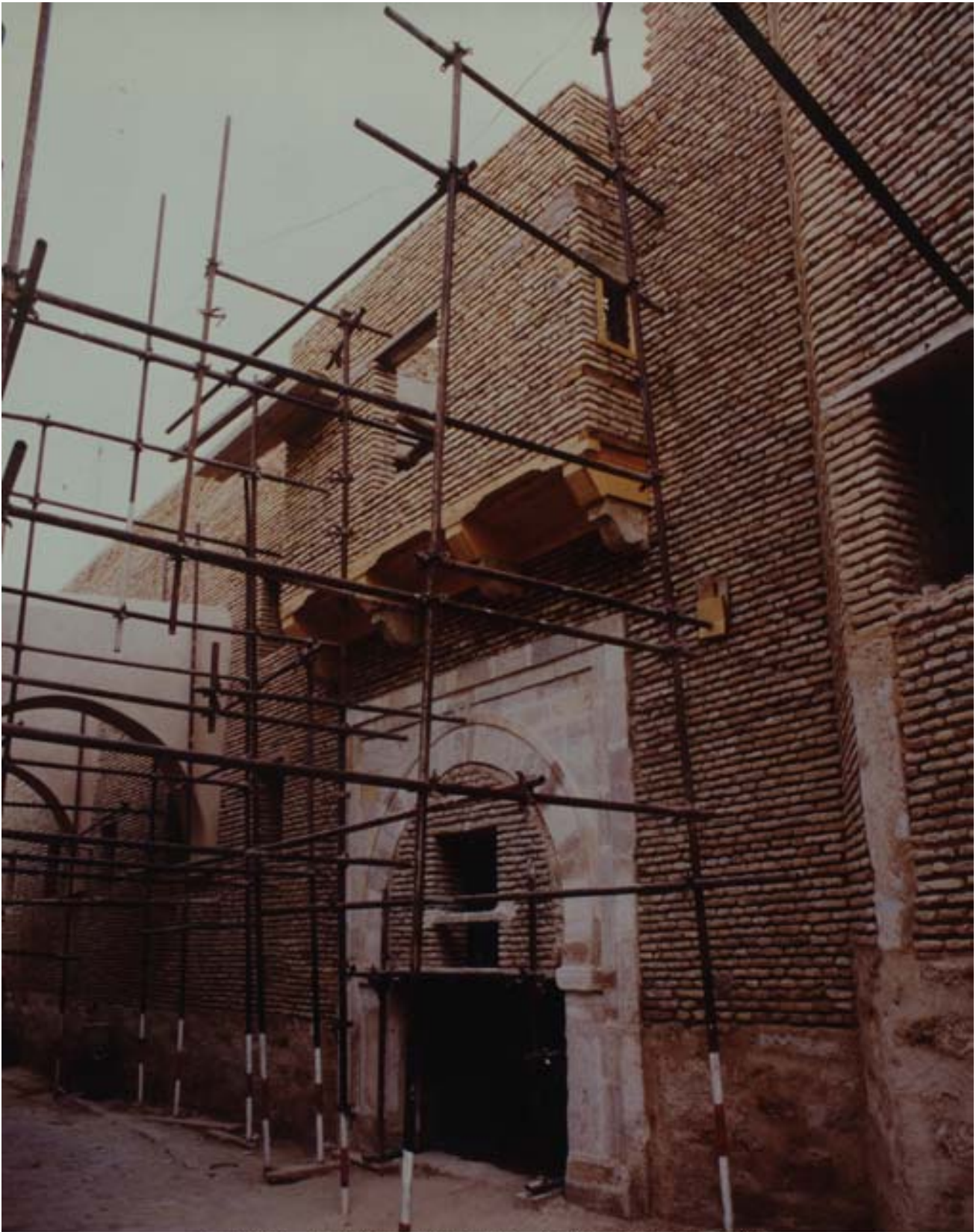
Façade of Khan Banouta during Restoration