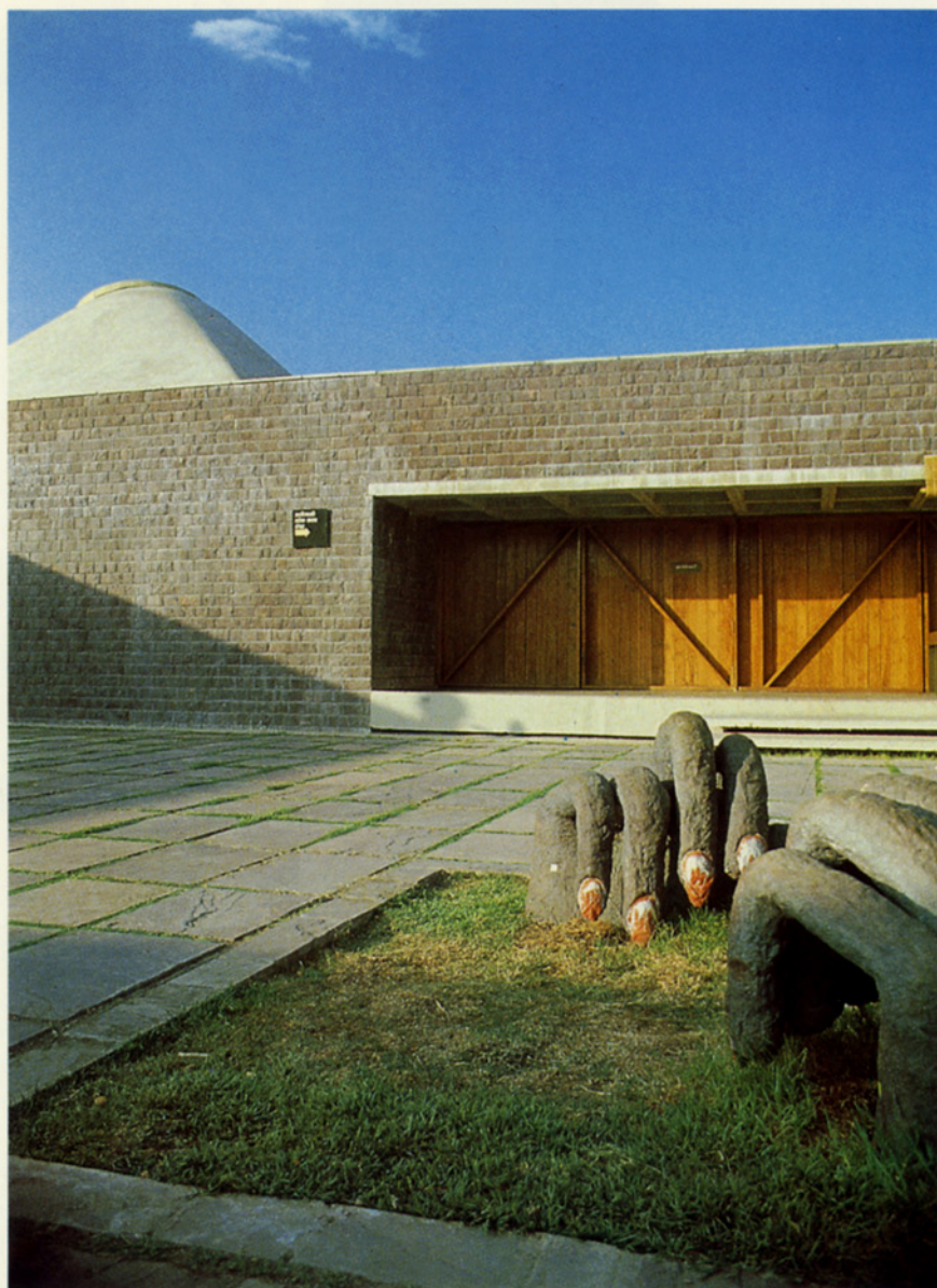
Courtyard of the museum of Tribal Art.