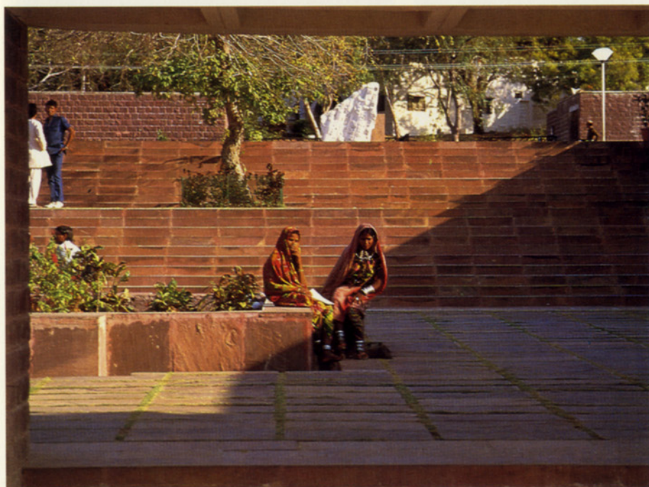
View back towards the entrance.