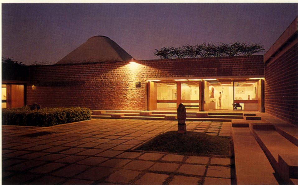
Courtyard and gallery entrance.