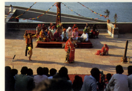
The Bhairang with a performance in progress.