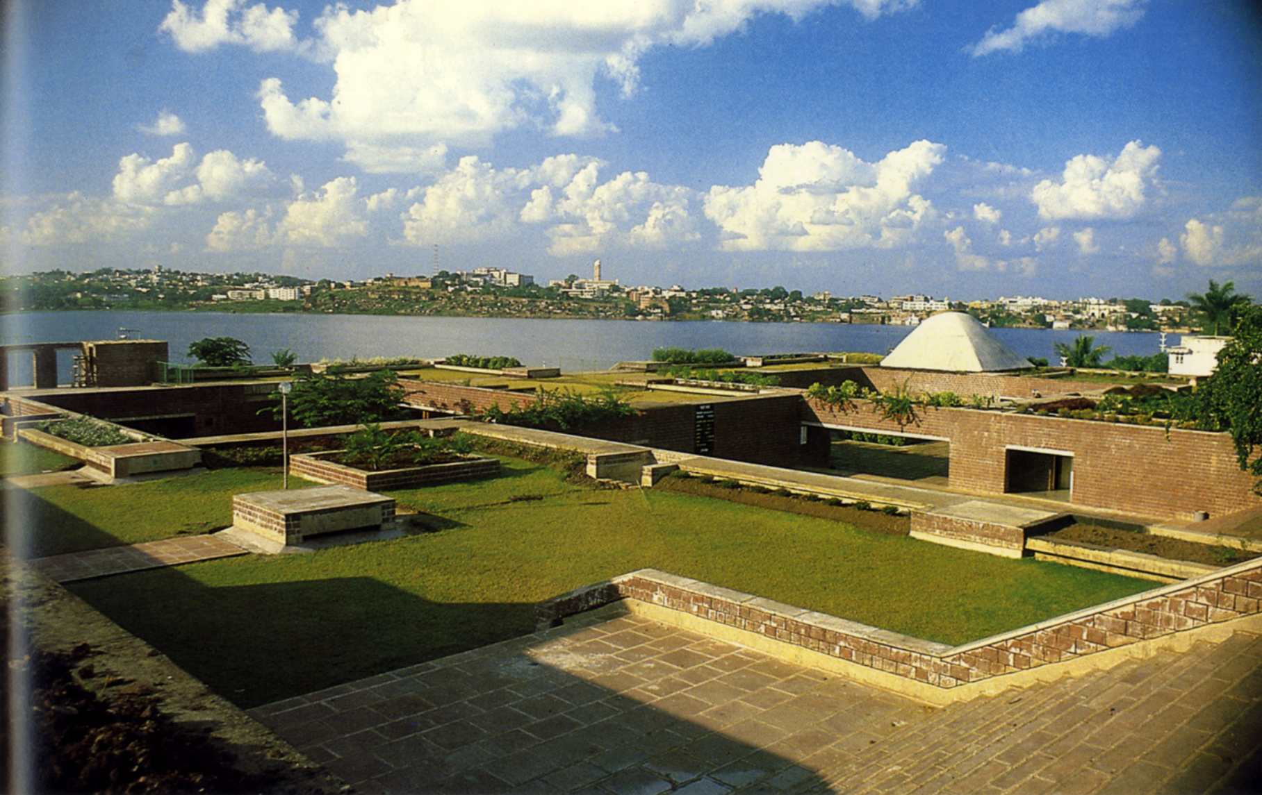
Terrace gardens overlooking the city of Bhopal.