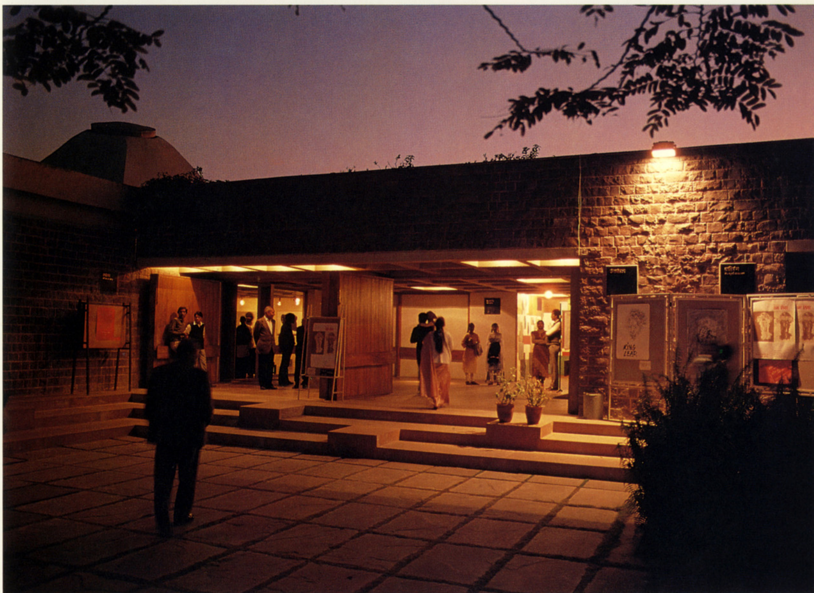
An exhibition in the evening.