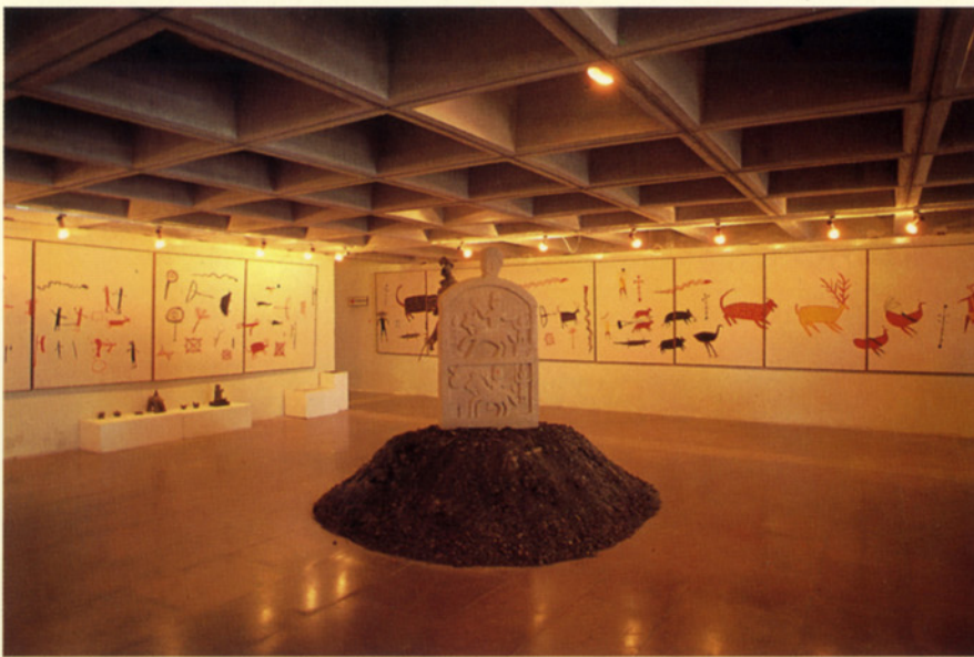
Museum of Tribal Art.