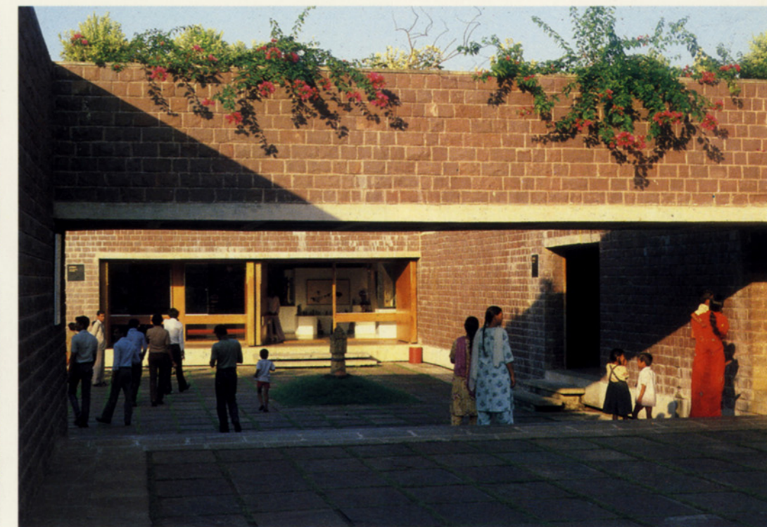
Courtyards connect the various activity spaces.