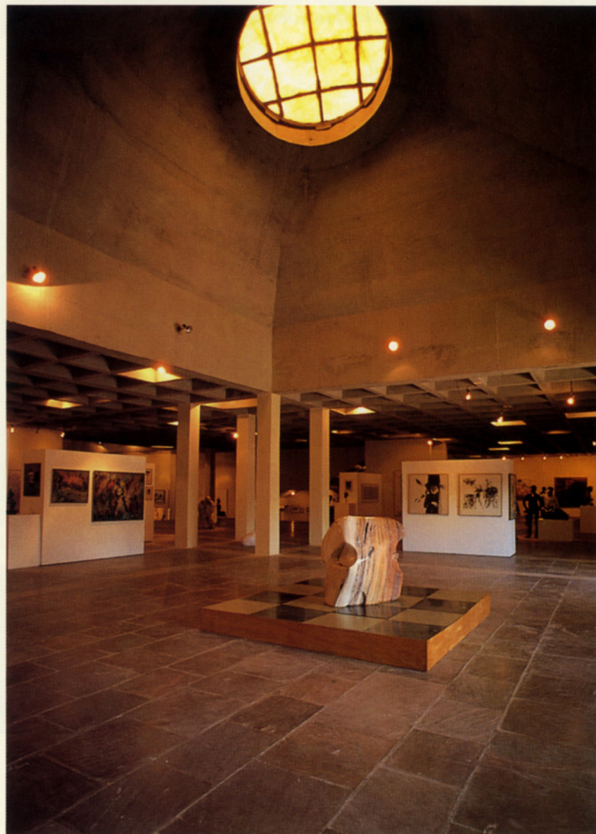
Gallery of Modern Art with its top-light 'cannon'.