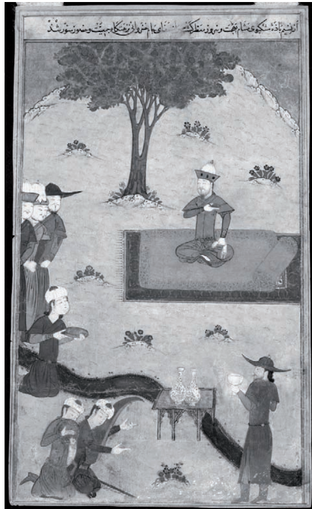
Fig. 5. Feast after the conquest of Dehli. Painting from a manuscript of the Zafarnāma of Sharaf al-Din Yazdi, dated 839 (1436).

A portrait of Tamerlane appears in a second sixteenth-century biographical dictionary, André Thevet's Les vrais portraits et vies des hommes illustres Grecz, Latins, et Payens (Paris, 1584). 59 Chapter 138 of Book VIII is devoted to "Tamerlan, empereur des Tartares," a man Thevet describes as not only the most powerful prince of the Orient but also "le plus grand brigand et detestable vilain." 60 The chapter begins with a half-length portrait (fig. 6). Although it lacks an ornate frame, its significant parallels with the representation of Tamerlane in the 1575 edition of the Elogia suggest that Thevet instructed his artist to use that portrait as the principal model for his own print. The transformation of the hat into one made entirely of fur may reflect the influence of costume depiction in broadly contemporary publications; for example, a similar tall