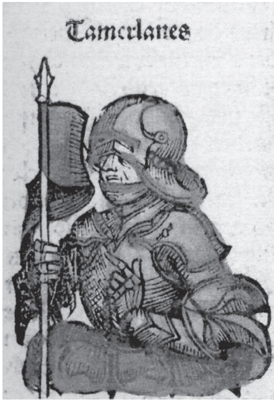
Fig. 2. Tamerlane. From Hartmann Schedel, Liber chronicarum , 1493. (After Taschen facsimile edition, 2001)

to include the figure of Tamerlane (fig. 3), the presence of which is explained by its placement on the same page as the portrait of the fourth sultan, Bayazid I. 44 The rather haggard Ottoman sultan is depicted in profile, while the more energetic figure of Tamerlane appears in three-quarter view and identified as TAM-BEBL (presumably the second B should be read as R ). The portrait of Bayazid—like those of the remainder of his dynasty—displays some level of concern for costume and headgear appropriate to a Turkish ruler, but it is difficult to detect any such scruples in the representation of his Central Asian counterpart. Although the second half of the abbreviated inscription running around the head makes some reference to his ethnicity in the words TAR IMP (i.e., “emperor of the Tartars”), and the accompanying text notes his origins in the Scythian regions and his dominion over the regions of Parthia and Soghdia, everything about the face, hairstyle, and clothing appears to be Western European in character.