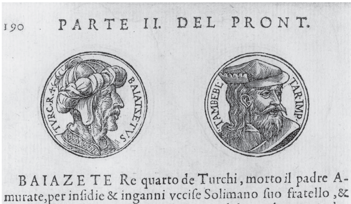
Fig. 3. Bayazid (left) and Tamerlane (right). From Guillaume Rouillé, Promptuarium iconum (Lyons, 1553), 190. The Bodleian Library, Oxford: 3 Delta 188.

ing his image is one of a small repertoire of similar devices used repeatedly through the book. 48