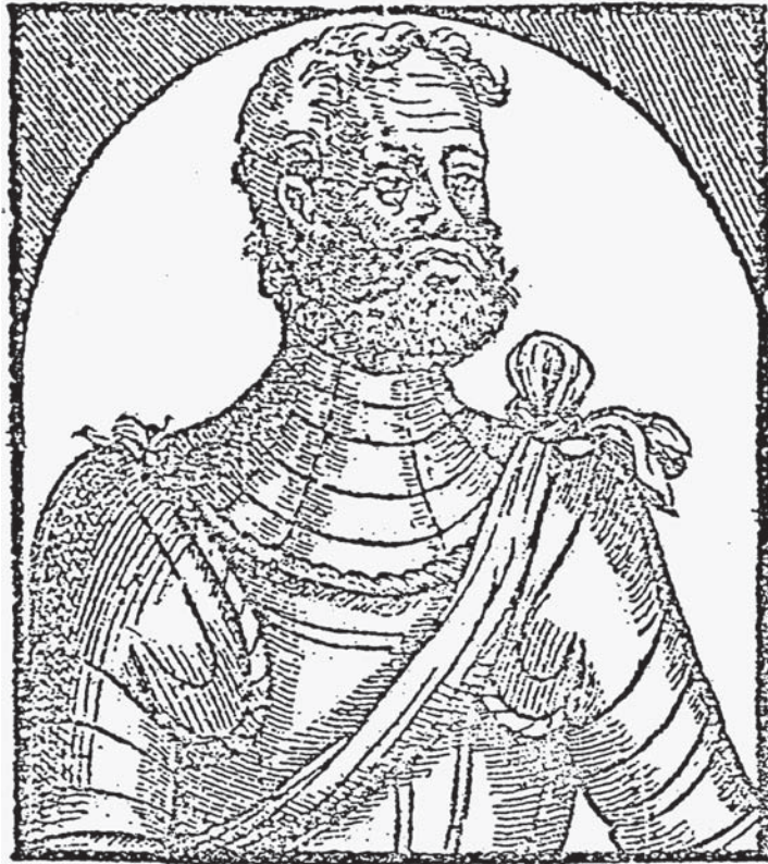
Fig. 1. Plate from the 1593 edition of Christopher Marlowe, Tamburlaine the Great . (After Scolar Press Facsimile edition, 1973)

a matter of cost, as plays of this sort were issued in relatively cheap octavo editions unlike the more luxurious large-format volumes made for authors such as Paolo Giovio and André Thevet (see below). An engraved portrait, identified in the legend as “Tamburlaine, the great,” is to be found facing the first page of the second part of Marlowe’s play in the first and second editions (London, 1590 and 1593). 40 His appearance is that of an English nobleman, though perhaps his high brow and fair complexion lend him a certain similarity to Marlowe’s account of the physical characteristics of his Tamburlaine (fig. 1). There is little reason to devote serious attention to this image, however, because the engraved plate had already been used on the title page of a pamphlet published in London in 1587 and entitled A Short Admonition or Warning, upon the Detest-