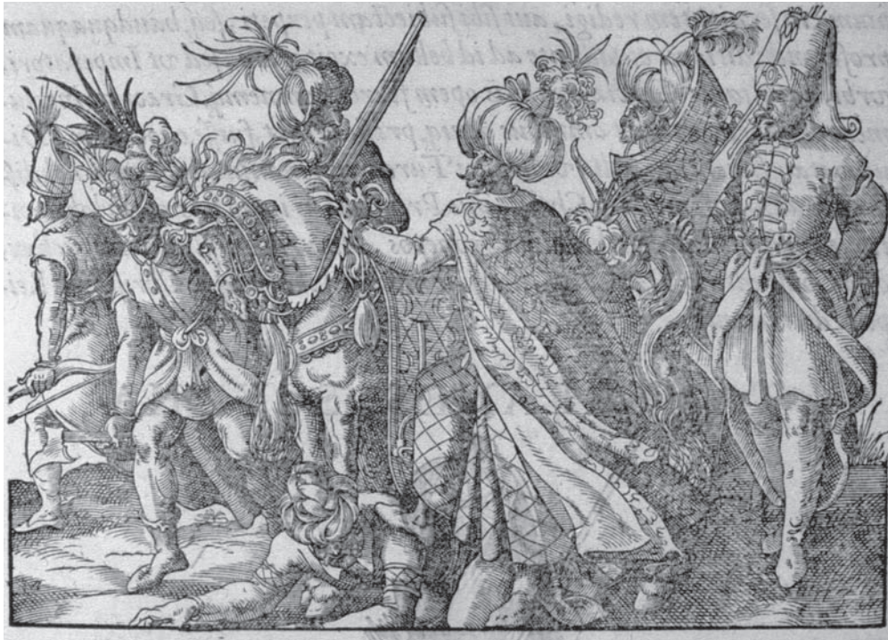
Fig. 14. Tamerlane and Bayazid. From Philip Lonicer, Chronicon Turcicorum (Frankfurt, 1578), fol. 14r. The Bodleian Library, Oxford: H.5.2 Art. (Reproduced by permission of the Bodleian Library)

conventions in the depiction of eastern rulers drawn from earlier manuscript illustrations, while Lonicer's Chronicon Turcicorum employs visual devices seen in the representations of the Ottoman sultan Süleyman I, adding some details of costume and weaponry to suggest the origins of Tamerlane among the warriors of the Russian and Central Asian steppes.