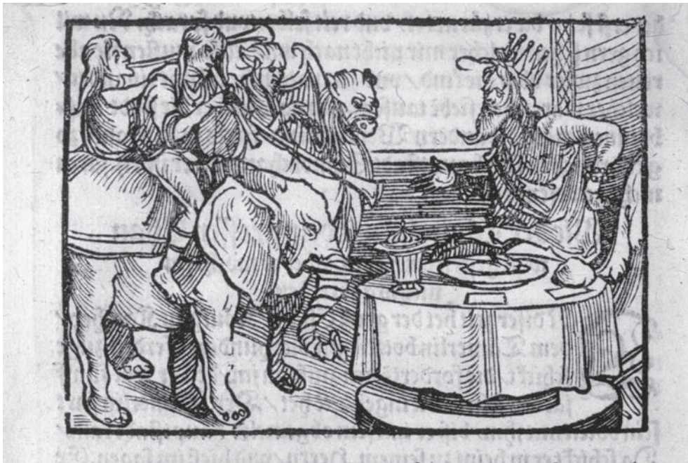
Fig. 13. Tamerlane feasting. From Johannes Schiltberger, Ein wunderbarliche vnnnd kurtzweilege History (Frankfurt, ca. 1549), sig. Giii v. The Bodleian Library, Oxford: Vet.D1 e.67. (Reproduced by permission of the Bodleian Library)

the types of headgear found in the 1563 woodcut and those in Lonicer's image is in the added feathers. The practice of attaching feathers onto fur or felt caps is associated with Mongol, Timurid, and Turkman royal processions, 83 though comparison might also be made with attached features on top of the helmet-crown in the famous profile portrait of Sultan Süleyman. 84 Attendants at Ottoman imperial ceremonies were also provided with ornamental feathers, which can be seen in Ottoman miniatures and European drawings of parade helmets.