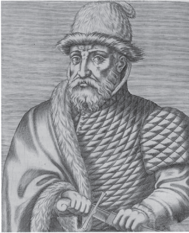
Fig. 6. Tamerlane. From André Thevet, Les vrais portraits et vies des hommes illustres Grecz, Latins, et Payens (Paris, 1584), fol. 630r. (Reproduced by permission of the Syndics of Cambridge University Library)