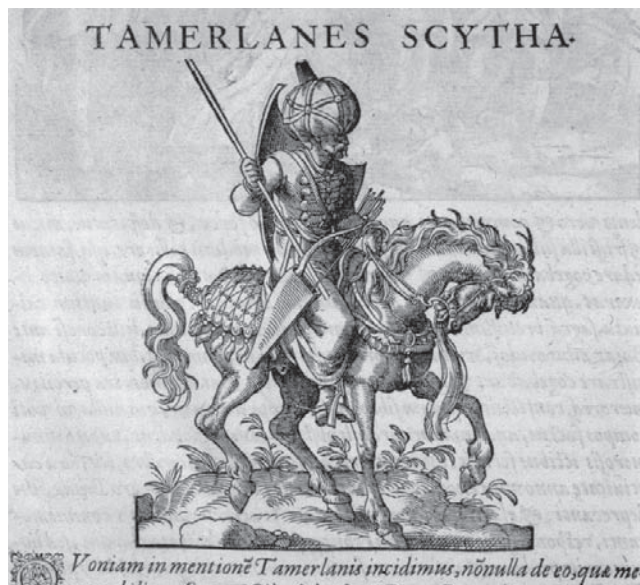
Fig. 9. Equestrian portrait of Tamerlane. From Philip Lonicer, Chronicon Turcicorum (Frankfurt, 1578), fol. 14v. The Bodleian Library, Oxford: H.5.2 Art. (Reproduced by permission of the Bodleian Library)

An equestrian portrait appears in Philip Lonicer’s Chronicon Turcicorum (Frankfurt, 1578). Identified in the caption as “Tamerlanes Scytha” (fig. 9), it is perhaps the most ambitious of the portrait images, showing the ruler mounted on a sinuous horse within a shallow landscape space. Sitting in a high-fronted saddle, the ruler is made more impressive by his preternatural scale in relation to his mount. Although the concept of the equestrian portrait was well established in Europe by the last quarter of the sixteenth century, Lonicer’s Tamerlane is not a typical example of the genre, in that his weaponry includes a bow and arrows (the standard accessories of a Turco-Mongolian warrior). His clothing and headgear suggest that the designer of the woodcut in the Lonicer image may have employed diverse sources, including representa-