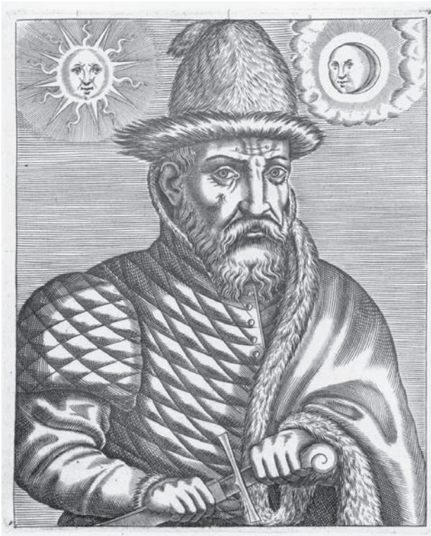
Fig. 8. Tamerlane. From Chalkokondyles, L'histoire de la décadence de l'empire grec et établissement de celui des Turcs par Chalcocondile Athenien (Paris, 1662), 52. The Bodleian Library, Oxford: T.4.11 Jur. (Reproduced by permission of the Bodleian Library)

(1539), Matthias Gerung (1544–48), and Gerhard van Groeningen (ca. 1565–71). The conjunction of the sun and moon appears in representations of the breaking of the Sixth Seal (Revelation 6:12–13) and, less frequently, the sounding of the trumpet by the Fourth Angel (Revelation 8:12). 65 Though the precise significance of the motifs in the 1662 portrait is not entirely clear, it seems likely that the widespread understanding of Tamerlane as a “scourge of God” and as one of the “people of Magog,” or Massagetae (see below), made the apocalyptic imagery appropriate to this image.