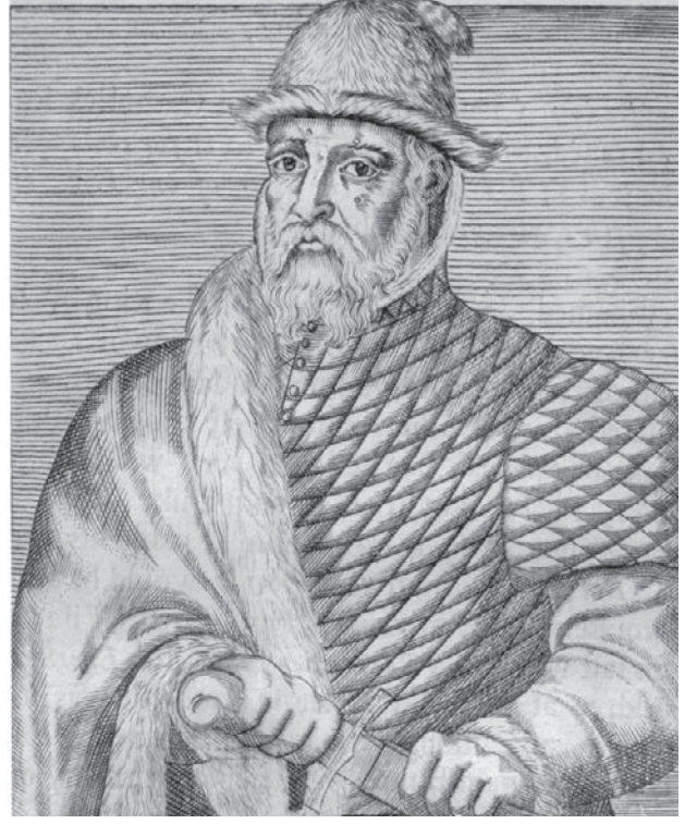
Fig. 7. Tamerlane. From André Thevet, Prosopographia or, Some Select Pourtraitures and Lives of Ancient and Modern Illustrious Personages (Cambridge, 1676), 56. (Reproduced by permission of the Syndics of Cambridge University Library)

arms and diminutive hands of this image suggest it is the work of a less skilled artist.