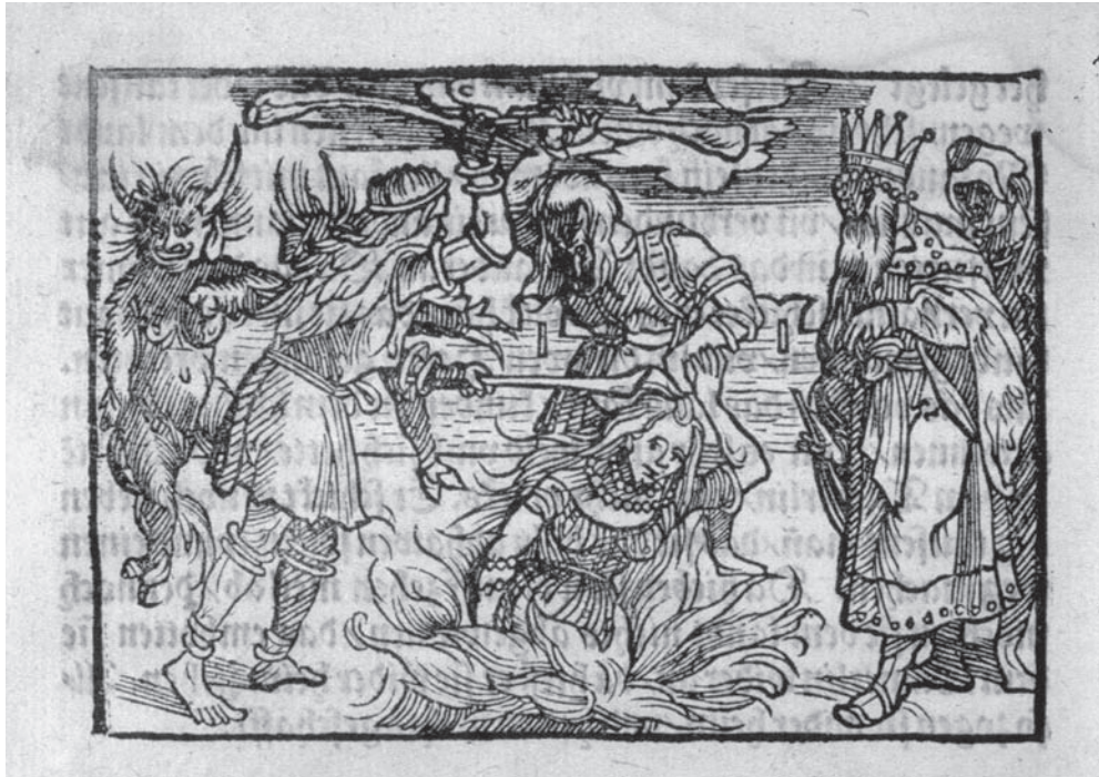
Fig. 12. Tamerlane witnessing a scene of brutality. From Johannes Schiltberger, Ein wunderbarliche vnnnd kurtzweilige History (Frankfurt, ca. 1549), sig. Gii v. The Bodleian Library, Oxford: Vet.D1 e.67.

sacre of the children of the city. The act seen in the woodcut may refer to the story found in many other sources that Tamerlane ordered the murder of the virgins and children sent by the people of Damascus to plead for clemency. 79 Demons are sometimes also found in representations of Ottoman sultans in printed books of the sixteenth century. 80