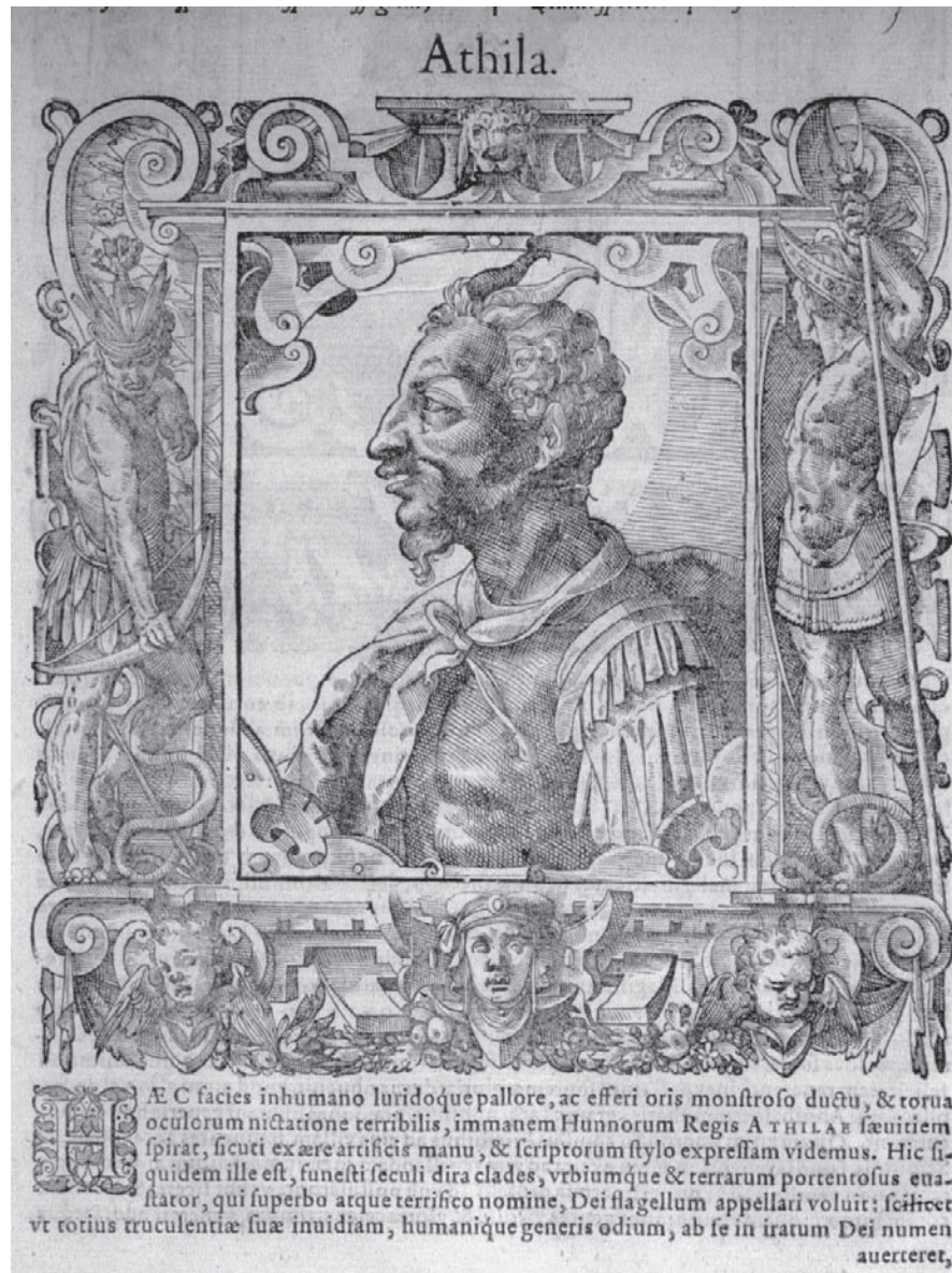
Fig. 15. Attila the Hun. From Paolo Giovio, Elogia virorum bellica virtute illustrium (Basel, 1575), 10.

lane were believed to function as “scourges of God,” the instruments of divine will sent to test the faithful and to punish both individual and collective sins. 108 This theme is well developed in the literature about Tamerlane and forms part of the explanation for his rapid ascent from his supposedly humble origins. 109 It may be that the staring eyes, a common feature of the Giovio and Thevet portraits, are meant to function as