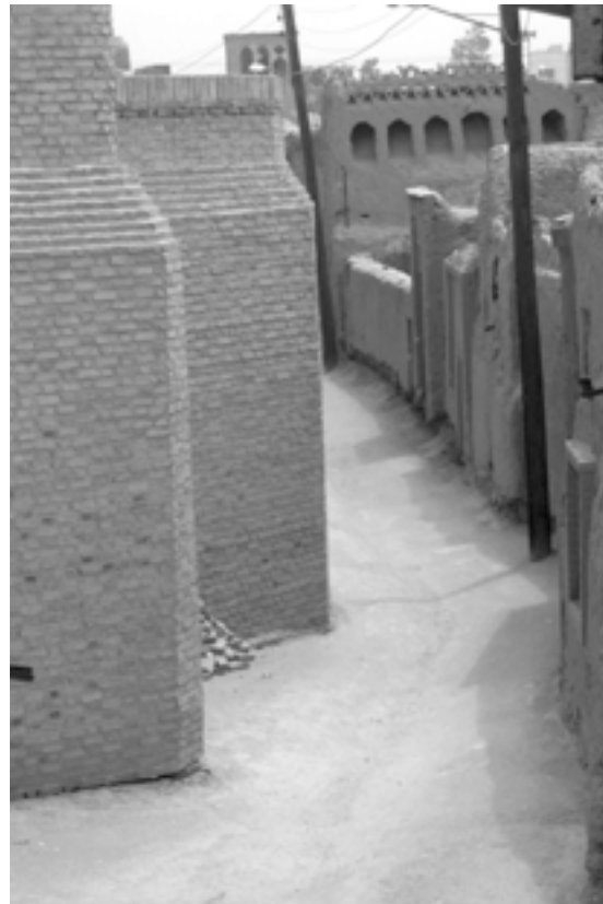
Figure 10: Congregational - Jame Mosque and hierarchy movement that remains.