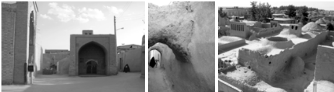
Figure 1: Samples of identity, scale, and character of Boshrooyeh city.

The Boshrooyeh urban texture was formed during the Safavid period, and its greatest historical context has been recorded in Khorasan. It is among the ten historic cities based on its old brick, clay texture, and traditional fabric. Figure 1 shows the character, identity, and physical