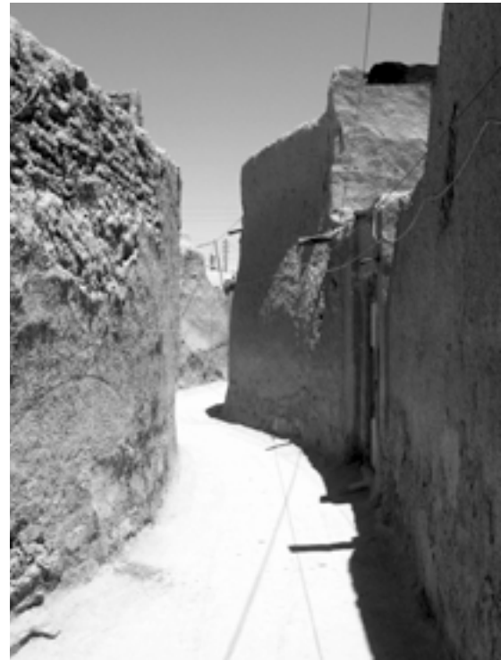
Figure 4: Type of road and hierarchy movement in Boshrooyeh city.