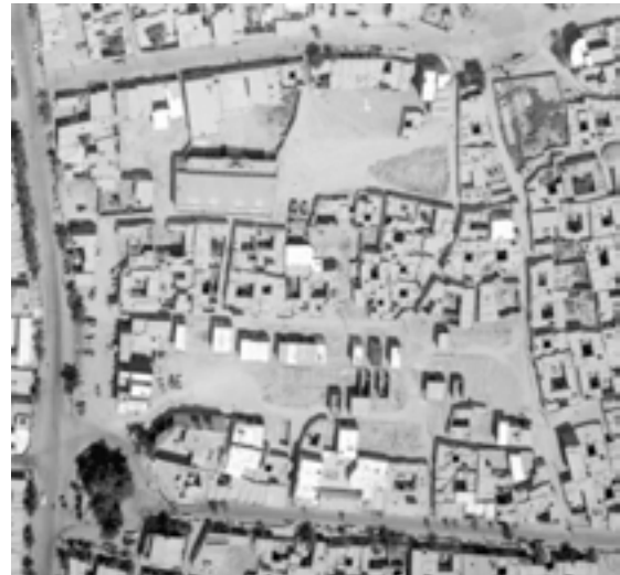
Figure 12: Block in 1956 and block fragmented in 2003.