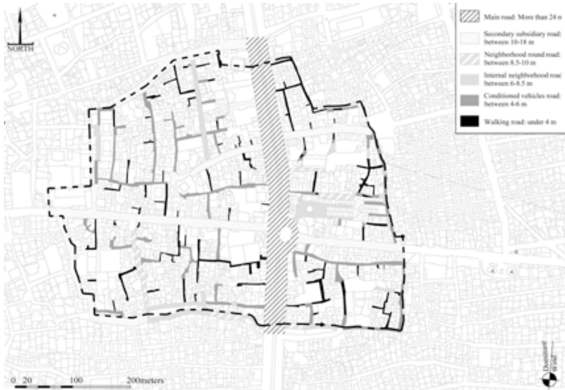
Figure 6: Roads map of Boshrooyeh in 2008

Based on comparisons of old and new road maps of Boshrooyeh, we found the following