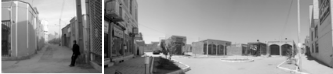
Figure 9: Part of the old and new Bazaar (Source: Authors).

Spatial coherence, which is obvious in traditional tissues, is integral to desert cities. New blocks in the city were built without any continuity of form and hierarchy with the traditional part of the city. New islands are amorphous and irrelevant because of their surrounding space. The coordinated system of the town has been destroyed in Boshrooyeh due to disintegrating urban fabric, i.e., the main square, islands and streets. Any interference in the urban tissue requires knowledge of all factors that affect the city.