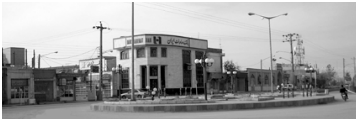
Figure 11: Wide road, block destroyed, new main square in the city.