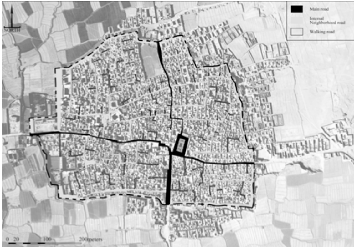
Figure 5: Roads map of Boshrooyeh in 1956.

The square has changed significantly in recent years. These changes include both its functions and form. Its form changed from rectangular to oval, and it now functions as a roadway. However, it still has public functions and has retained its centrality. Currently, the four main roads enter it.