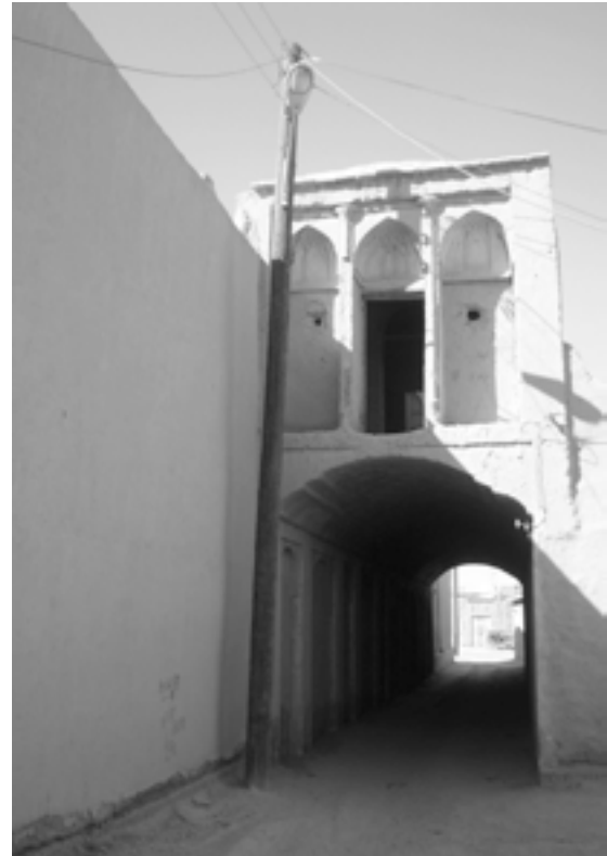
Figure 3: Half covered passageway (Sabat) as semi-private space (Source: Authors).

of the neighbourhoods. Therefore, in Iran gates were separate semi-private and private parts of the network from the public spaces. Impasses and internal alleys lead to passages to other neighbourhood components (Ahmadi, 2009).