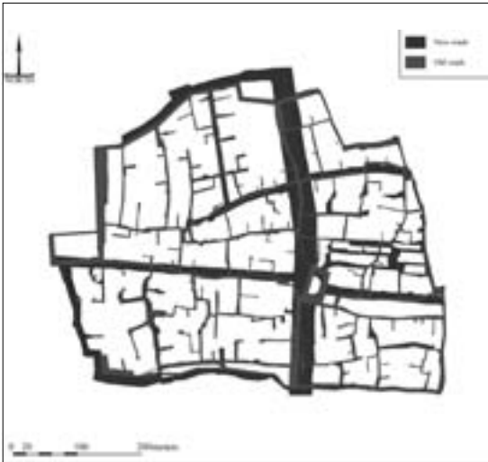
Figure 7: Comparison between the old and new roads.