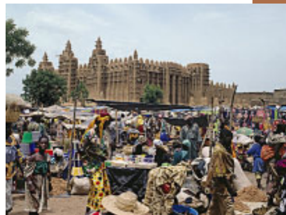
People are gathered for market day in Djenné with the Mosque in the background.

Due to a lack of qualified contractors for monument conservation in Djenné, the work was entirely in-house managed. This also enabled direct quality control, flexibility in resource allocation and on-the-job training in conservation methods to more than 120 community masons.