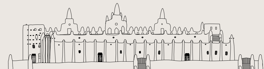
Below: the west elevation of the Mosque.