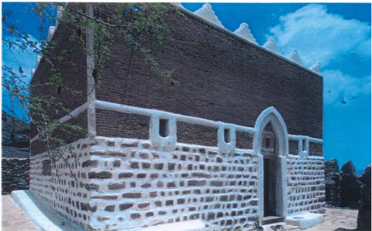
Below: The entrance to the mosque on the west façade.