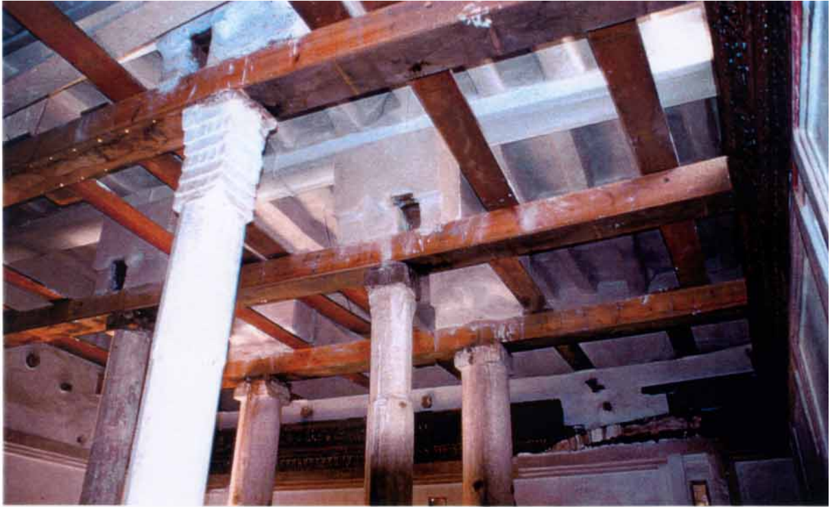
Above: The coffers of the timber ceiling were completely dismantled and reconstituted during the restoration process.