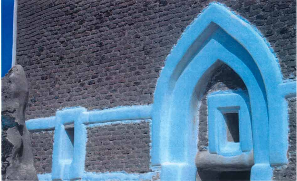
Above: South façade; window and door openings are treated with qudad, which is lime mortar and crushed volcanic stone .