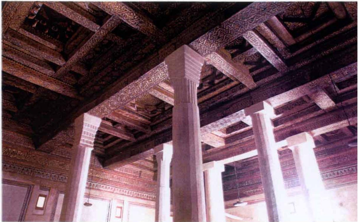
Below: The restored ceiling is decorated with painted and gilded floral and geometric patterns as well as bands of writing.