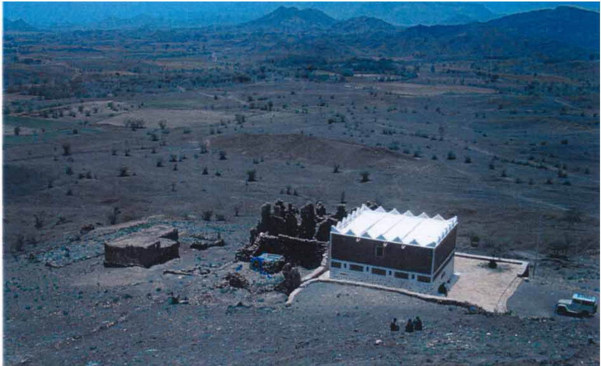
Above: The al Abbas Mosque is situated 38km southwest of Sana'a near the village of Asnaf. The ruins of an earlier mosque and a stable can be seen at the left of the mosque.