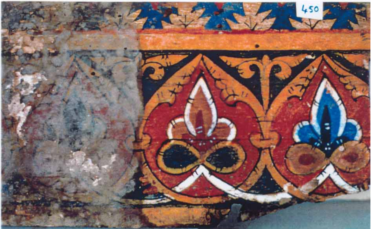
Below: Detail of a floral pattern showing both a restored portion (right) and the condition before restoration (left).