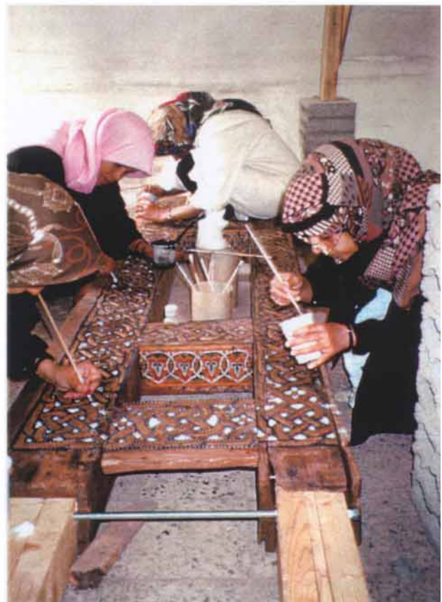
Right: The timber ceiling was removed and carefully cleansed at the Sana'a Museum.