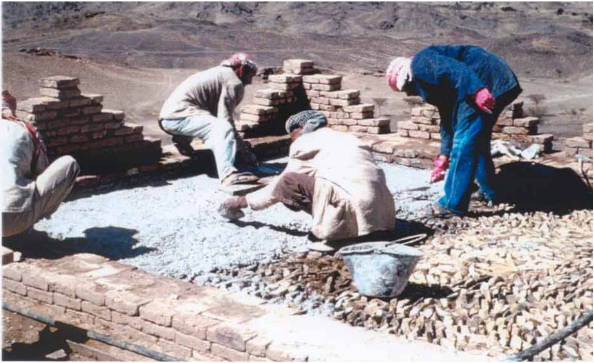
Above: The roof of the mosque was covered with a layer of mud mortar and crushed stones on top of it to hold the qudad.