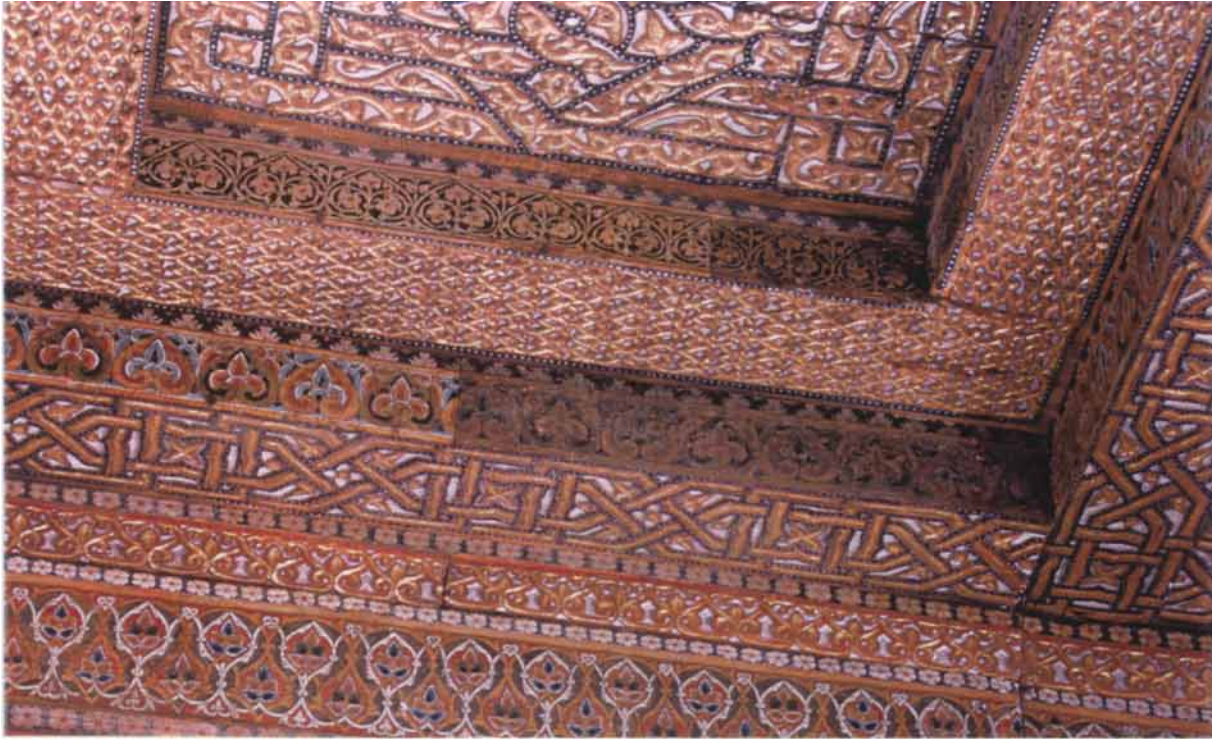
Above: Detail of a coffer; the restoration work involved very careful cleaning of the painted and gilded surfaces.