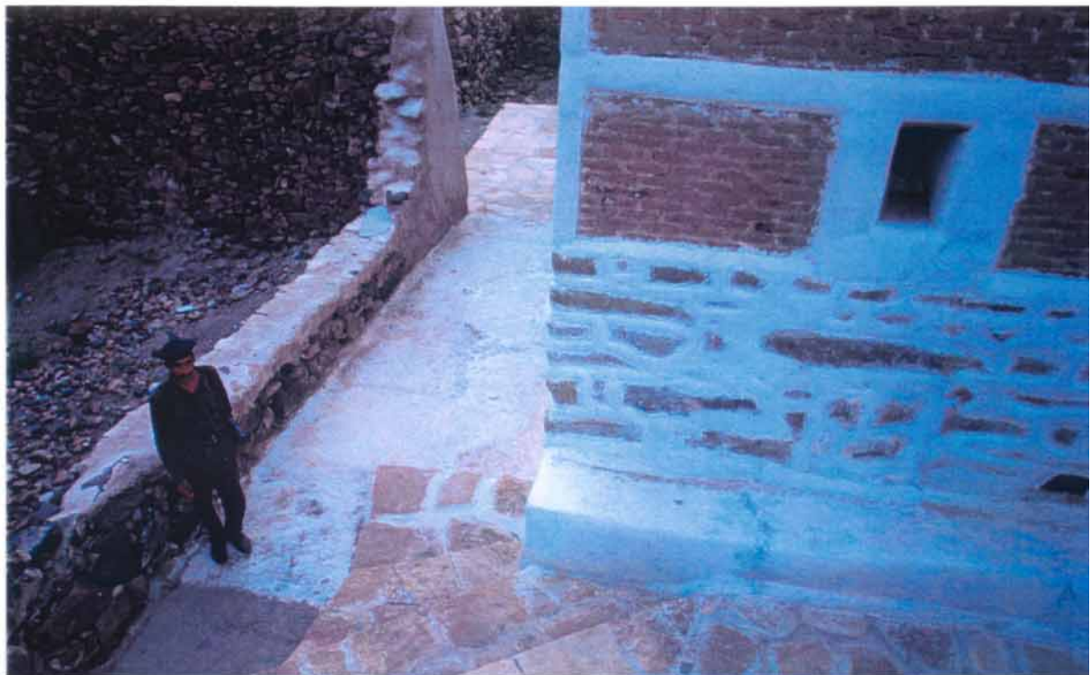
Below: The stove paved platform around the mosque can be removed if excavations around the mosque are necessary.