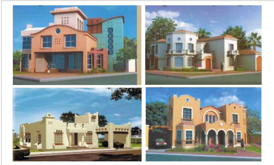
Figure 1: Examples of Proposals of Affordable Houses Developed by Architects for Real Estate Companies in the Kingdom of Saudi Arabia

has conducted intensive investigations on housing and urbanization in Qatar. Based on her studies, a number of issues are revealed (Nagy, 2004). The economic circumstances in the country have created a situation in which it is economically viable for Qataris to construct new homes or renovate old ones (Nagy, 2004). The first official housing policy in Qatar was constituted in the mid 1960s providing for the distribution of homes to the disabled, elderly, unemployed, and those who were asked by the government to relocate in order to accommodate urban development plans.