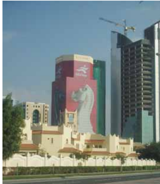
C. New Housing Developments in Strategic Locations within Doha