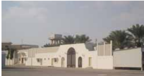
A. A Renovated One Story House Built in the 1960s, Doha, Qatar

an independent designer of an architectural office. Most Qataris use the grant to build two story villa style homes with a small service annex on the periphery of the property. In some cases another annex is added as for male guests. These houses are dramatically different from the one story houses that were built around courtyards. It can be argued that significant changes in the house form, style, and the overall physical appearance through the new housing policies (Figure 2). The question in this context is: have these changes influenced the