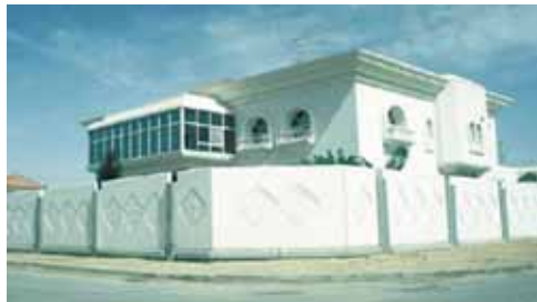
B. A Two Story Affordable House in Doha Based on the Housing Policy of the 1980s.