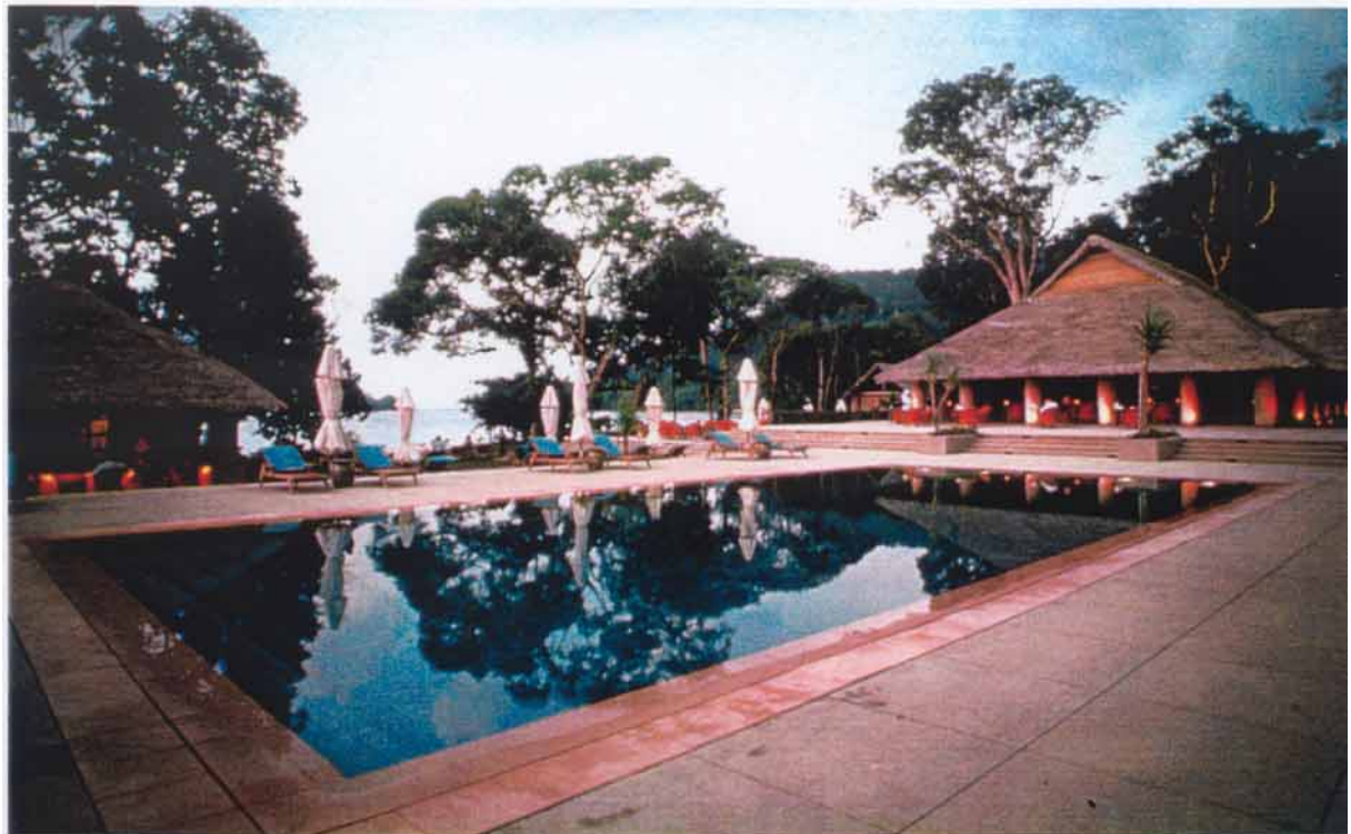
Below: The palm-roof beach club as seen from the pool terrace.