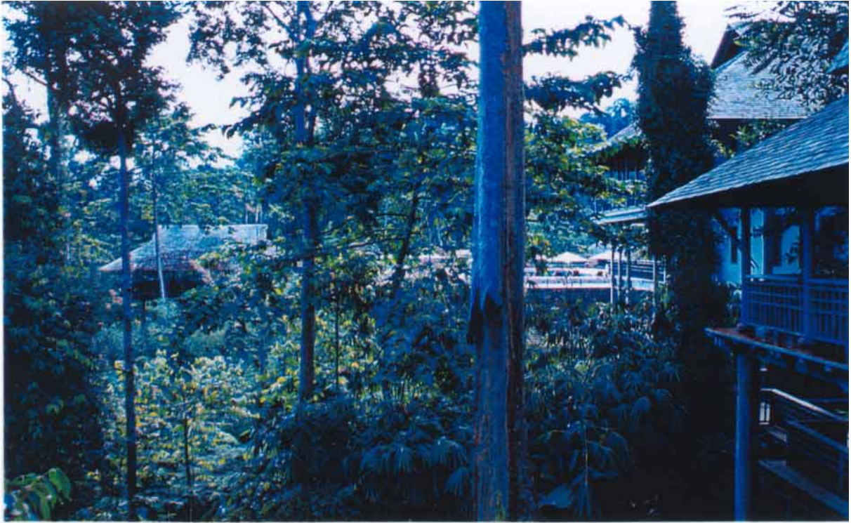
Above: View from the balcony of a guest room wing past lush tropical rainforest.