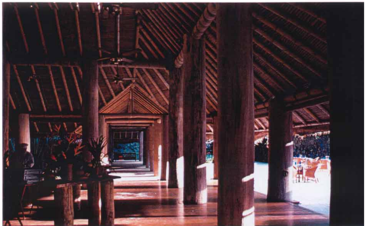
Below: Tree trunk columns, felled during the construction of the resort, support the restaurant in the beach club.