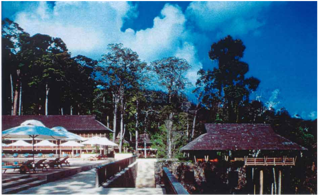
Above: View of the pool deck (left) and pavilion restaurant (right); the grand stair in the centre leads to down the terraced site.