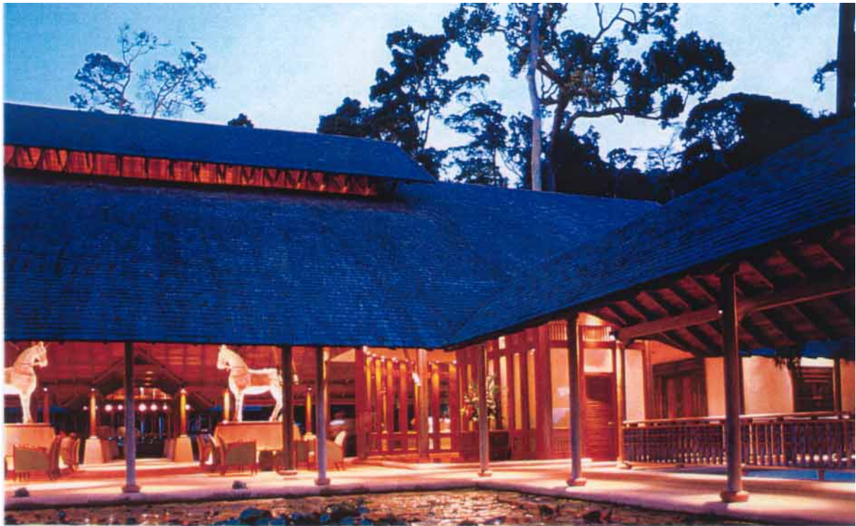
Above: View from the forecourt to the entrance lobby past the water garden .