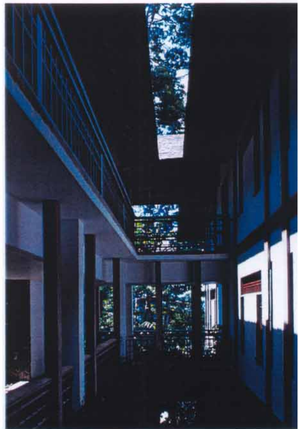
Right: Guest rooms are accessed through a series of detached, open-sided, covered walkways which permit cooling breezes .