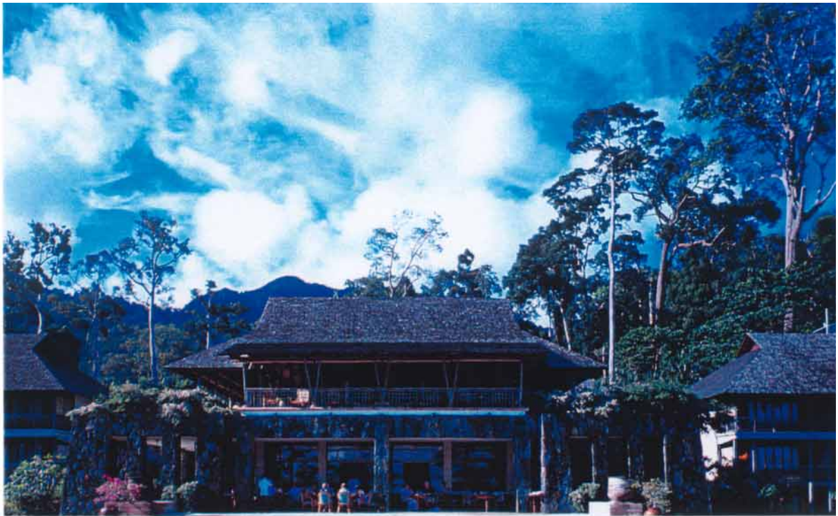
Above: Two-storey, stone and timber lounge and restaurant.