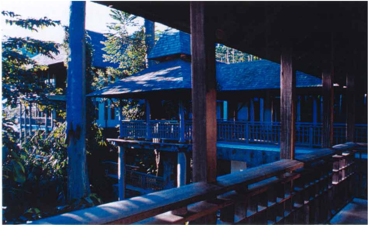
Above: View from the timber verandah of the guest wing toward the presidential suite.