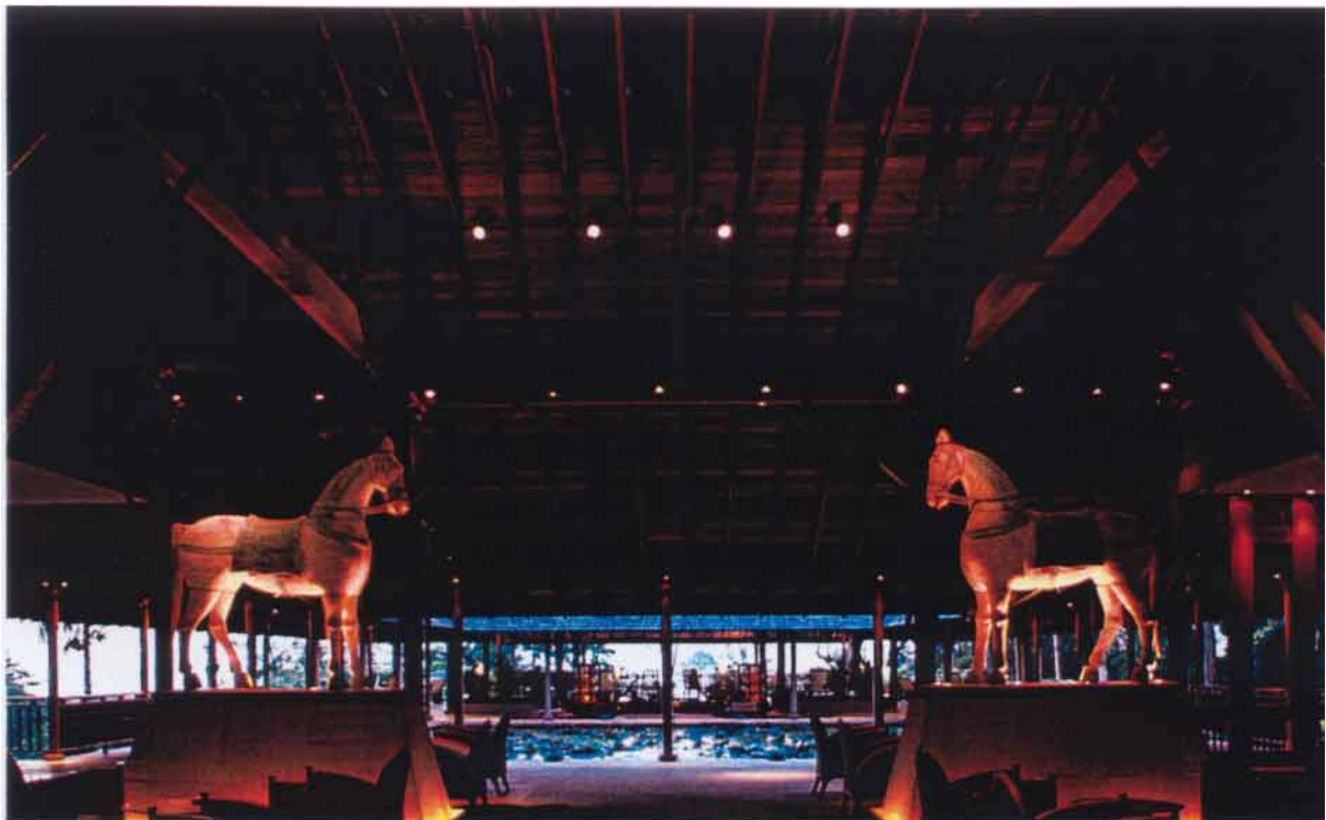
Below: View from the entrance lobby; the lack of surrounding walls allows for natural ventilation and unobstructed views of the site.