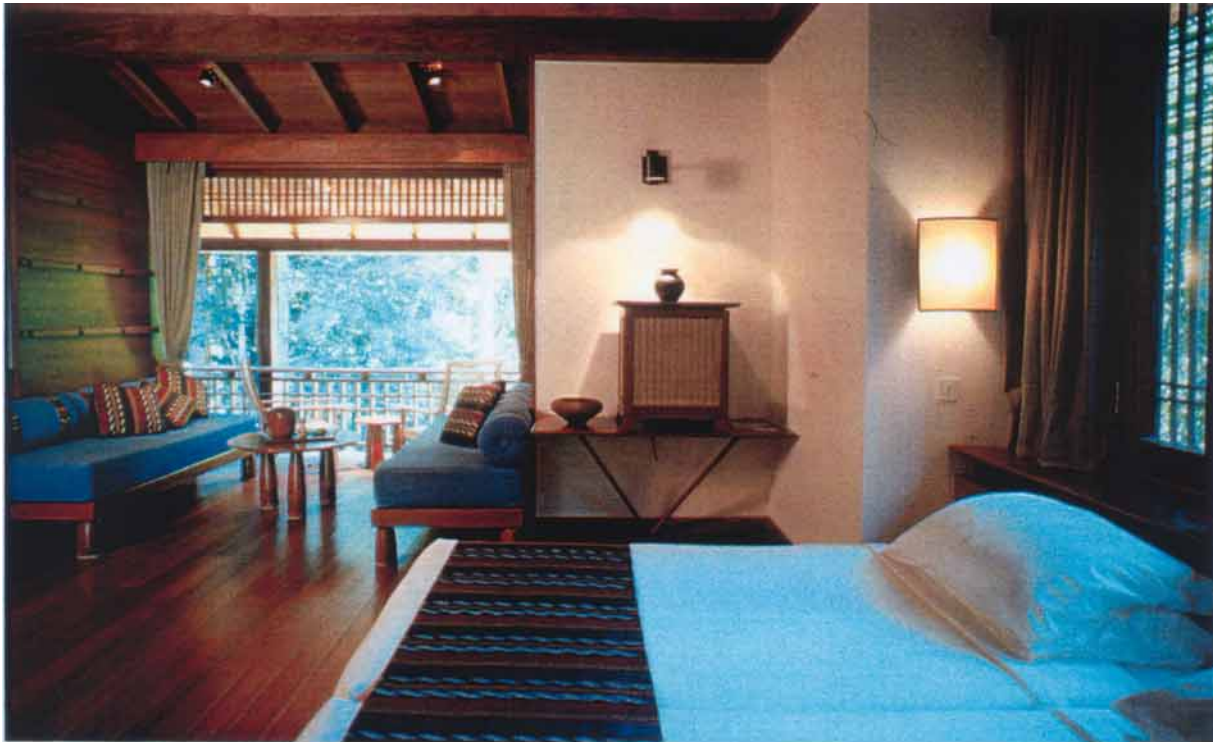
Above: Interior view of a typical villa bedroom open to a private verandah.