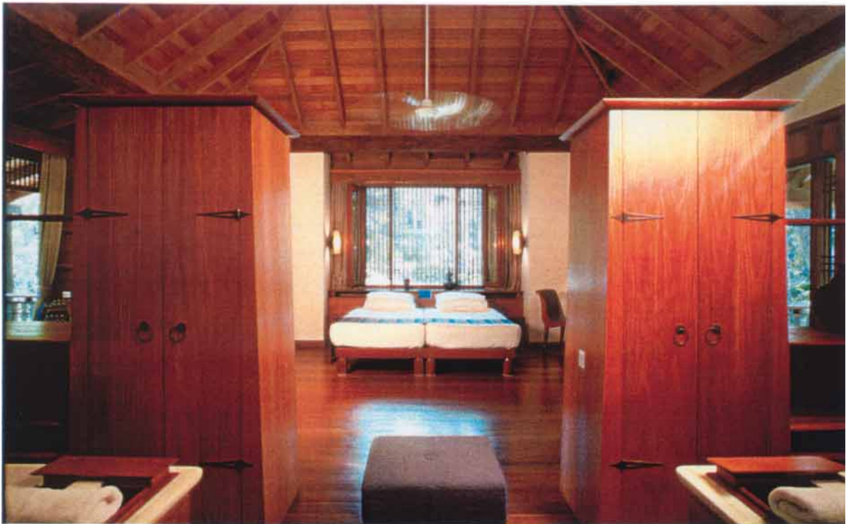
Below: Interior view of a typical freestanding villa.