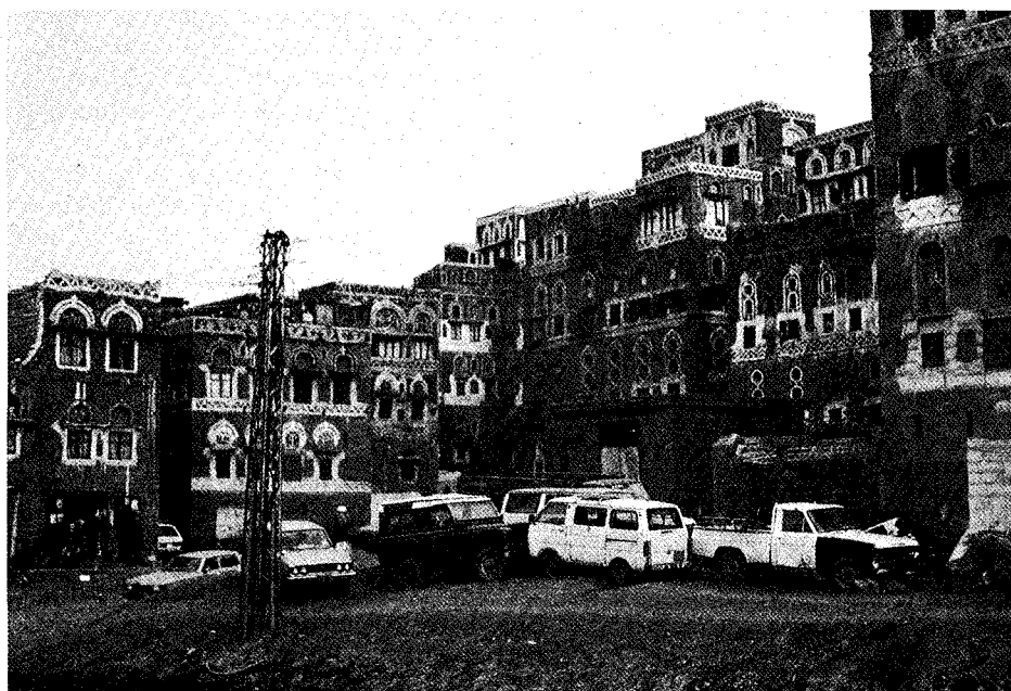
Sana'a, Yemen Arab Republic. New modes of transportation and electrification, while bringing many benefits, have not always been comfortably integrated with the traditional urban townscape.