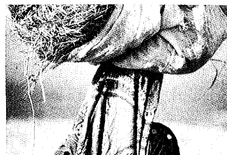
A scene from rural Yemen. Woman carrying straws on her head.