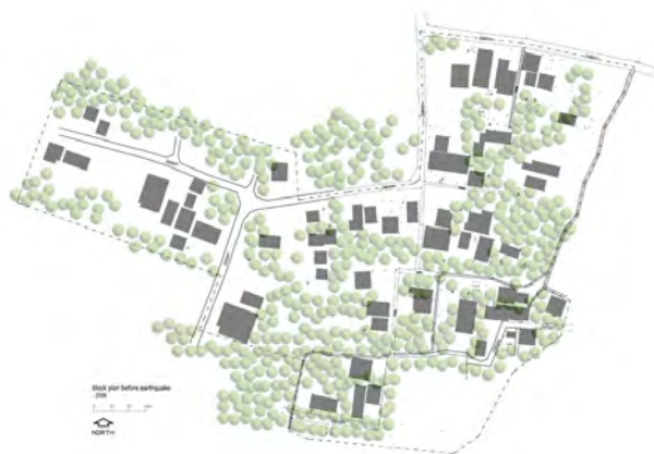
Site plan of the village before the earthquake, 2006.