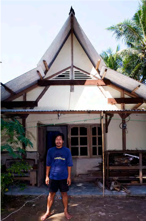
A owner in front of his dwelling.