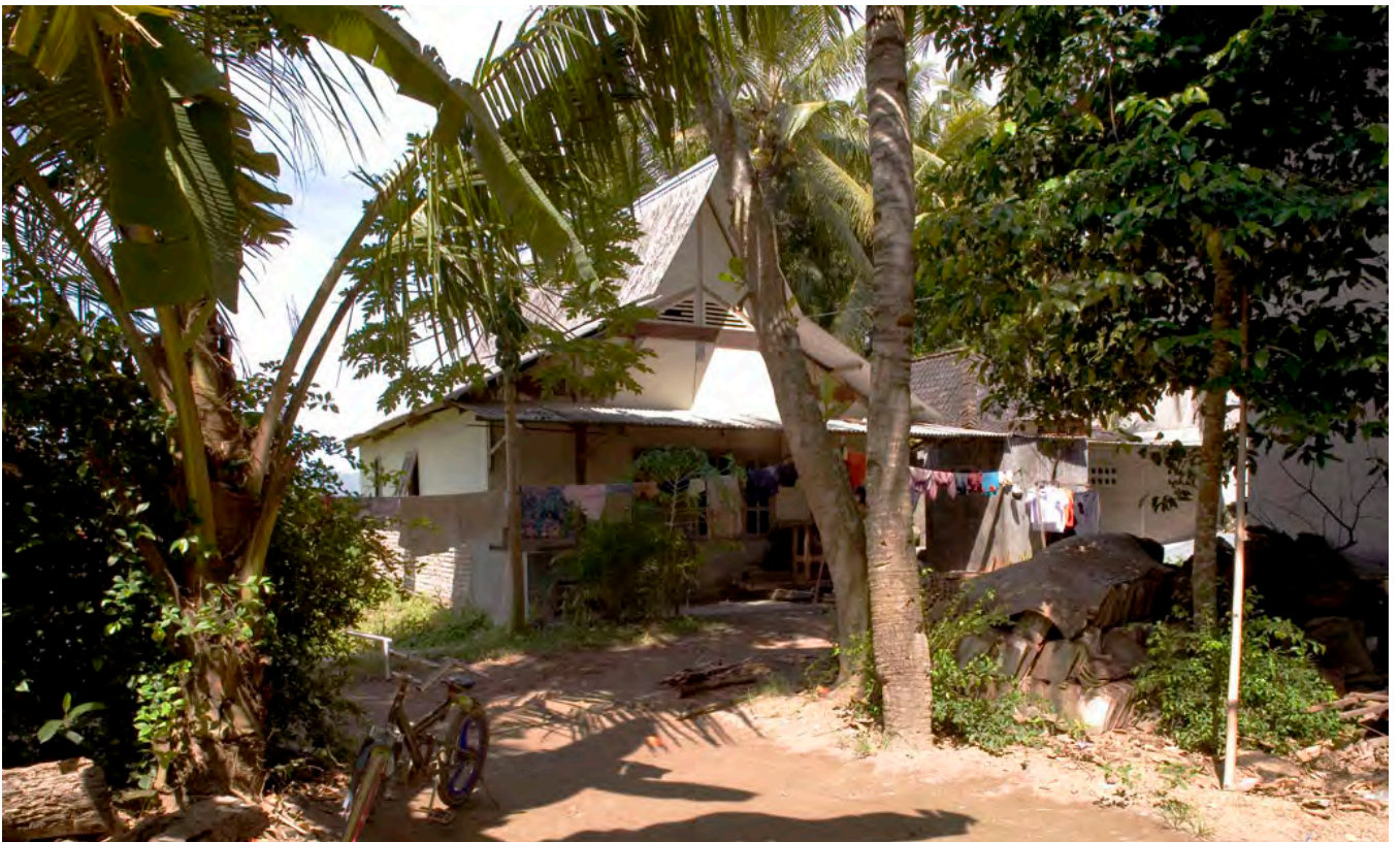
Front view of a house.