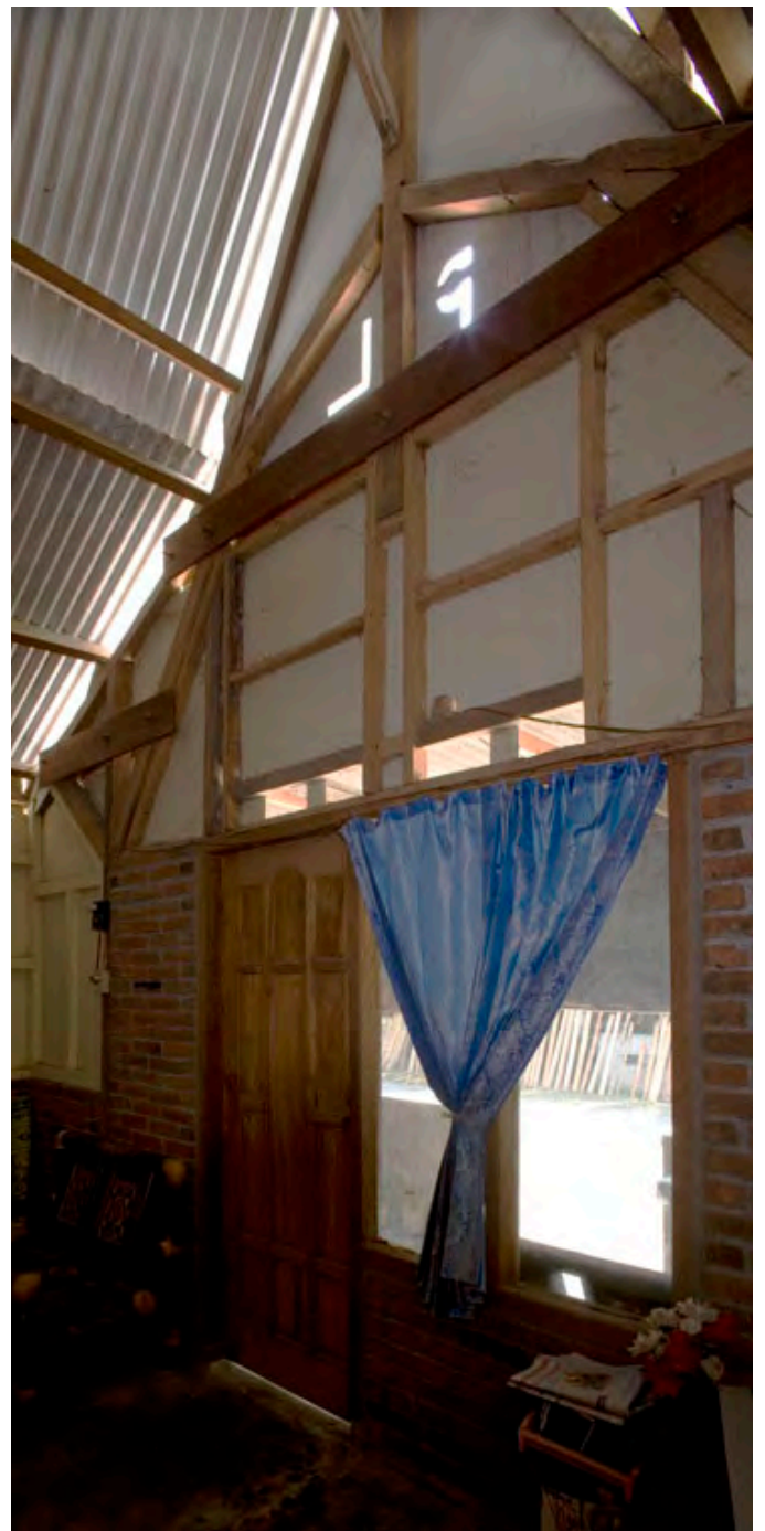
Interior view, with the panels on the wooden beams.