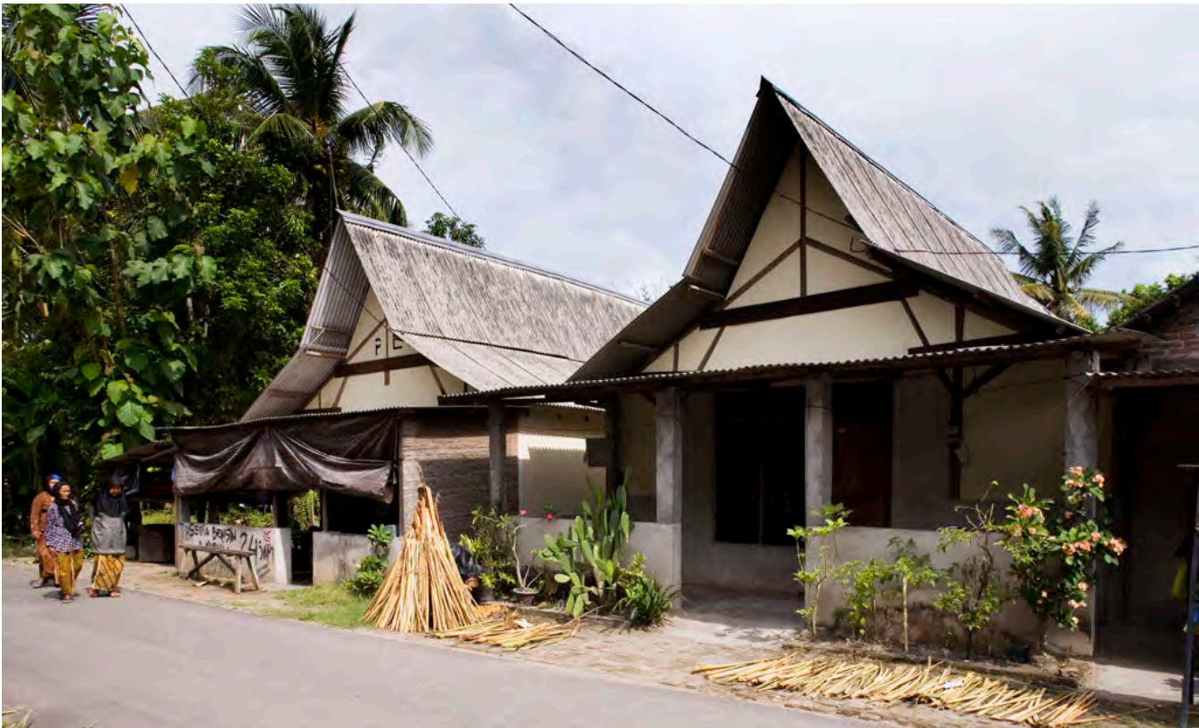
Street view of two houses.