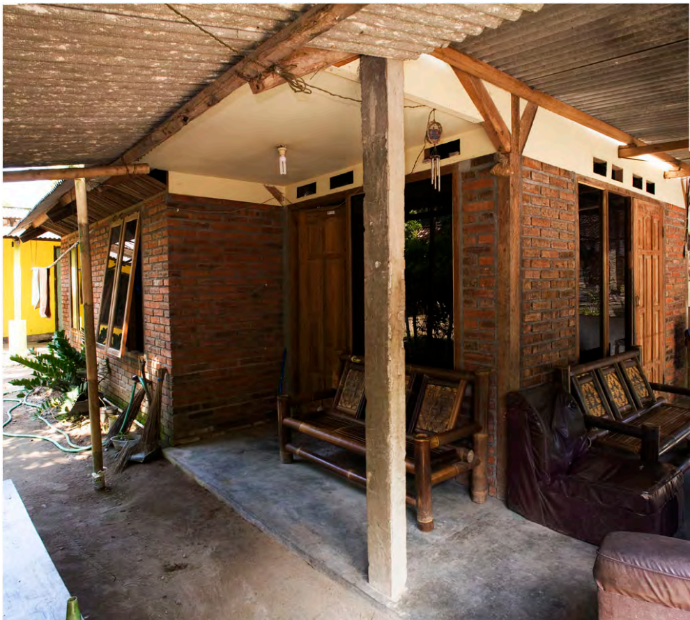
Terrace under the canopy roof, made of wooden beams and panels.