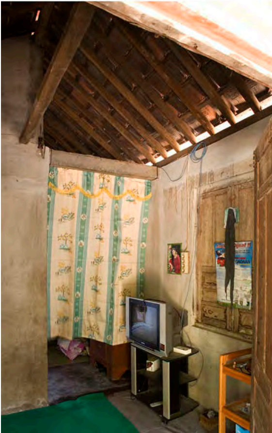
Living-room, and view on the wooden roof.