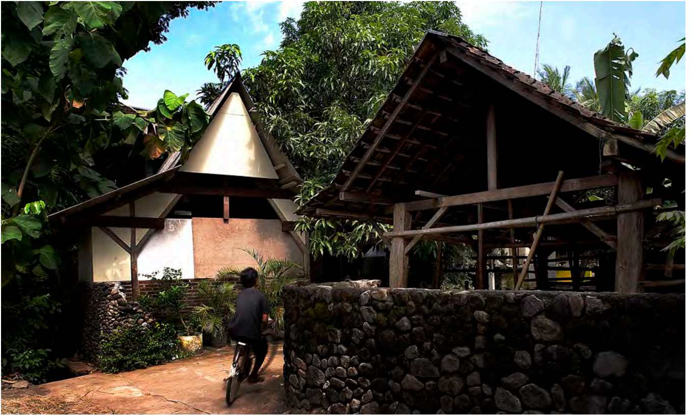
New structure based on the design of the traditional 'limasan' houses.