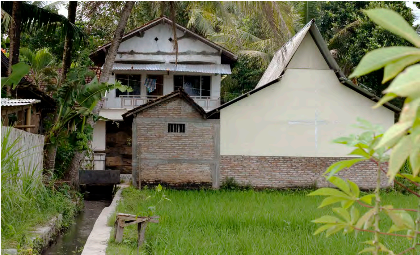
Rear view of a house made of brickwalls combined with fiber cement panels.