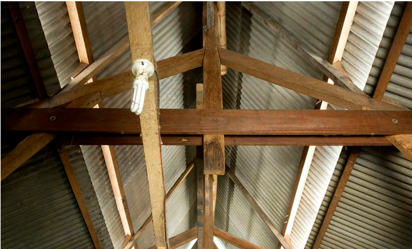
Detail of the wooden roof.