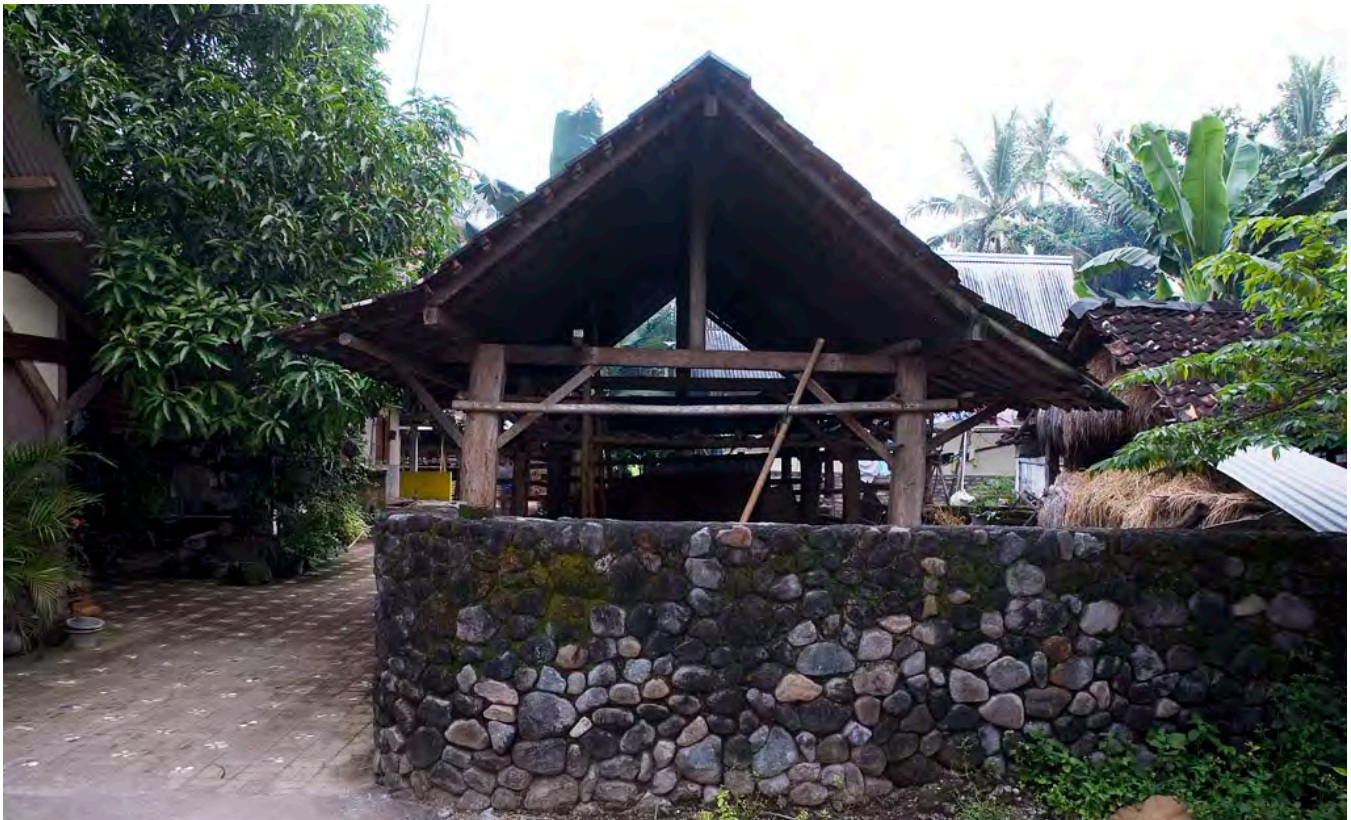
Traditional construction of the village, a 'limasan'.