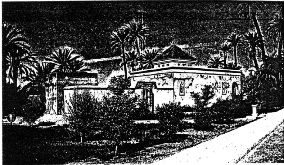
Military Hospital and Mosque, Marrakech, Morocco