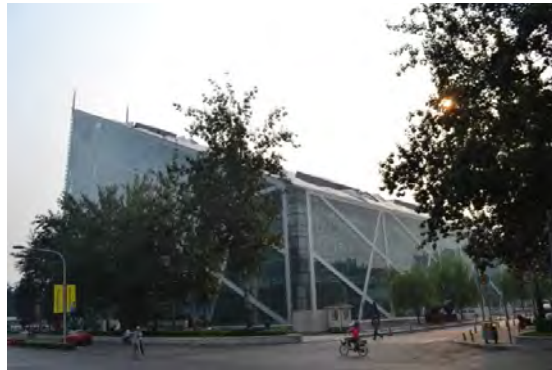
Figure 5. Parkview Green FangCaoDi in Beijing, China.