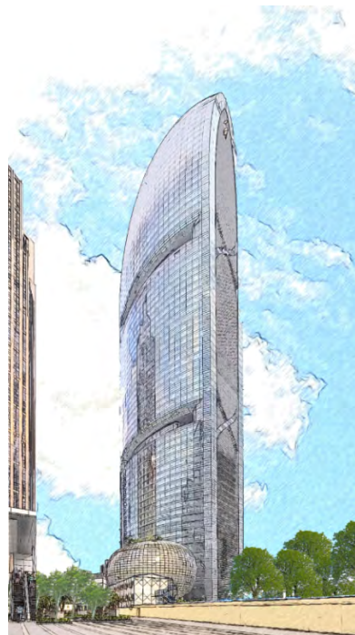
Figure 4. The Pearl River Tower by SOM in Guangzhou, China. (Sketch by author)