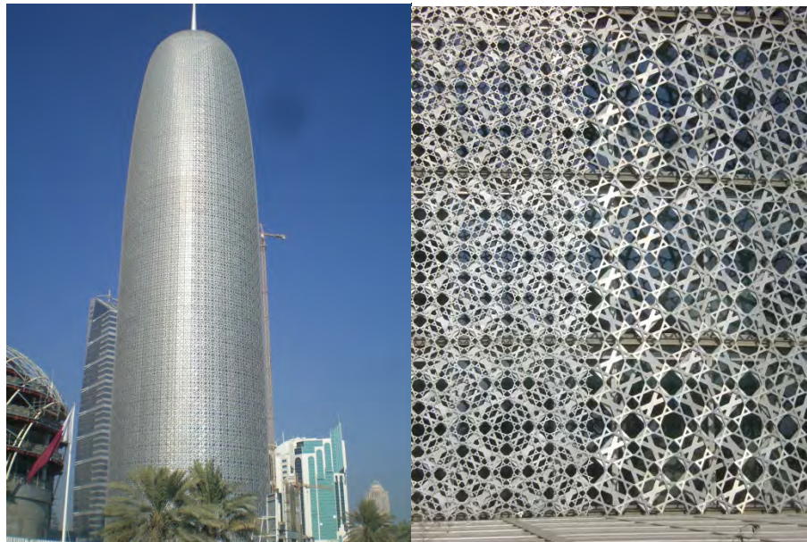
Figure 3. Doha Tower in Doha, Qatar.

the Awards Chair, commented that the towers' skin is the most innovative feature of the building. By modernizing the mashrabiya, the building evokes a new aesthetic rooted in the Arabic-Islamic culture. The tower's design is particularly remarkable given that architects in today's globalized world typically give little consideration to local climate and culture (Figure 3).