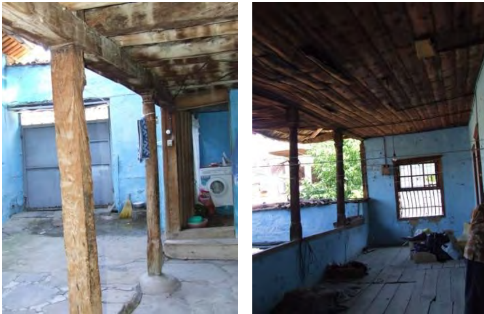
Figure 20. Case04 Sofa and Courtyard of the House (Source: Authors, 2008).

The two-story building is surrounded by stone masonry walls with a thickness of 0.75 meters supported by timber beams on all four sides on the ground floor, and only on two sides on the first floor, the façades facing both the courtyard and street are constructed with timber frame structure. The two rooms situated on the first floor differ from each other when the sizes are compared. The room facing the entrance façade's dimension are 3.70*4.60 meters and the other rooms dimensions are 4.60*4.75 meters. The length of the Sofa space is 10.30 meters and the depth of Sofa space is 2.90 meters long. Six timber post elements carrying the Sofa space have 0.15*0.15 meters cross-section dimensions and are placed within 2.00 meters intervals on the courtyard direction.