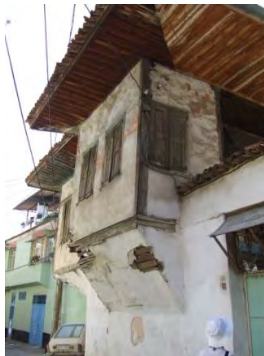
Figure 25. Case08 Exterior View of the building and Deteriorations on façade (Source: Authors, 2008).

The deteriorations started from the roof structure of the building, the plasters and the bagdadi coverings of the eaves have material losses and colour changes. The causes of rain can be easily seen from the shelter of the building such as; colour changes on all the wooden architectural elements like wooden shutters, wooden balustrades, and wooden façade elements. All of the projections are established very simple supported by three curvilinear timber elements, and the covering materials of the projections are lost due to the physical deterioration factors.