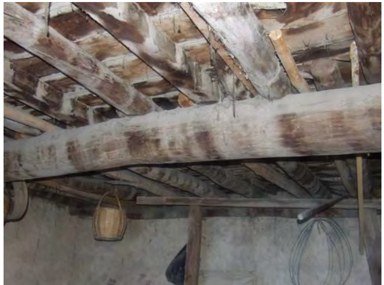
Figure 22. Case04 Deterioration Problems of the Roof (left) and Floor (right) (Color change) (Source: Authors, 2008).