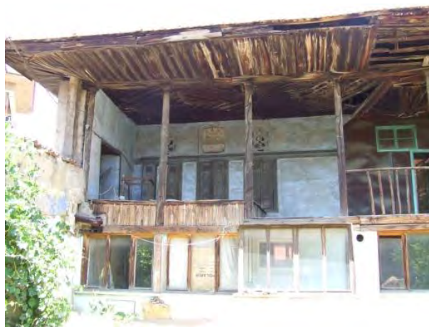
Figure 27: Case09 Courtyard View of the building.