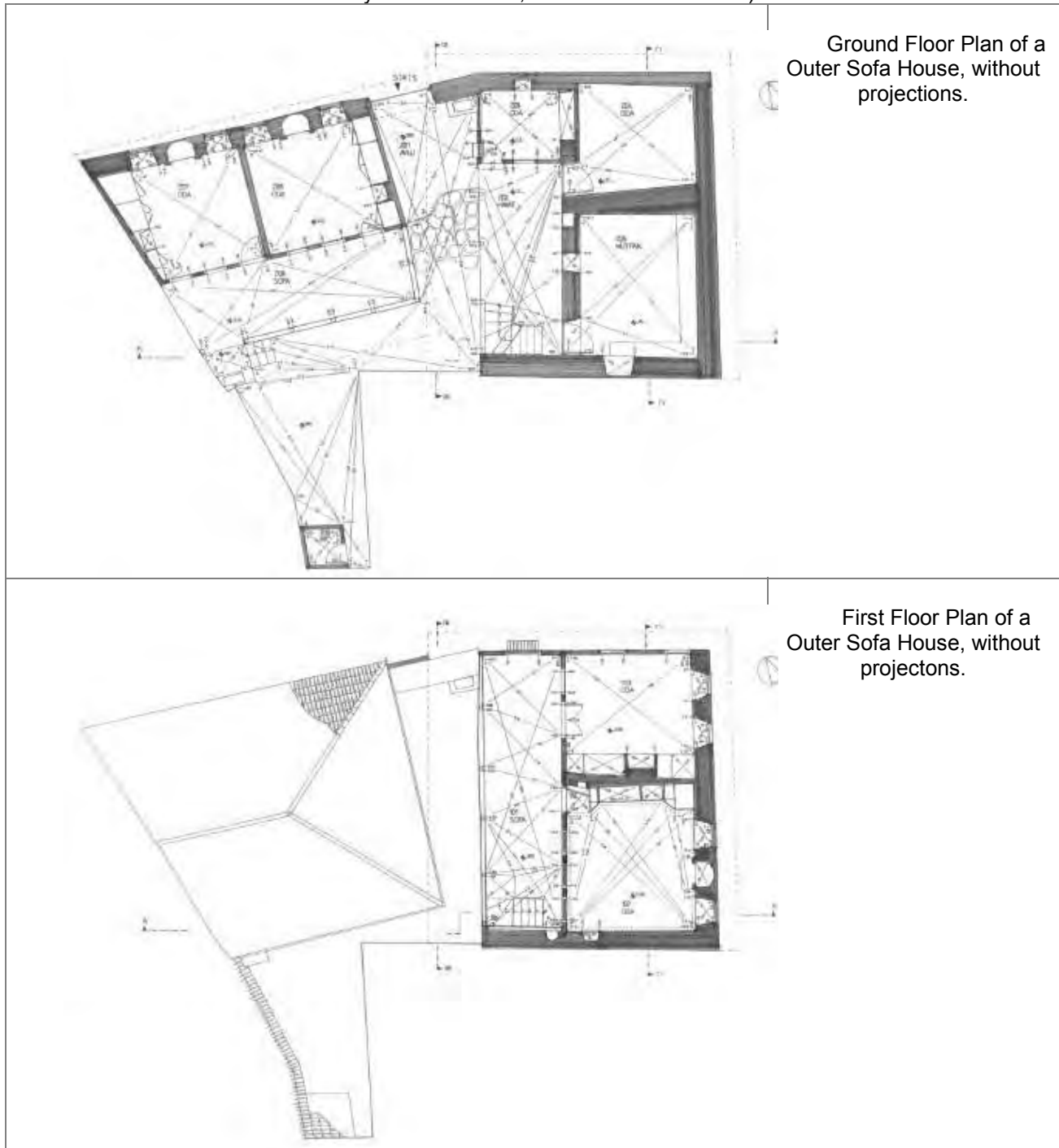
Table 1. Spatial Organization of Houses (Source: Re-arrangement of the drawings of a Kula House from Akgun District Documented in a Summer Practice in 2000 supervised by Dokuz Eylul University, Faculty of Architecture, Branch of Restoration ).

From the point of view life experience in the house, the two striking aspects of the Kula House were the courtyard and the hayat-sofa (hall). Courtyard is both like a large, open room for the activities of the household and it is also the edge space between the compound and the outside; through the wall of the courtyard, the household and the visitors can move in and out of the compound.