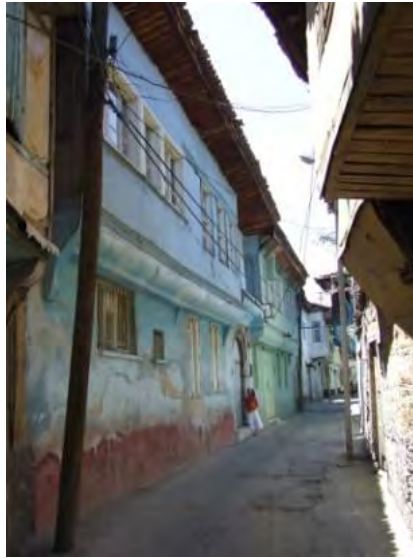
Figure 18. Case 03 The building and its surrounding (Source: Authors, 2008).

The masonry stone wall is approximately 15 meters long throughout the 26 th Street where the entrance is obtained from, and is an unsupported wall. The biggest and the main room on the timber structured first floor have dimensions like 4.35*4.70 meters. The whole building is projected to the street throughout the all facade about 0.50 meters with a simple projection, the projection is supported by three curvilinear timber elements, and covered by bağdadi system and plastered. The first floor timber post elements on the sofa façade have 0.15*0.15 meters cross-section and are placed within 2.00 meters intervals.