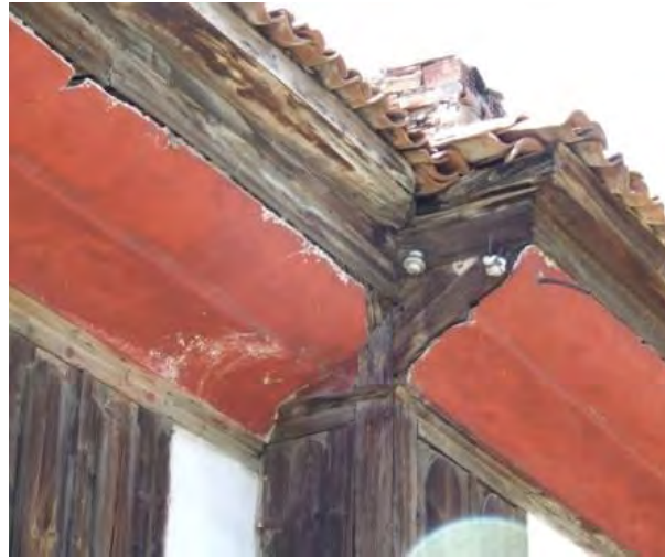
Figure 13. Color change of the wooden eaves (Source: Authors, 2008).