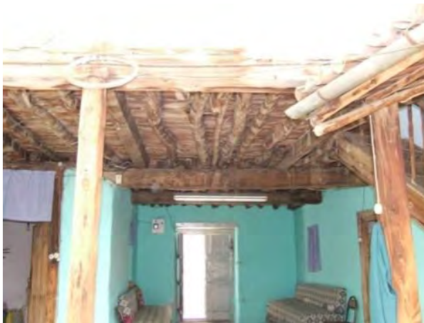
Figure 11. Floor Construction – Hayataltı Space (Source: Authors, 2008).

The building stands on the corner therefore; the courtyard of the building has two individual entrances from both of the two streets. The hayataltı space, one storied annex building and a wooden staircase that leads one to upper floors is located in the courtyard of the building (see Figure 11).