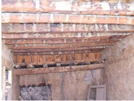
Figure 8. Floor Beams

Floor beams (joists) which have usually 8/15 cm dimensions in sections, are spaced at approximately 50 cm intervals. The spatial dimensions are usually determined according to the size of the available materials, whereas in some larger spaces such as the sofa—the main circulation hall in Ottoman houses—and taşlık where a wide span is required, long timber beams with a relatively larger cross-section (like 15*20, 20*20 cm) are used to support the secondary joists. Then the floor is covered with a timber boarding which is nailed to the joists. The floor system that consists of timber joists moving in one direction. Floor has an important role against the lateral forces especially in case of earthquakes since it connects all the masonry walls of the structure as well as the roof.