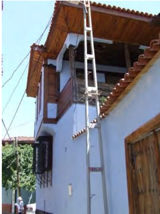
Figure 23. Case05 Exterior View of the House.

From the courtyard with a seven stepped staircase, one can reach to the semi floor and a unique wooden staircase leads one to the top floor. The ground floor of the building is made of a stone masonry wall, the upper floors are made of timber framed structure, unlike other surfaces of the building, all stories of the north facing wall is constructed with stone masonry system.