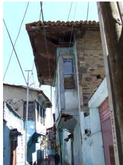
Figure 17. Case 02 the building and its surrounding.