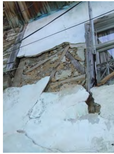
Figure 6. (Left) and Figure 7. (Right) Masonry and Wooden Frame (Hımış) Wall Examples (Source: Authors, 2008).