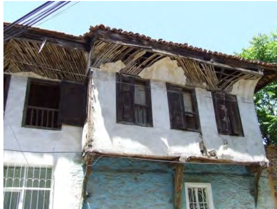
Figure 25: Case07 Exterior view and Material Loss on the Eaves of the building (Source: Authors, 2008).

The ground floor of the building ensured the continuity of the building life so some new windows are opened on the stone masonry wall surfaces while transforming the ground floor uses (space organization) to first floor uses with wrong workmanship, and with a wrong restoration manner.