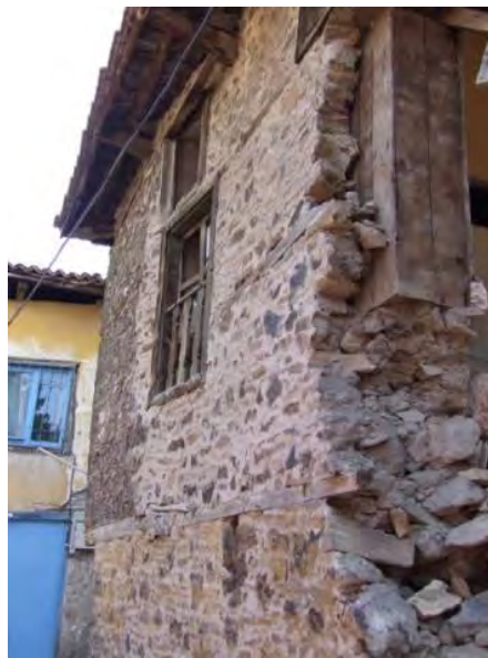
Figure 26: Case09 The collapsed part of the house (Source: Authors, 2008).

The main deterioration factor can be seen within the case is suffering from humidity. Humidity caused colour changes, fungi attacks on timber element. Different from other cases, insect invasion can be obtained in this case on the timber beam elements that support the masonry stone wall. The insect invasion fragmented and reduce the cross section dimension of timber elements.