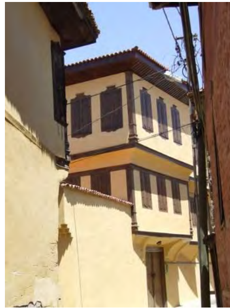
Figure 1. (Left) and Figure 2. (Right) Urban pattern of traditional settlement.