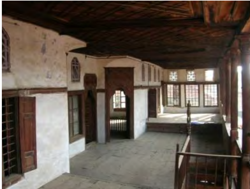
Figure 3. A typical sofa space (Source: Authors, 2008).

of this space. A semi-open projection with a lattice-window, a projection to the street and/or to the courtyard, staircases, projected and raised platforms for resting, a rectangular planned space open at one side, either in the form of an extension of the Sofa or as a single semi-open space acting as a Sofa are the other important features of the Sofa.