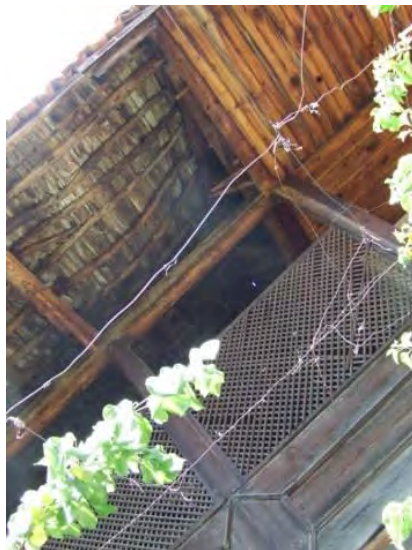
Figure 16. Case 02 Timber roof structural elements and wooden fences.