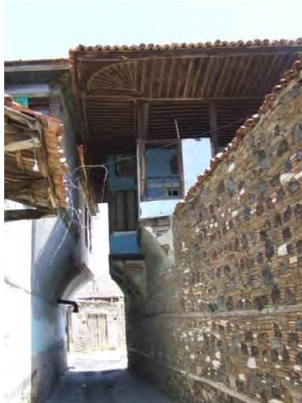
Figure 28. Exterior view- Long eaves of the house (Source: Authors, 2008).

The wooden elements used within the house have preserved their authenticity and uniqueness. The doors (kündekari doors), windows, shutters, and floor coverings (ornamented with floral patterns), furnace, closets, timber post elements, staircase and balustrades of staircase are realized very unique as the evidences of Typical Kula Houses architectural details. The eaves of the building are extended to the courtyard side as a console about 2.00 meters. The eave is covered with a wooden covering. The eaves are extended to the street similarly, and cover the street from the top.