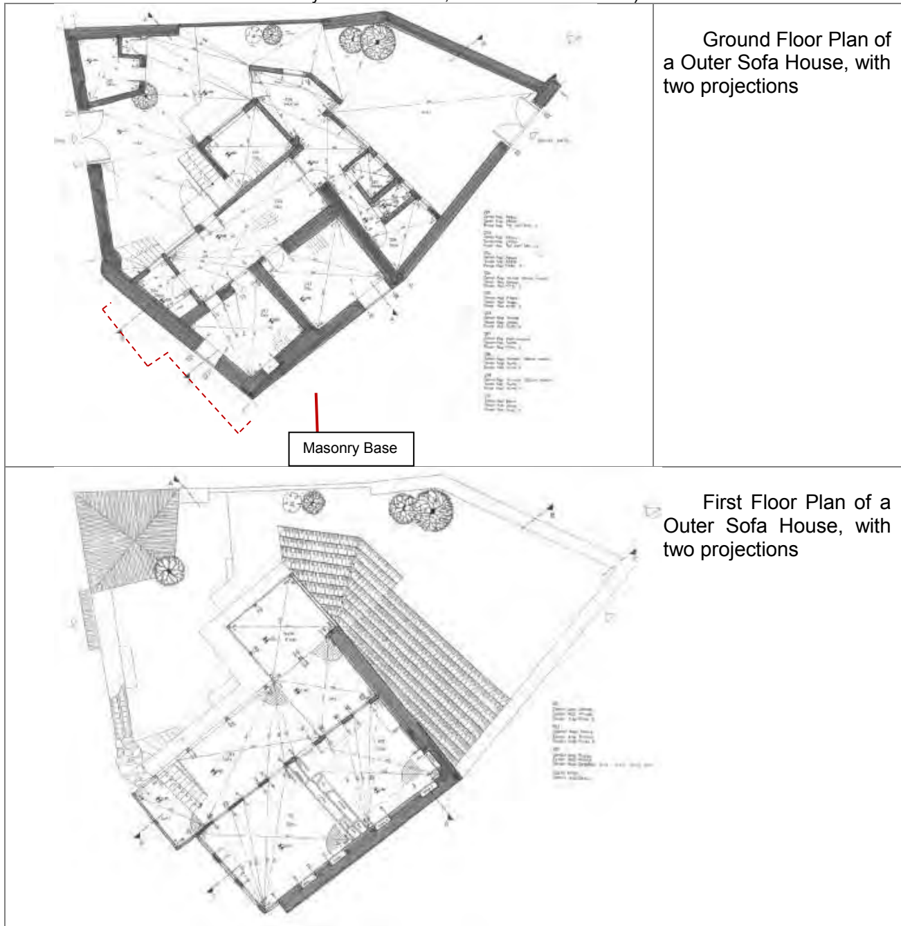
Table 2. Spatial Organization of Houses (Source: Re-arrangement of the drawings of a Kula House from Akgun District Documented in a Summer Practice in 2000 supervised by Dokuz Eylul University, Faculty of Architecture, Branch of Restoration).

The hayat-sofa (hall) is more than a circulation area between the rooms and the staircase; it is a semi-open multi-functional living space on the upper floors (see Figure 3). With its strong visual connection to the courtyard and to its natural setting as well as to the rest of the town with its projections both to the courtyard and the street, hayat-sofa (hall) is a unique part of the house. In other words it serves as connection point between the courtyard and the rooms. Many of the daily activities occur in Sofa space due to its semi-private character. A raised wooden platform for sitting on one, two or three sides oriented towards a vista/panorama is the architectural elements