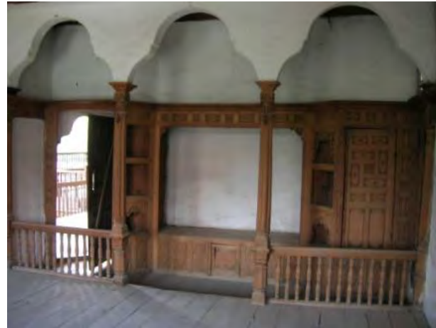
Figure 4. (Left) and Figure 5. (Right) A typical sekialtı and sekiüstü space (Source: Authors, 2008).

The middle floor, if there is one, has a low ceiling and is either a mezzanine floor or a whole floor. The top floor has, through time, become ever livelier with several projections and with multitude of windows which are of a standard size. The standard size of the window creates a sense of unity with its recurrent rhythm, not only in each house but also throughout the town. The roof always slopes on all four sides. This is one of the main discriminating characteristics of Traditional Kula House (Günay, 2007).