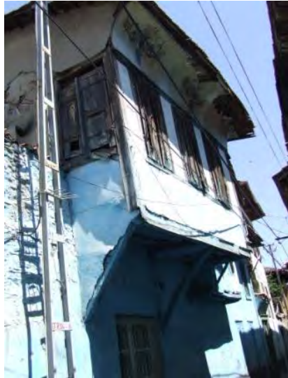
Figure 14. Case 02 The entrance façade of the building (Source: Authors, 2008).

material loss. The wooden materials of roof coverings, eave coverings are partly lost, there are colour changes obtained on the architectural façade elements.