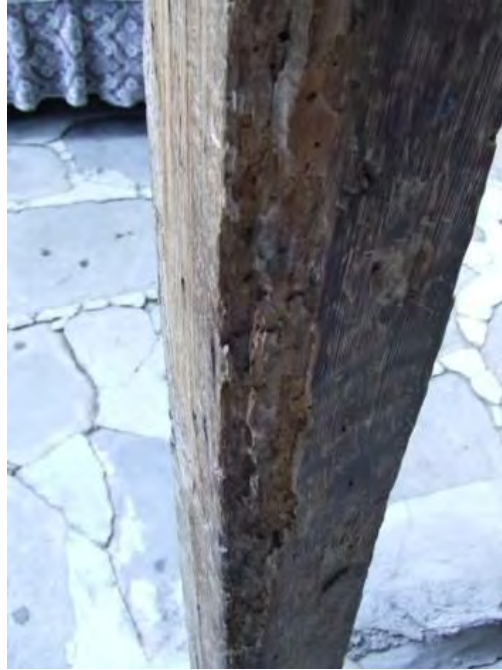
Figure 21. Deterioration Problems of the Posts (Color change, holes caused by insects and sectional material loss)