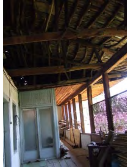
Figure 15. Case 02 the external sofa and the roof structure (Source: Authors, 2008).