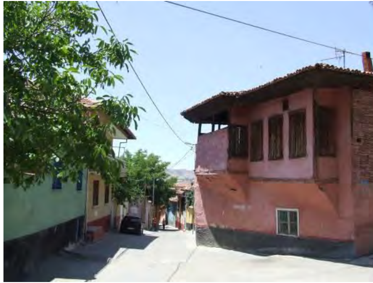
Figure 24. Case06 Exterior View of the House (Source: Authors, 2008).

Timber post elements carrying the Sofa space have 0.15*0.15 meters cross-section dimensions and are placed within 2.00 meters intervals on the courtyard direction. The two rooms opening to Sofa Space are organized in 420*485cm and 420*455cm dimensions. The stone masonry walls of ground floor are supported by masonry walls on the opposite direction, but contrary to this situation, the masonry walls on the first floor are unsupported walls with dimensions of approximately 12 meters on one direction and 11.5 meters on the other direction.