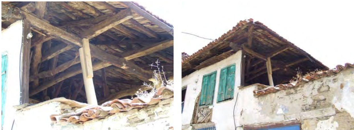
Figure 10. Roof System Details.

The outer shell of the house is finished with a wooden roof covered with tiles. The use of timber beams and joists are very similar in both floor and roof structure. The main difference is the slope of the roof. To construct the roof, rafters are placed on the top plate of the frame but in some cases a secondary beam-a purlin can be used as well on the top plate. Rafters are connected to the beam on top of the roof. This beam is supported by posts in approximately 200 cm intervals. Like the floor rafters are covered with firstly a timber boarding, then tiles are placed on this timber layer. In some cases especially in lower income houses rafters cannot be covered with timber boarding, in this case tiles are placed on the rafters which are placed parallel to the long side of the roof directly. The roof construction usually cannot be seen inside the rooms since the ceiling of the room is covered with timber boarding, this coating layer is supported by ceiling joists similar with the floor joists. The ceilings of the important rooms are usually ornamented. The mouldings are used in the connections of wall and ceiling surfaces (see Figure 10).