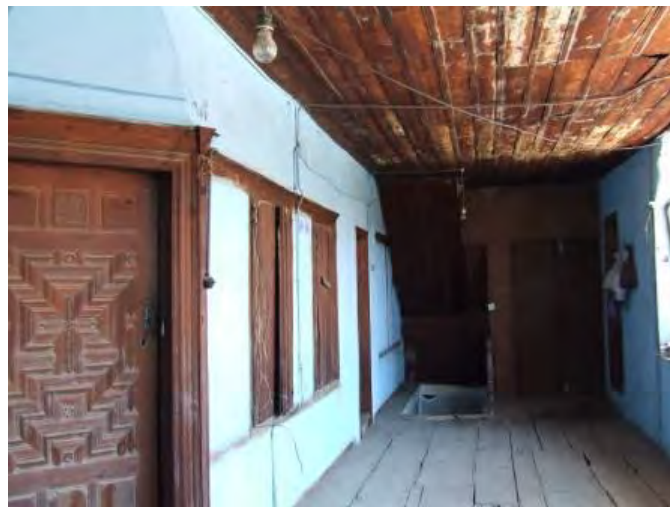
Figure 19. Case 03 Situation of external sofa space, deterioration of the wooden material of sofa ceiling (Source: Authors, 2008).

The owners of the house live in a one storied new house which they have built in the courtyard of the building during the recent years. During this process, the building has also suffered from wrong repair attempts as well. The external sofa space is partly closed, the hayataltı space is closed with a concrete extension, and some new openings are added to the façade of the building. The atmospheric conditions caused to degradations as well such as the material loss and colour changes on the wooden eaves, ceiling coverings and floor coverings.