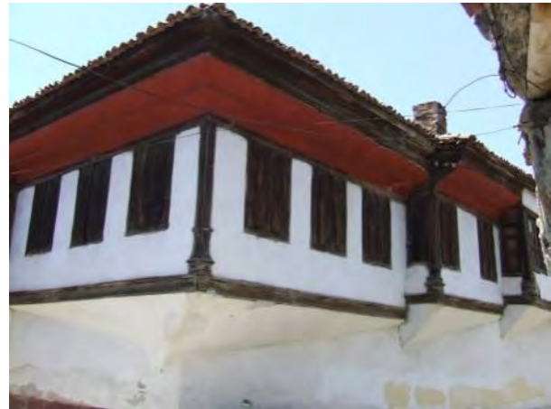
Figure 12. Projections of the house (Source: Authors, 2008).

The first floor of the building has additions throughout time as a result of today's requirements such as the transformation of the external sofa space into a closed space. This approach turned all of the wooden openings of the rooms (doors and windows) into an interior space element, and by this way all of these architectural timber elements are protected from the atmospheric conditions. Now that the building carries on its original usage as a residence today, the periodic maintenance of the structure can be achieved during the historical period.