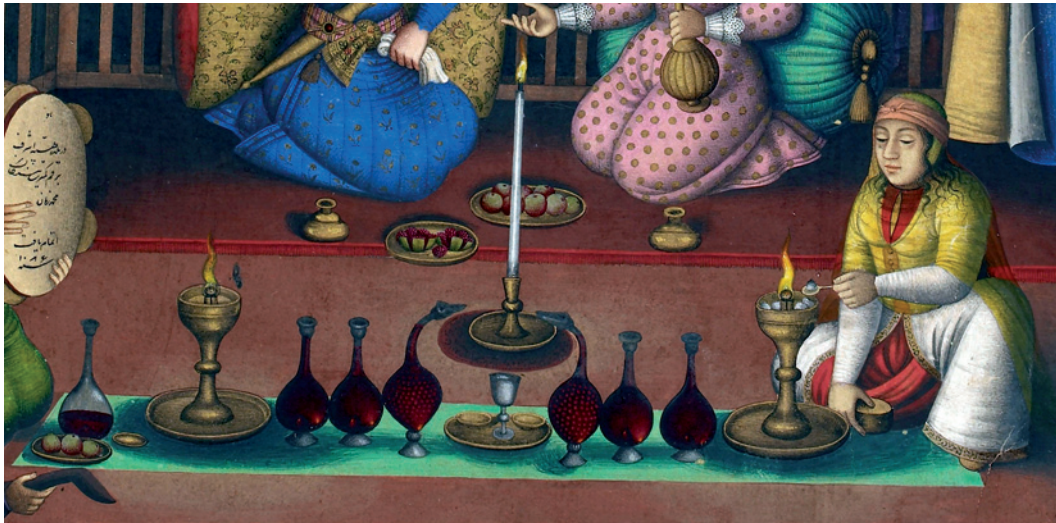
Fig. 14. Detail of the so-called Bahram Gur and the Indian Princess , identified here as Turktazi and the Queen of the Faeries , Turktaz (see fig. 1).

Khamsa dated 1494. 113 Such borrowings can be understood as a nod to the rich tradition of Persian manuscript painting.