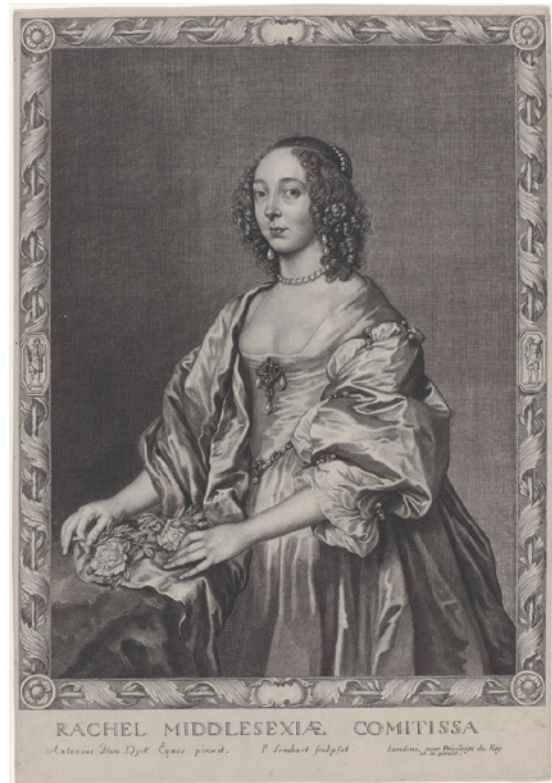
Fig. 11. Rachel, Countess of Middlesex . Pierre Lombart (d. 1682), after Anthony van Dyck (d. 1641). Engraving, 35.7 x 24.3 cm. Amsterdam, Rijksmuseum, inv. no. RP-P-OB-69.499.

Why would Muhammad Zaman depict the Queen of the Faeries as a European woman? After all, according to Nizami, Turktaz is a Turk: "She said, 'A lissome Turk I am, Turktaz the Beautiful my name.'" 81 The "Turk" is