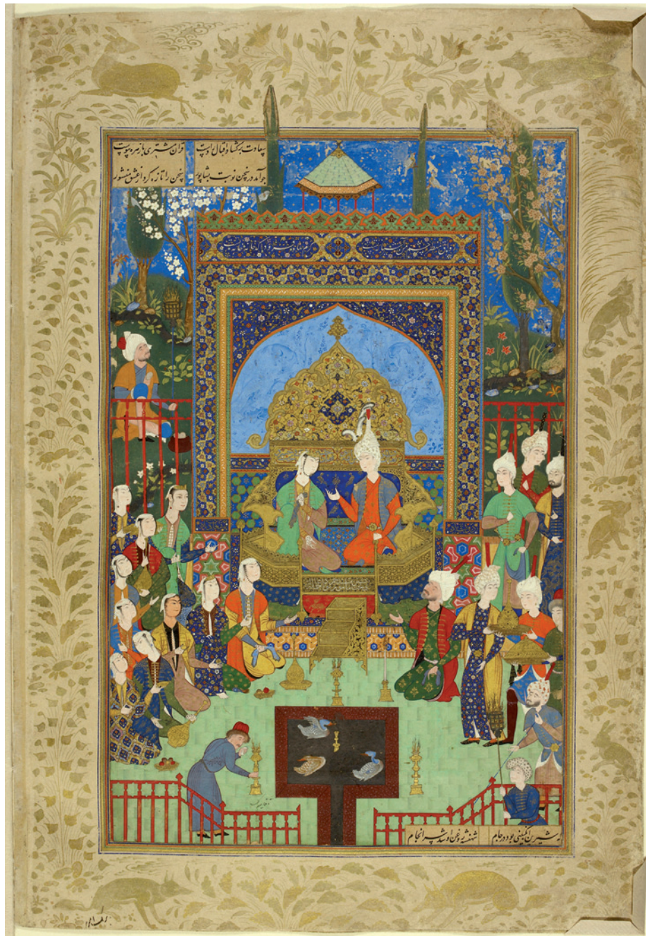
Fig. 3. Khusraw and Shirin Listening to Stories Told by Shirin's Maidens. Attributed to Agha Mirak. Opaque watercolor on paper, 30 x 18 cm (painting). Khamse for Shah Tahmasp, copied between 946 and 949 (1539–43). London, British Library, Ms. Or. 2265, fol. 66b.