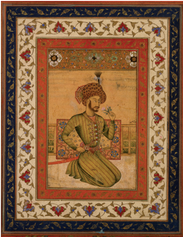
Fig. 13. Portrait of Shah Sulayman . Inscribed “ Shāh Sulaymān ,” ca. 1670 (with later borders). Watercolor and ink on paper pasted on cardboard. Dublin, Chester Beatty Library, Album 298.

If Shah Sulayman is depicted as Turktazi, it is perhaps not inconsequential that the text facing Muhammad Zaman’s illustration contains the verse “No place for demons, Sheba’s throne; ’tis fit for Solomon alone” (32:242), spoken by Turktazi himself, who believes that only the legendary Sulayman is fit to sit beside Turktaz. The shah took the name Sulayman upon his second accession, in 1668, on the recommendation of his court astrologers. 97 According to Chardin, at the end of the investiture ceremony and the reading of the khutba, the new name of the shah was announced in a loud voice, and it was wished that “ce prince surpasse la gloire et le bonheur du sage monarque qui porta le premier ce nom” (that is, the Koranic Sulayman [Solomon]). 98