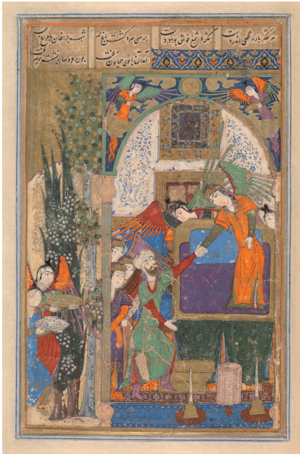
Fig 6. Turktazi and the Queen of the Faeries, Turktaz . Opaque watercolor on paper. Khamsa , fifteenth century. Dublin, Chester Beatty Library, Ms. 141, fol. 205a.