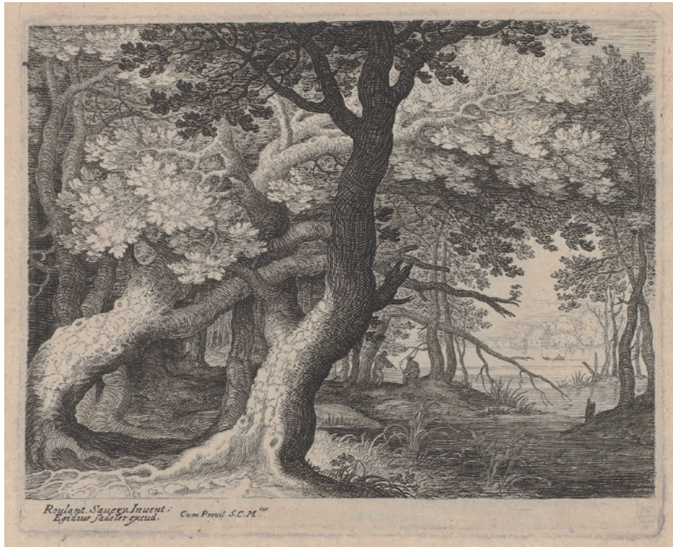
Fig 7. Forest Landscape with Pool . From the series “Six Landscapes in Tyrol,” Aegidius Sadeler II (d. 1629), after Roelandt Savery (d. 1639). Engraving, 12.2 x 15.4 cm. Amsterdam, Rijksmuseum, inv. no. RP-P-1969-172.

Turktaz. However, as will be demonstrated, through its sophisticated iconography, the late Safavid painting embodies not only the text facing the illustration but all the themes central to the Indian Princess’s story. 41