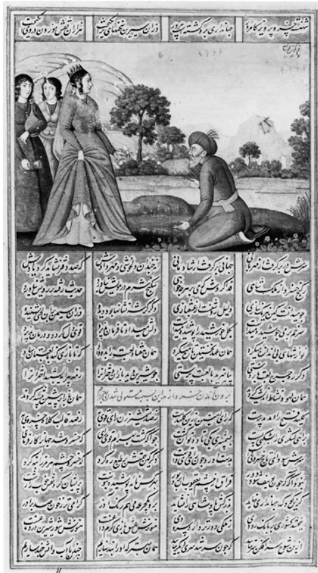
Fig. 12. Shapur Kneeling Before Shirin . Inscribed “ raqam-i kamtarin-i bandagan Muhammad Zamān 1086 ” (signed by the humblest of servants, Muhammad Zaman, 1086). Opaque watercolor on paper, 8.7 x 12.0 cm (painting). Khamasa , copied 1085–86 (1675–76). New York, Pierpont Morgan Library, Ms. M.469, fol. 87b.

the well-bred European lady: both are defined by Neo-Platonic notions of beauty as reflected in the purity and chastity of the soul. The possibility that Safavid artists and viewers were drawing parallels between Islamic and European themes of femininity is suggested by the depiction of another of Nizami’s great heroines: the Armenian princess Shirin, of Khusraw and Shirin , one of the five poems that comprise the Khamasa . The poet emphasizes Shirin’s integrity, loyalty, kindness, and intelligence. On folio 87b of the Pierpont Morgan Library Khamasa , mentioned above, Shirin is depicted as a European queenly type (fig. 12). It is, of course, pos-