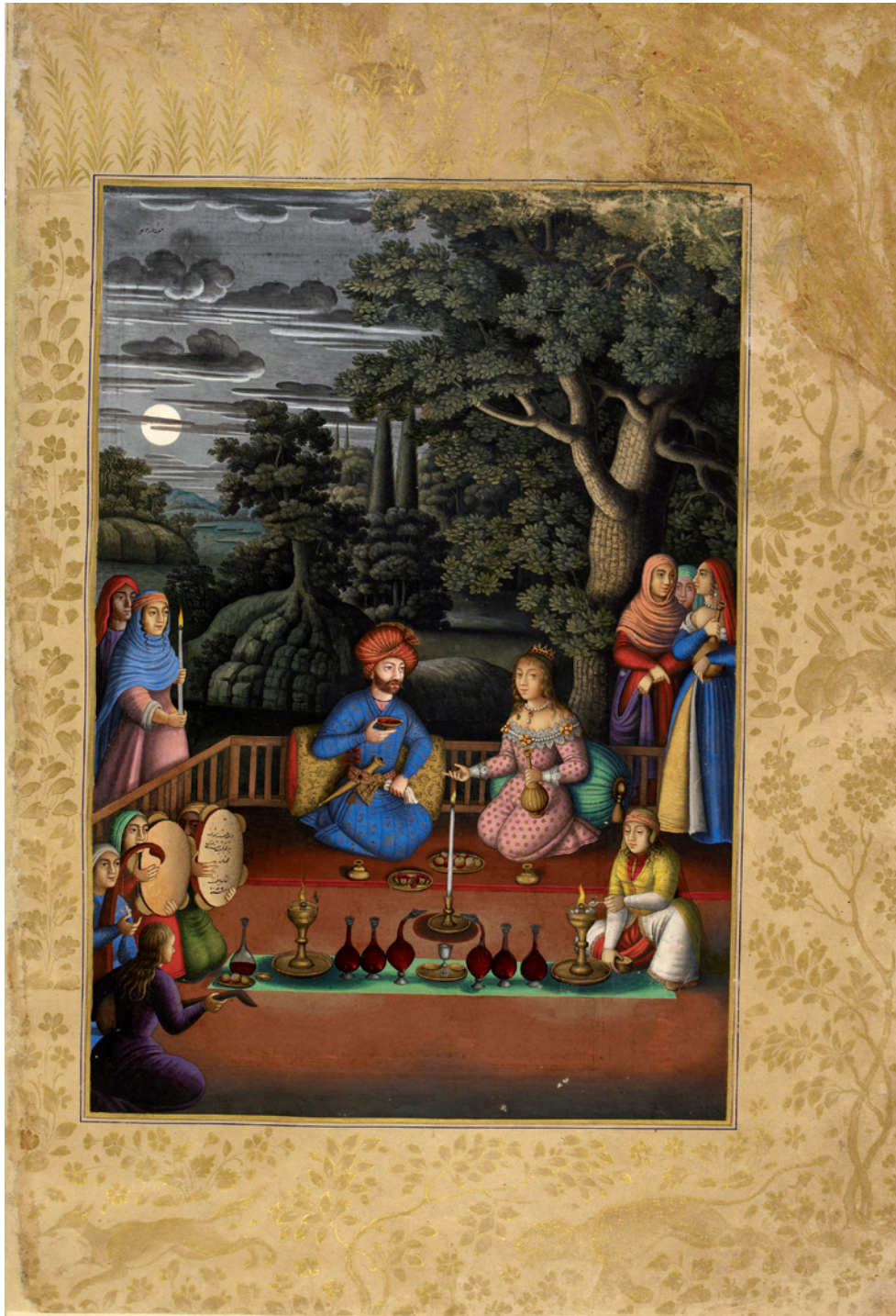
Fig. 1. The so-called Bahram Gur and the Indian Princess, identified here as Turktazi and the Queen of the Faeries, Turktaz. Signed by Muhammad Zaman and dated 1086 (1675–76). Opaque watercolor on paper, 25.2 x 18 cm (painting). Added to the Khamsa for Shah Tahmasp, copied between 946 and 949 (1539–43). London, British Library, Ms. Or. 2265, fol. 221b.