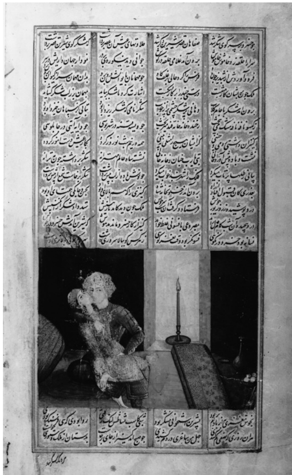
Fig. 9. Khusraw Makes Love to an Attendant . Inscribed “ raqam-i kamtarin-i bandagān Muḥammad Zamān 1087 ” (signed by the humblest of servants, Muhammad Zaman, 1087). Opaque watercolor on paper, 8.7 x 12.0 cm (painting). Khamasa , copied 1085–86 (1675–76). New York, Pierpont Morgan Library, Ms. M.469, fol. 111b.

beautifully evokes a favorite image in Persian poetry of the proverbial moth being drawn to the candle’s flame, a theme that is highlighted in the story of the Indian Princess. 63