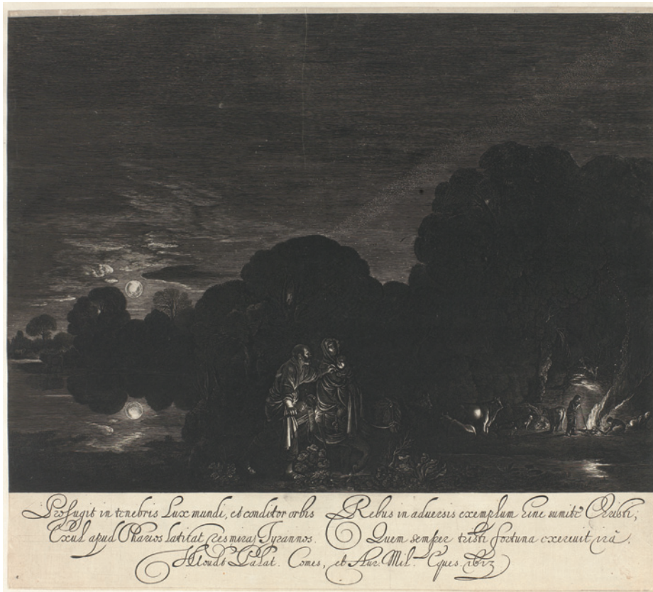
Fig. 8. The Flight into Egypt . Hendrick Goudt (d. 1648), after Adam Elsheimer (d. 1610). Engraving, 35.2 x 39.5 cm. Amsterdam, Rijksmuseum, inv. no. RP-P-OB-52.972.

out any real effects of illumination, emblematically indicate nocturnal events. Muhammad Zaman, however, utilized a technique popular in contemporary European painting known as pittura tenebrosa , characterized by a preponderance of dark shadow and few light areas, and offers a night scene dimly lit by candles and the moon. 61 In agreement with tenebrist principles, Muhammad Zaman emphasizes the effects of light emanating from specific sources: the moon, the candles, and the torches. He illuminates the figures from below with artificial light and positions the central candle behind foreground objects to create repoussoir effects.