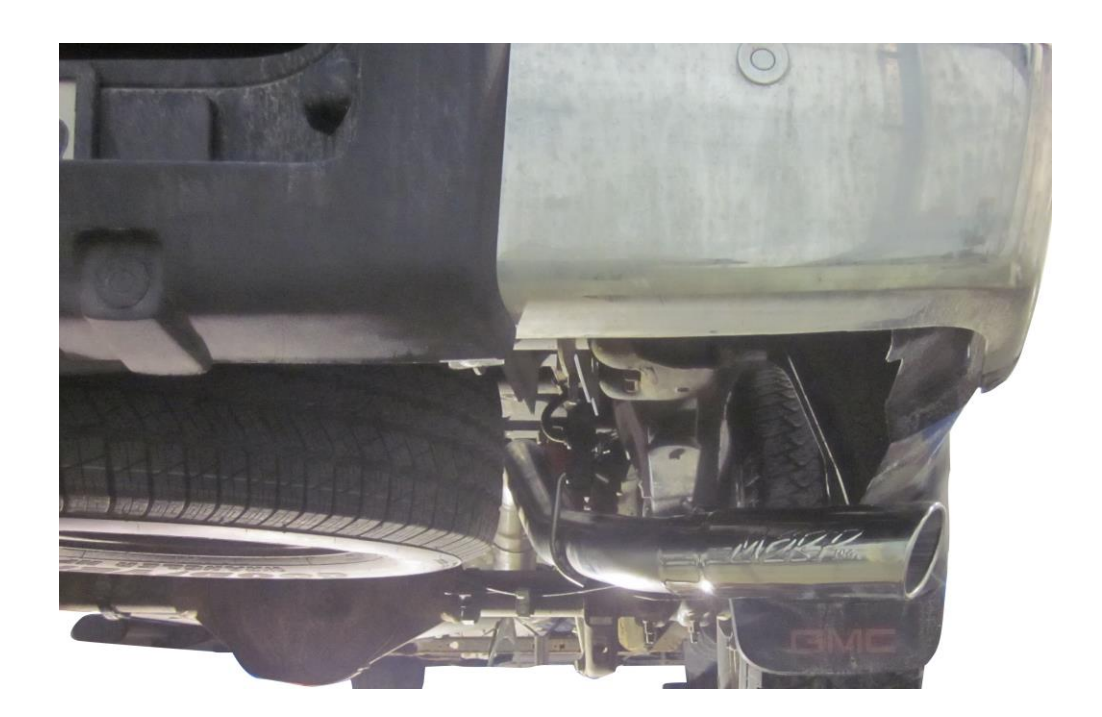
Congratulations! You are ready to begin experiencing the improved power, sound, and driving excitement of your MBRP performance exhaust system. We know you will enjoy your purchase.