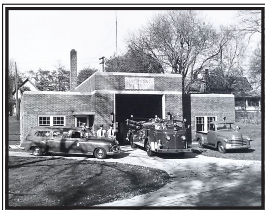
1949 North Side Fire Station

In late 1988, the City of Goshen offered its north side fire station. Volunteers renovated the fire station, and in February 1989, residents of north and east Goshen began visiting the center for affordable healthcare.