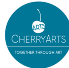
Cherry Creek Arts Festival