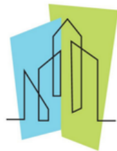
Bayou City Art Festivals