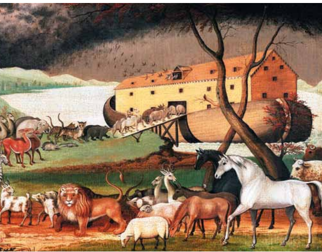
Noah's Ark, Edward Hicks, 1846

A rainbow is a marvelous sight! It can come at the end of a summer thunderstorm, when the blackness of the day, the fearsome lightning, and the quaking thunder pass. Against the clouds, the sun brightens the sky with an arc of color. The people in biblical times were as affected by the sight of the rainbow as we are. They saw it in the context of the story of Noah and the Great Flood. Through Noah and his family, God had saved the human family. At the end God promised that he would never send another such flood. The rainbow was the sign of his promise, called a covenant. God promises to treat the human family with mercy and love, a promise he will never break.