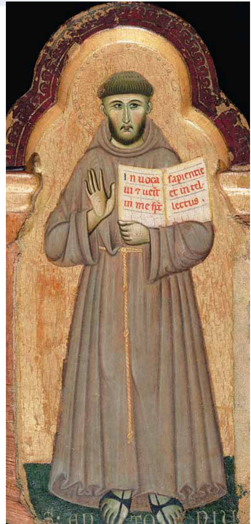
Saint Francis, Master of Saint Francis

people back to Jesus through Mary and had worked to spread the gospel in Japan. He was put in the camp for speaking out against the Nazis.