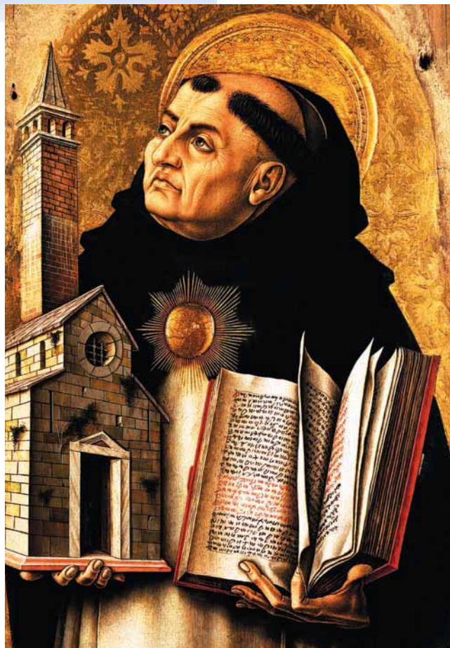
St. Thomas Aquinas, Carlo Crivelli

A sk your child what he or she hopes to be and do as an adult. Discuss how a person's dreams can help shape his or her life.