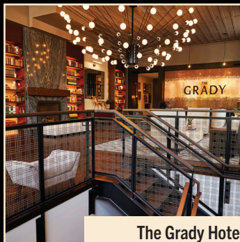
The Grady Hotel 51 rooms