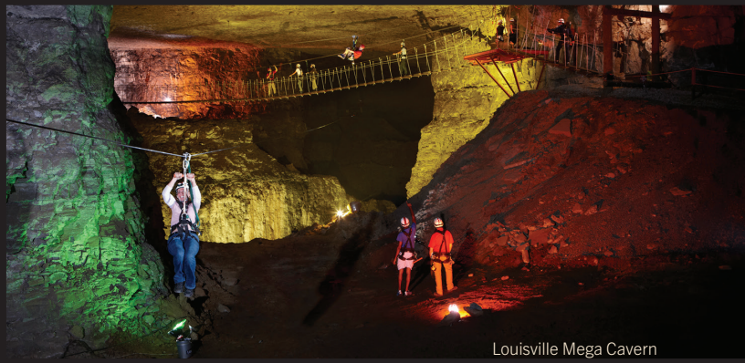
Louisville Mega Cavern