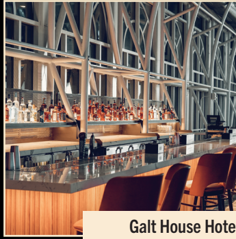
Galt House Hotel 1310 rooms