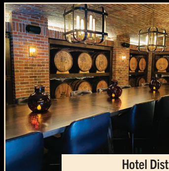
Hotel Distil 205 rooms