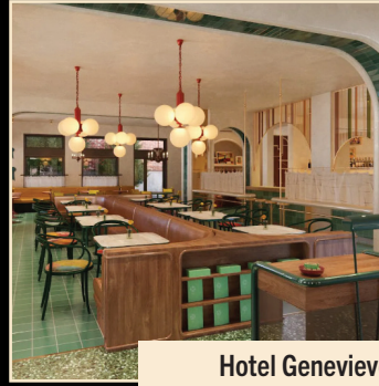
Hotel Genevieve 122 rooms