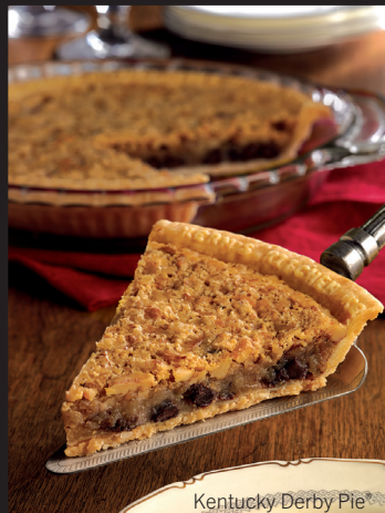
Kentucky Derby Pie