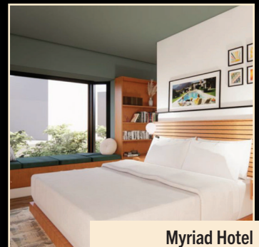
Myriad Hotel 65 rooms