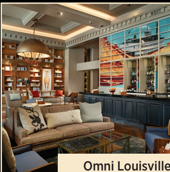
Omni Louisville 621 rooms