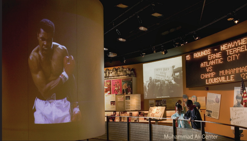
Muhammad Ali Center

Situated on the banks of the Ohio River, Louisville is a vibrant and dynamic city with a rich history, diverse culture, and world-famous attractions. With so much to see and do, Louisville is the perfect destination for a weekend getaway or a longer stay. Discover all that this spirited city has to offer!