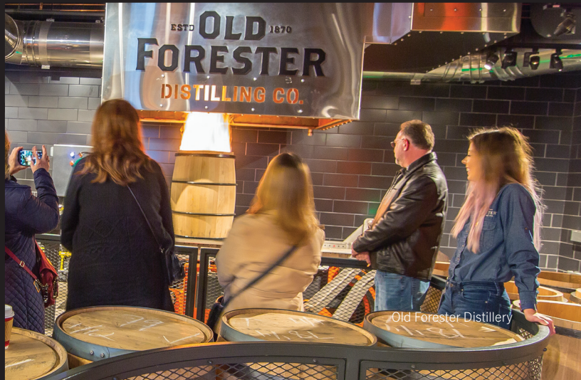
Old Forester Distillery