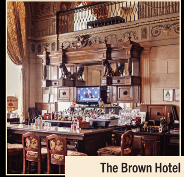
The Brown Hotel 292 rooms