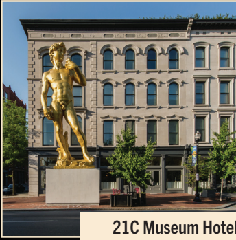
21C Museum Hotel 91 rooms