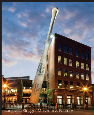
Louisville Slugger Museum & Factory