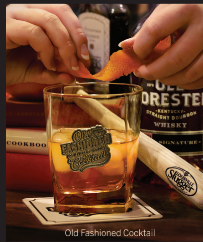
Old Fashioned Cocktail