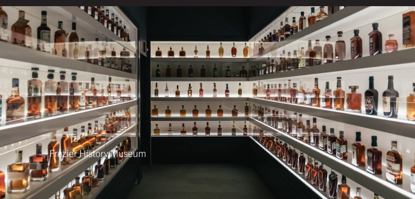
Frazier History Museum