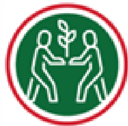
Loving Our Communities