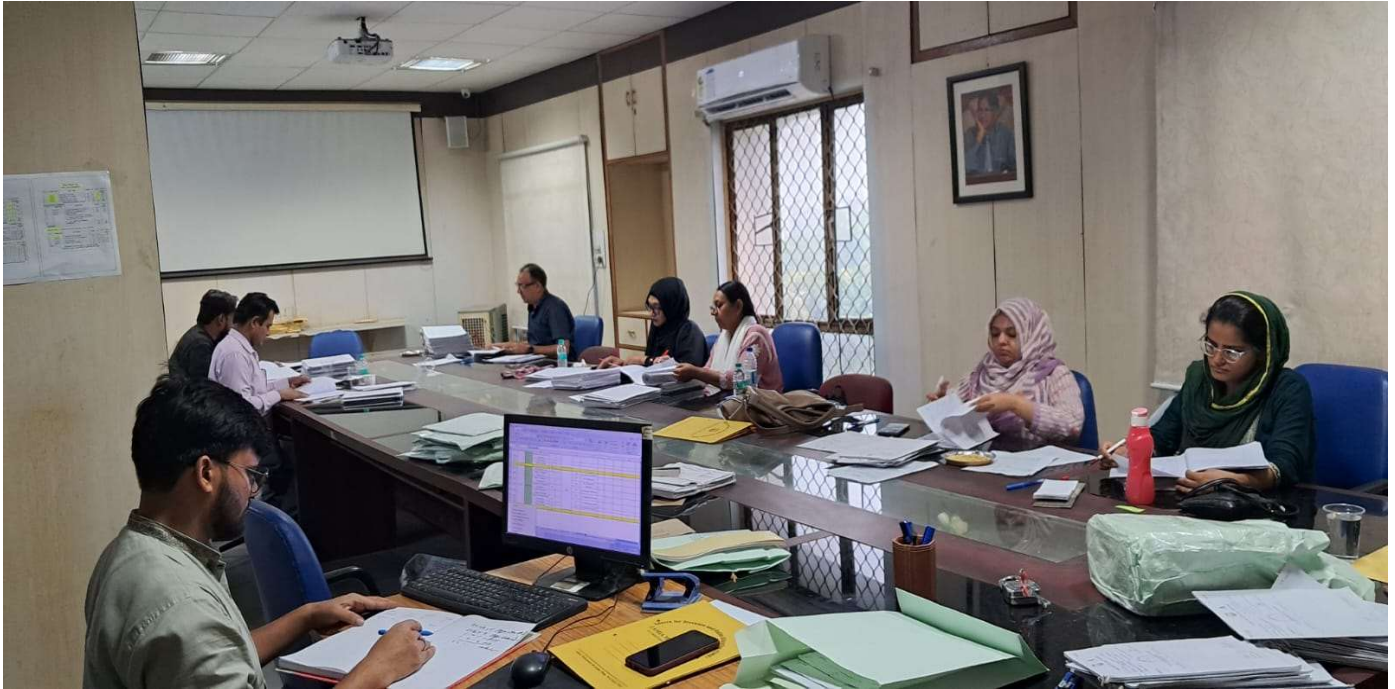
New Initiative of Spot Evaluation of Answer Scripts that helped timely declaration of results