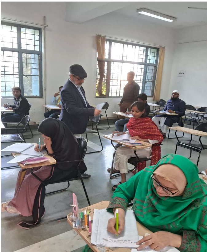
Dean's visit of Examination Centre