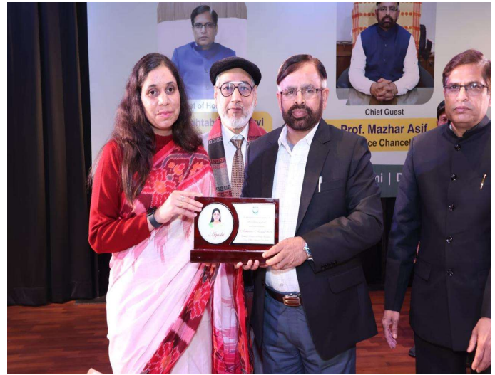
Students' Induction and Felicitation Programme was organized for the CDOE's students.