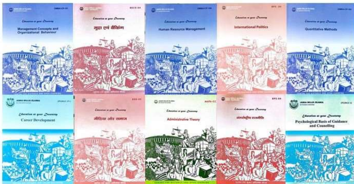
Glimpses of Self-Learning Materials Prepared for Various Programmes