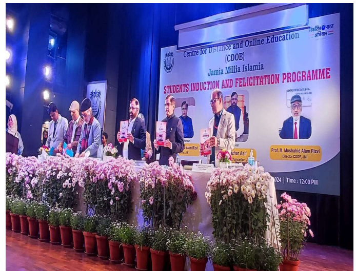
CDOE's magazine was released during Induction Programme