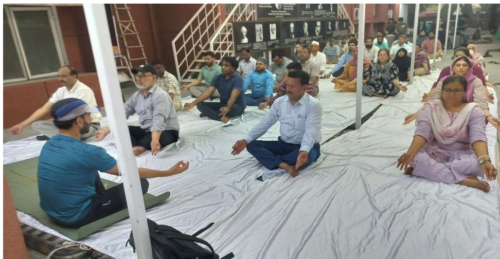
Yoga Day was celebrated at CDOE, JMI