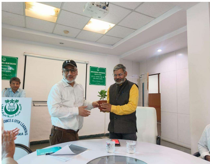
CDOE's staff meeting with the COE.