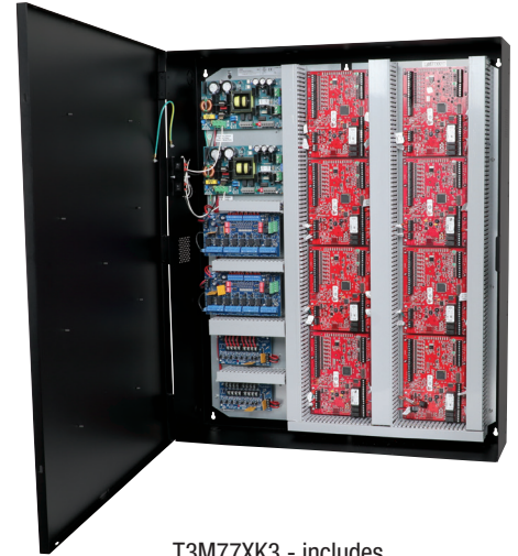
T3M77XK3 - includes (2) eFlow104NB, (2) ACMS8, (2) VR6, (2) PDS8, wire harnesses and finger duct