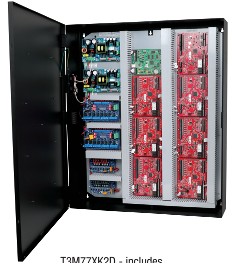
T3M77XK2D - includes (2) eFlow104NB, (2) ACMS8CB, (2) VR6, (2) PDS8CB, wire harnesses and finger duct