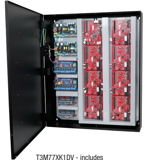
T3M77XK1DV - includes (2) eFlow104NBV, (2) ACMS8CB, (2) VR6, (2) PDS8CB, wire harnesses and finger duct