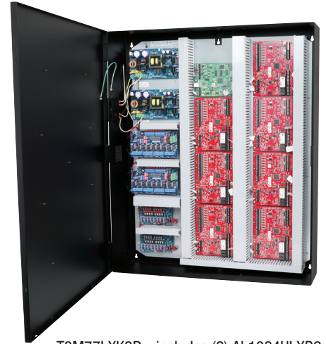
T3M77LXK2D - includes (2) AL1024ULXB2, (2) ACMS8CB, (2) VR6, (2) PDS8CB, wire harnesses and finger duct