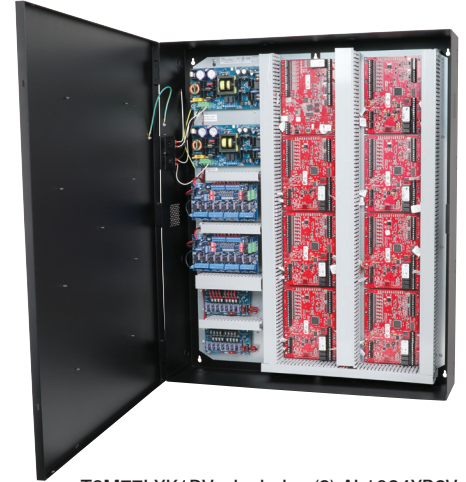
T3M77LXK1DV - includes (2) AL1024XB2V, (2) ACMS8CB, (2) VR6, (2) PDS8CB, wire harnesses and finger duct