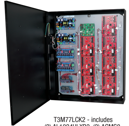
T3M77LCK2 - includes (2) AL1024ULXB2, (2) ACMS8, (2) VR6, (2) PDS8, wire harnesses and management