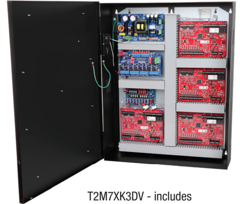
T2M7XK3DV - includes eFlow104NBV, ACMS8CB, VR6, PDS8CB, wire harnesses and finger duct

Altronix T2M7XK3DV is a 8-door access and power integration kit which includes Altronix power and sub-assemblies along with factory installed wire management and wire assemblies that are pre-configured with terminal blocks for Mercury* hardware. This unit provides ample power and dual voltage outputs to support Mercury platform controllers and locking devices. The T2M7XK3DV accommodates four (4) Dual Reader Interface Modules. Trove Plus simplifies field installations and provides reliable, robust critical power and control for the most demanding applications.