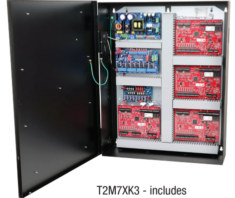
T2M7XK3 - includes eFlow104NB, ACMS8, VR6, PDS8, wire harnesses and finger duct

AccessNsite, Avigilon, BadgePass, BluBox, Feenics, Genetec, Identicon, IMRON, Johnson Controls, Kastle, Keri Systems, Lenel/S2, LockState, Maxxess, Midpoint Security, NLSS, Open Options, Panasonic i-PRO MonitorCast, Quintron, RS2, S2 Security, Schneider Electric, Vanderbilt