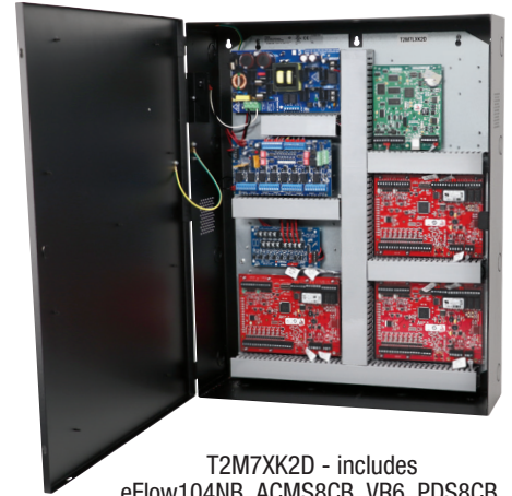
T2M7XK2D - includes eFlow104NB, ACMS8CB, VR6, PDS8CB, wire harnesses and finger duct