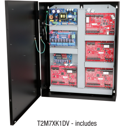
T2M7XK1DV - includes eFlow104NBV, ACMS8CB, VR6, PDS8CB, wire harnesses and finger duct