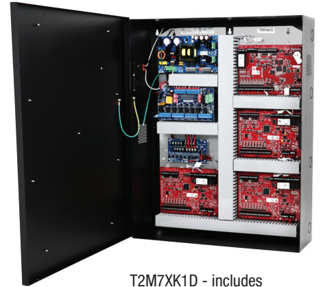
T2M7XK1D - includes eFlow104NB, ACMS8CB, VR6, PDS8CB, wire harnesses and finger duct

AccessNsite, Avigilon, BadgePass, BluBox, Feenics, Genetec, Identicon, IMRON, Johnson Controls, Kastle, Keri Systems, Lenel/S2, LockState, Maxxess, Midpoint Security, NLSS, Open Options, Panasonic i-PRO MonitorCast, Quintron, RS2, S2 Security, Schneider Electric, Vanderbilt