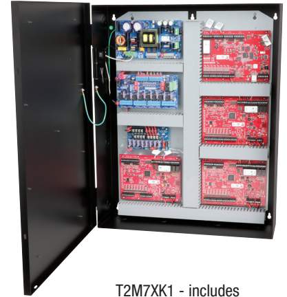
T2M7XK1 - includes eFlow104NB, ACMS8, VR6, PDS8, wire harnesses and finger duct