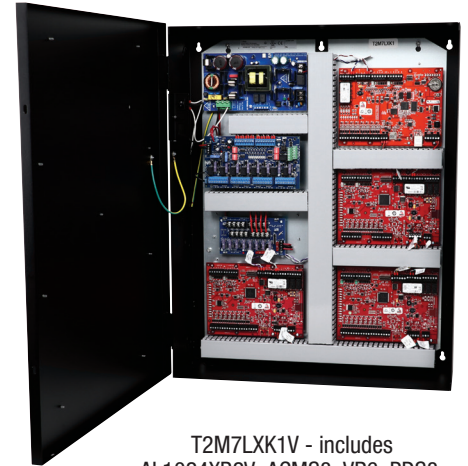
T2M7LXK1V - includes AL1024XB2V, ACMS8, VR6, PDS8, wire harnesses and finger duct