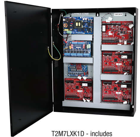
T2M7LXK1D - includes AL1024ULXB2, ACMS8CB, VR6, PDS8CB, wire harnesses and finger duct