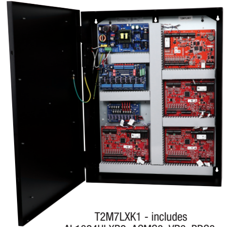
T2M7LXK1 - includes AL1024ULXB2, ACMS8, VR6, PDS8, wire harnesses and finger duct