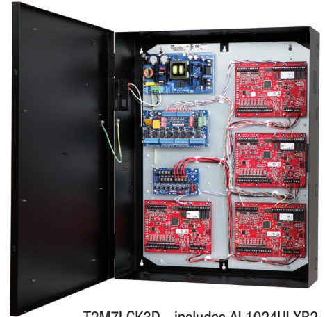
T2M7LCK3D - includes AL1024ULXB2, ACMS8CB, VR6, PDS8CB, wire harnesses and wire magnets