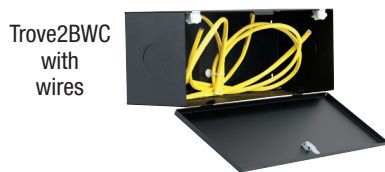
Trove2BWC with wires

Altronix Trove2BWC is a dual-purpose enclosure that can be used as wiring trough or battery cabinet when mounted above or below of the Trove2 integrated power and access solution. The knockouts on the Trove2BWC have been strategically placed to line up with the Trove2 allowing for easy conduit connections between cabinets. Trove2BWC includes cam locks and 2 tamper switches to ensure access to wiring and batteries is secure.