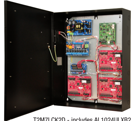
T2M7LCK2D - includes AL1024ULXB2, ACMS8CB, VR6, PDS8CB, wire harnesses and wire magnets