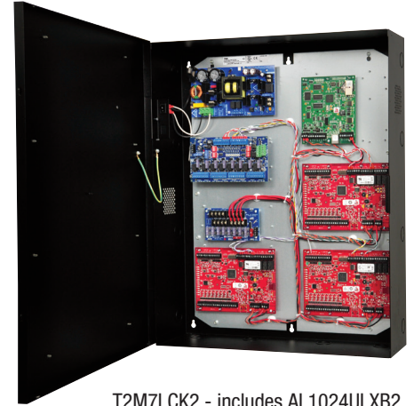
T2M7LCK2 - includes AL1024ULXB2, ACMS8, VR6, PDS8, wire harnesses and wire magnets