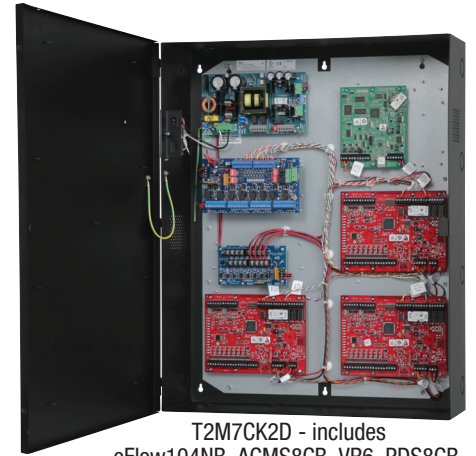
T2M7CK2D - includes eFlow104NB, ACMS8CB, VR6, PDS8CB, wire harnesses and management

AccessNsite, Avigilon, BadgePass, BluBox, Feenics, Genetec, Identicon, IMRON, Johnson Controls, Kastle, Keri Systems, Lenel/S2, LockState, Maxxess, Midpoint Security, NLSS, Open Options, Panasonic i-PRO MonitorCast, Quintron, RS2, S2 Security, Schneider Electric, Vanderbilt