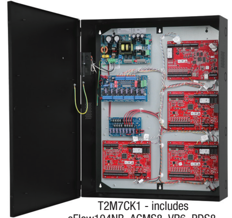
T2M7CK1 - includes eFlow104NB, ACMS8, VR6, PDS8, wire harnesses and management

AccessNsite, Avigilon, BadgePass, BluBox, Feenics, Genetec, Identicon, IMRON, Johnson Controls, Kastle, Keri Systems, Lenel/S2, LockState, Maxxess, Midpoint Security, NLSS, Open Options, Panasonic i-PRO MonitorCast, Quintron, RS2, S2 Security, Schneider Electric, Vanderbilt