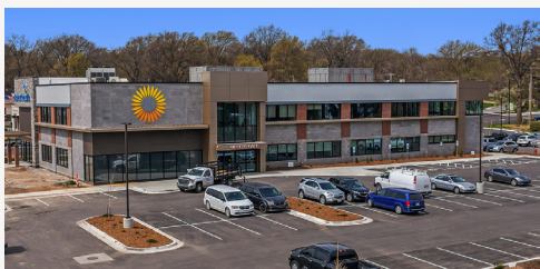
Kansas City Medical Office $22.2M