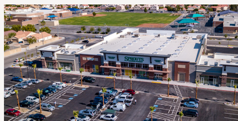
Silverado Square $24.4M