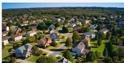
Single Family Rental Portfolio $700M