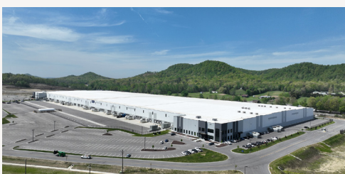
Louisville Logistics Center $81.5M