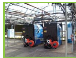
GAS / OIL / BIOFUELS