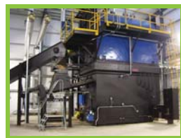
SOLID BIOMASS FUELS