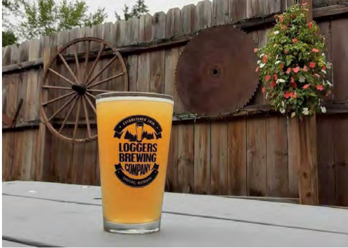
Loggers Brewing Company – Saginaw, MI