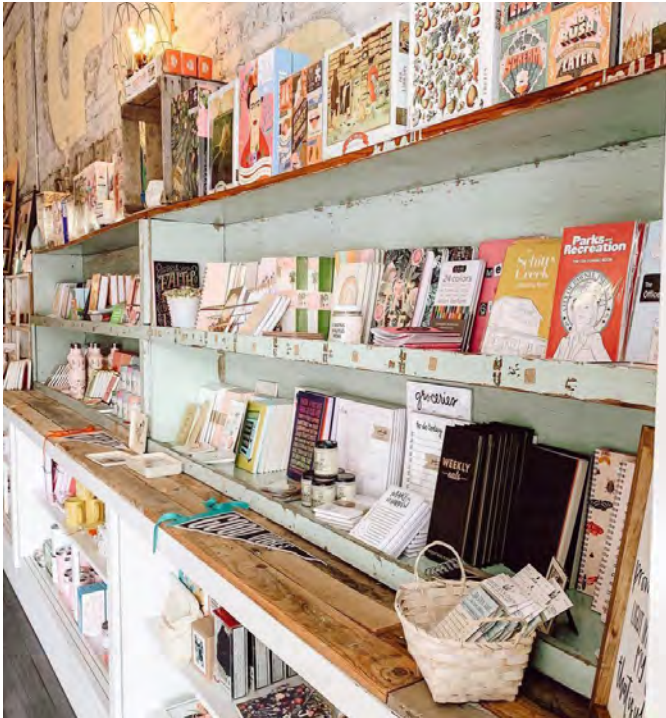
Serendipity Road Midland, MI