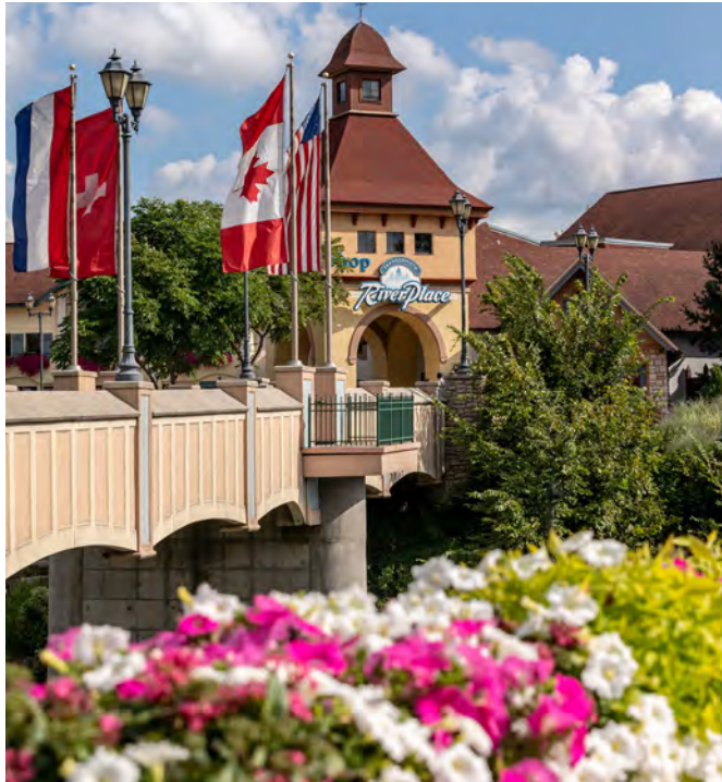
Frankenmuth River Place Shops Frankenmuth, MI