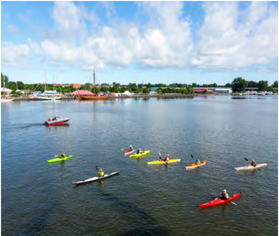
Kayaking on the Saginaw River – Bay City, MI

Tee off at two of Michigan's must-play public golf courses, Apple Mountain and The Fortress, or your choice from over a dozen others!