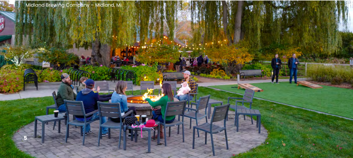
Midland Brewing Company – Midland, MI