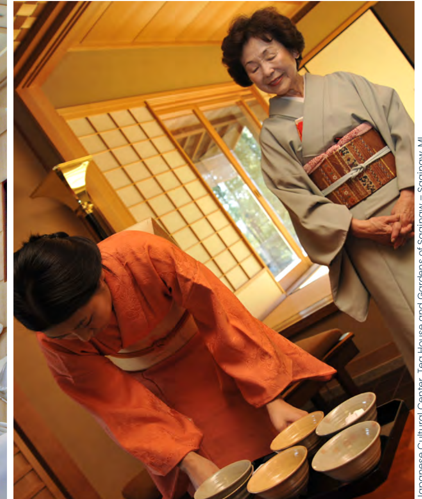
Japanese Cultural Center, Tea House and Gardens of Saginaw – Saginaw, MI