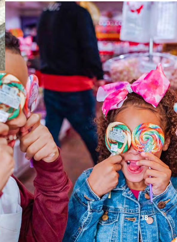
Bavarian Inn Castle Shops — Frankenmuth, MI

Enjoy a heaping helping of family fun at Funtown Chowdown Food Truck Festival or see thousands of brilliantly colored butterflies during Butterflies in Bloom at Dow Gardens!