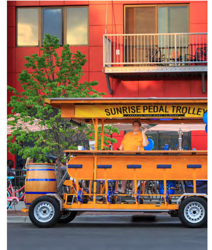
Sunrise Pedal Trolley Bay City, MI