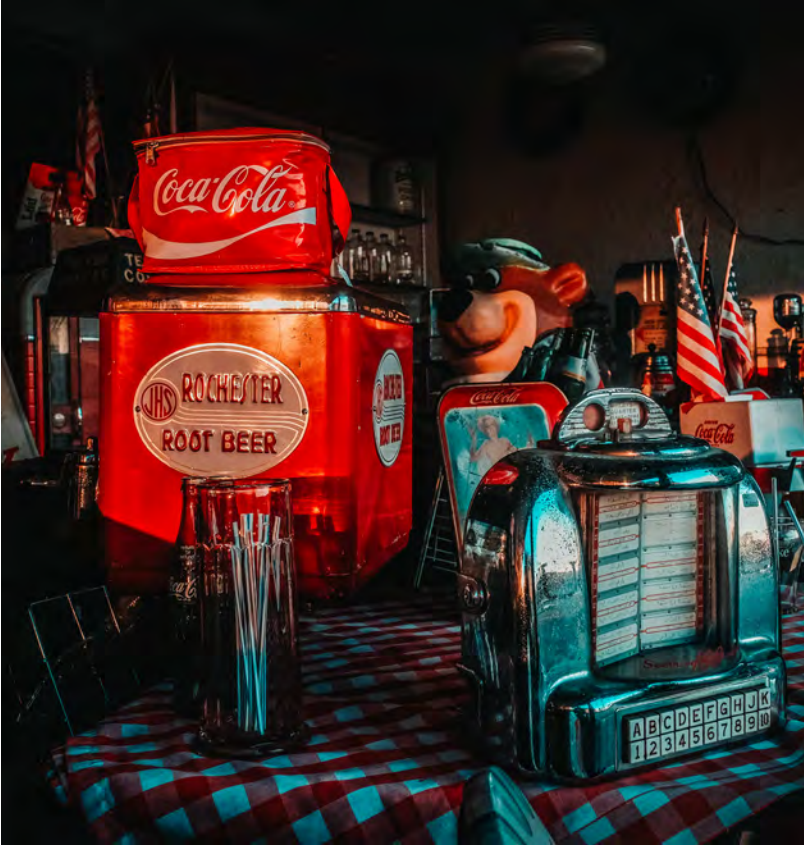
Americana Company Antiques – Bay City, MI