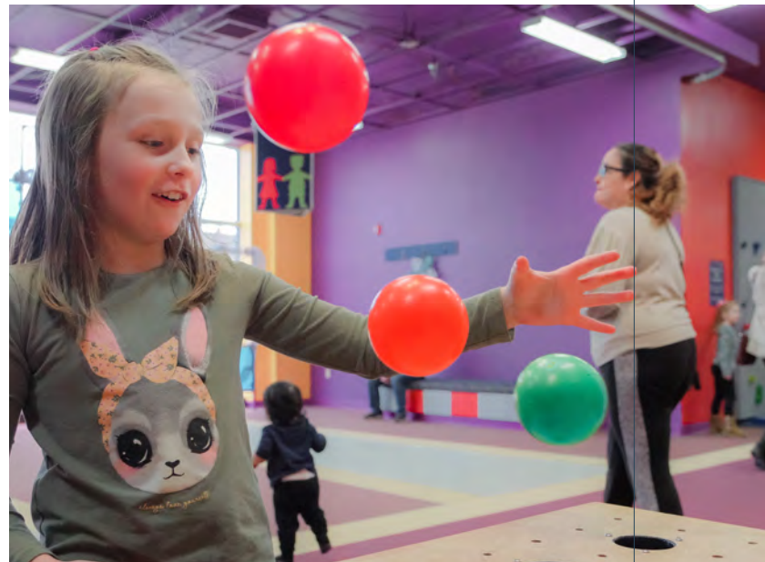
Mid-Michigan Children's Museum — Saginaw, MI

Open in May, see big smiles at the Antique Toy and Firehouse Museum — and the world's largest collection of motorized fire trucks!