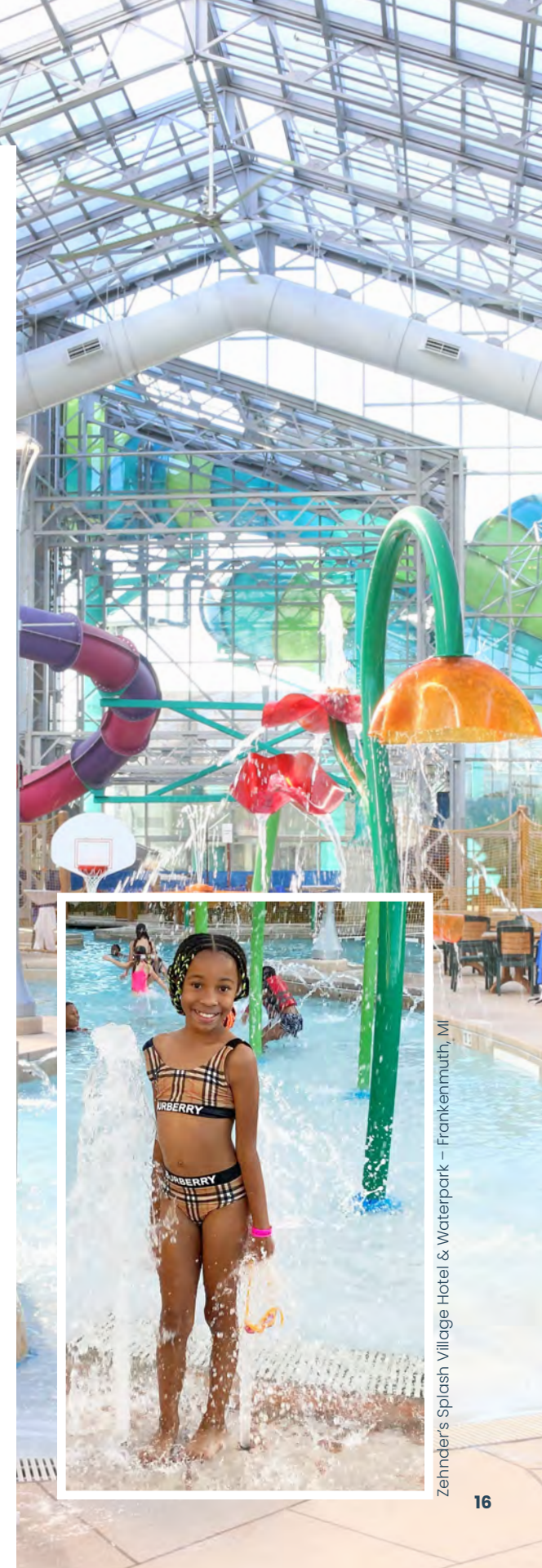
Zehnder's Splash Village Hotel & Waterpark — Frankenmuth, MI

Dive into Zehnder's Splash Village Hotel & Waterpark, with a six-story Family Raft Ride, four-story tube slides, an arcade, and poolside dining options!