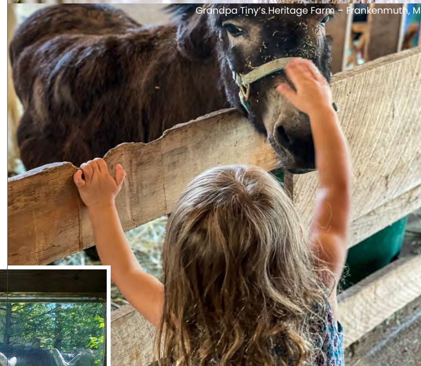
Grandpa Tiny's Heritage Farm — Frankenmuth, MI