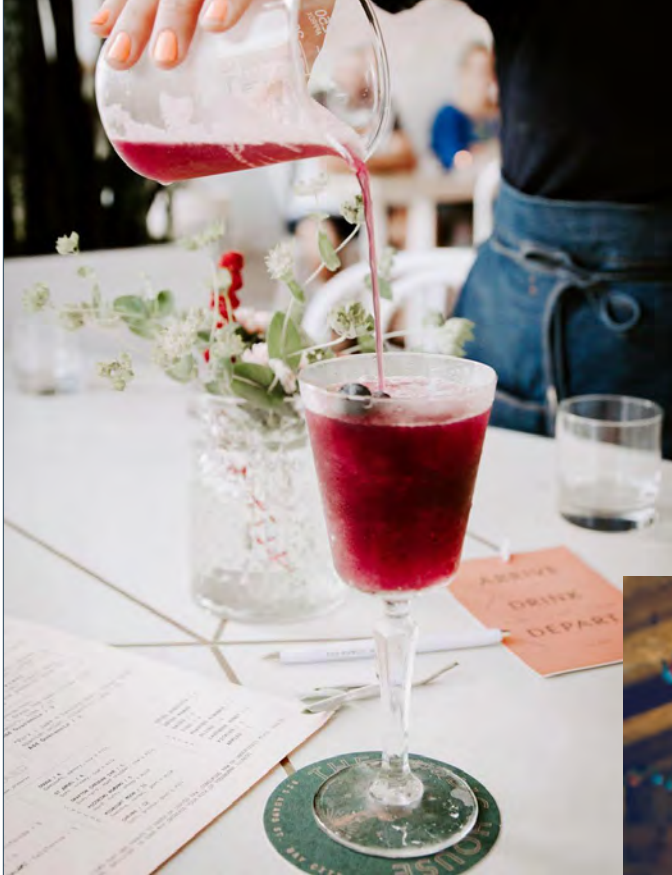
The Public House – Bay City, MI

Sample signature cocktails, smoked table-side, at Beaver's Pub, a cozy whiskey bourbon bar.