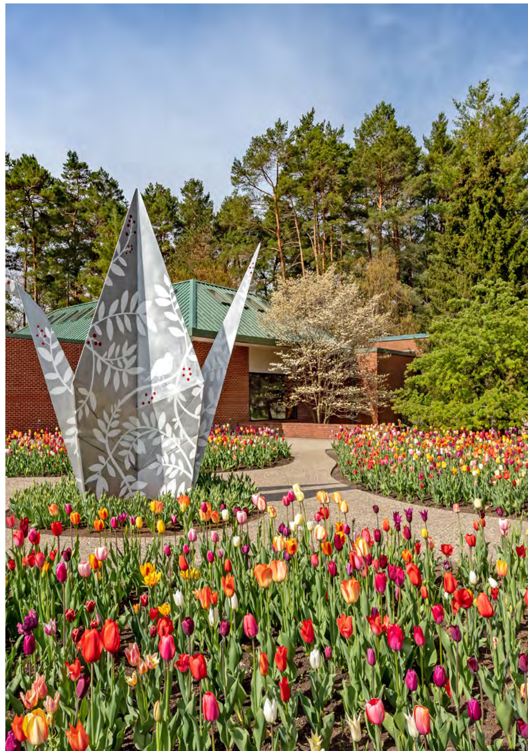
Dow Gardens – Midland, MI