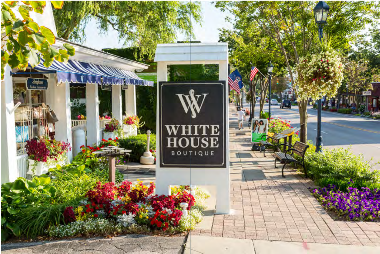
Downtown Shopping Frankenmuth, MI