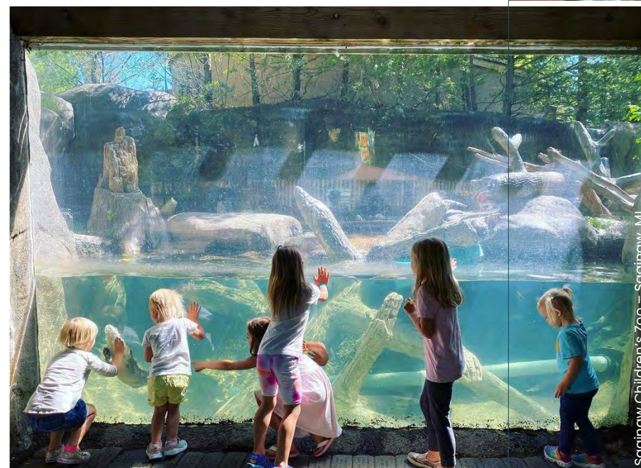
Saginaw Children's Zoo — Saginaw, MI

All aboard "Lucy," the bright-red trolley! Join Golden Ticket Trolley Tours for a memorable Family Ride through Frankenmuth, complete with a kids' playlist.