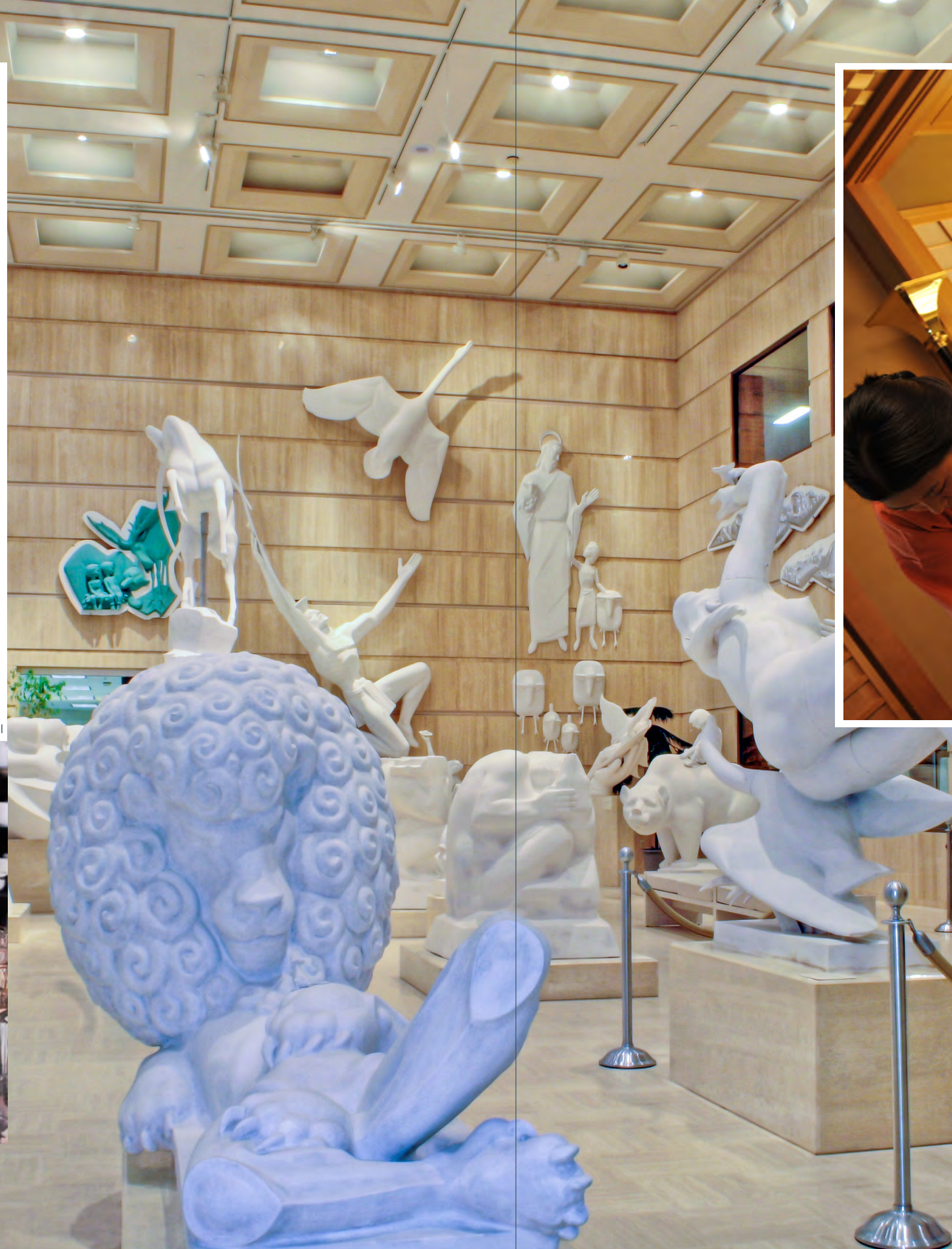
Marshall M. Fredericks Sculpture Museum – Saginaw, MI