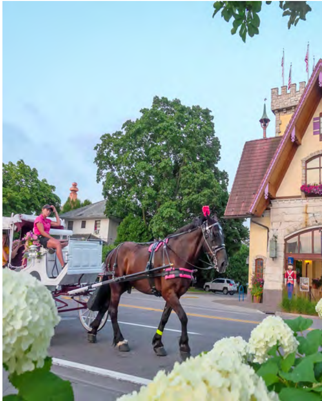
Fantasy Carriage Company Frankenmuth, MI