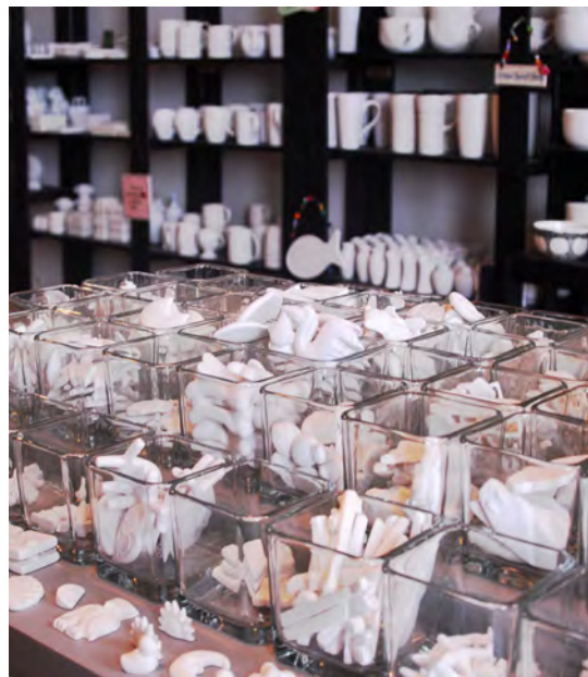
Painterly Pottery – Bay City, MI

Discover the Great Lakes Bay Region Public Art Passport and map your route to see public art!