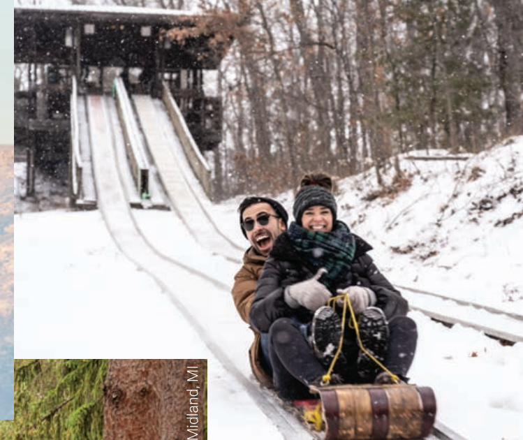
City Forest – Midland, MI