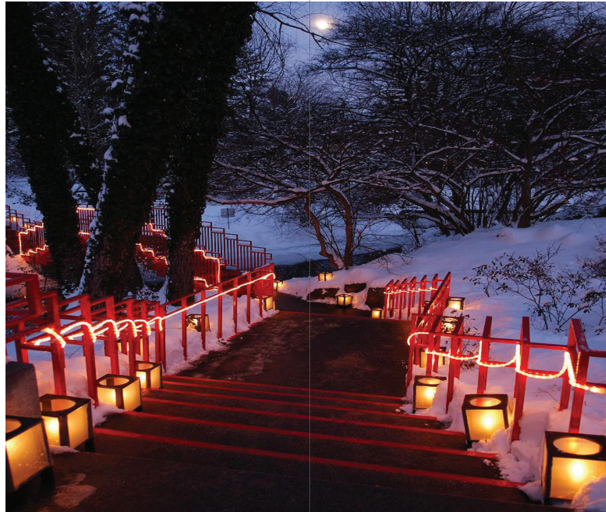
Dow Gardens Christmas Walk Midland, MI

vehicle. Listen to sounds of the season with your radio at 93.9 FM, and sing along to favorite Christmas songs as thousands of lights dazzle and dance to the classics!