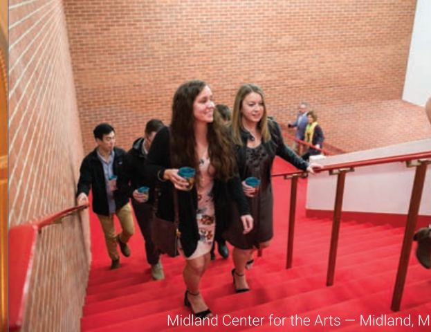
Midland Center for the Arts – Midland, MI