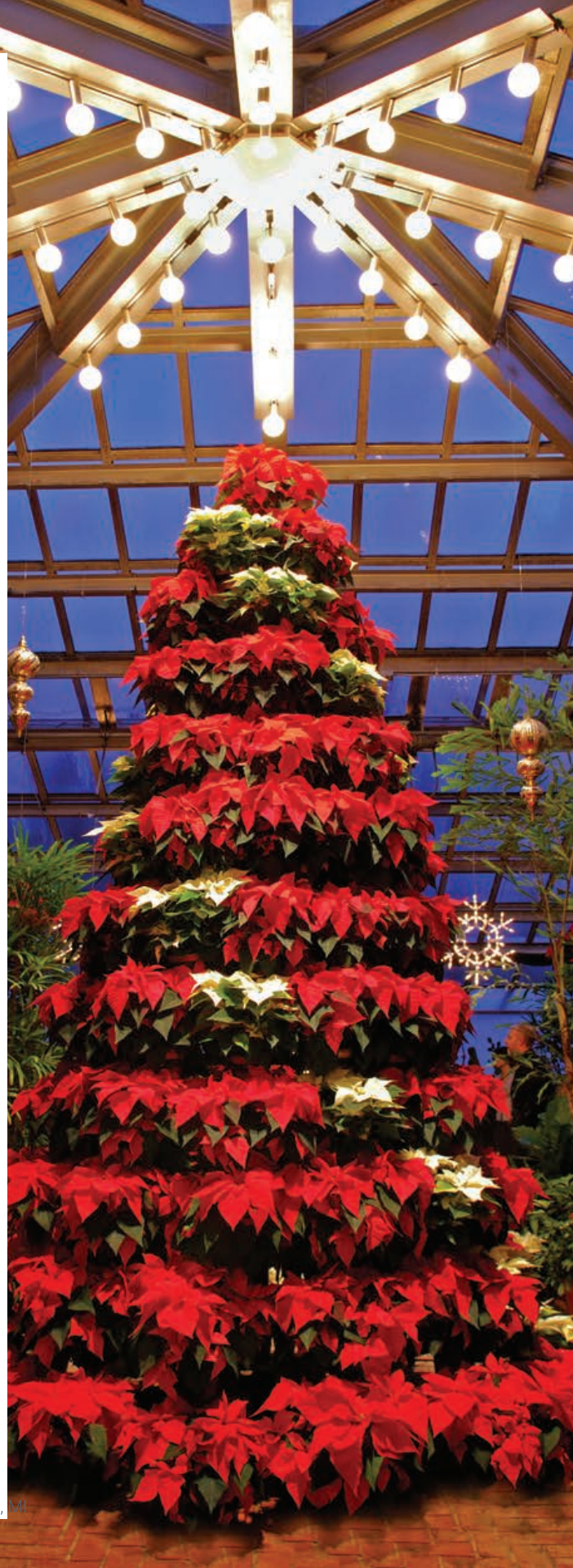
Dow Gardens Christmas Walk – Midland, MI

Frankenmuth ChristKindlMarkt (November – December) Explore troves of seasonal treasures & treats at mid-Michigan's largest open-air holiday market, modeled after the traditional Christmas markets of Germany. With live holiday music filling the air, sip mulled wine or piping hot cocoa as you shop artisan gifts to seasonal greenery. Sample hot soups, fresh-baked breads, and freshly grilled local Willi's Sausages — and snap a photo with Santa for the family holiday card!