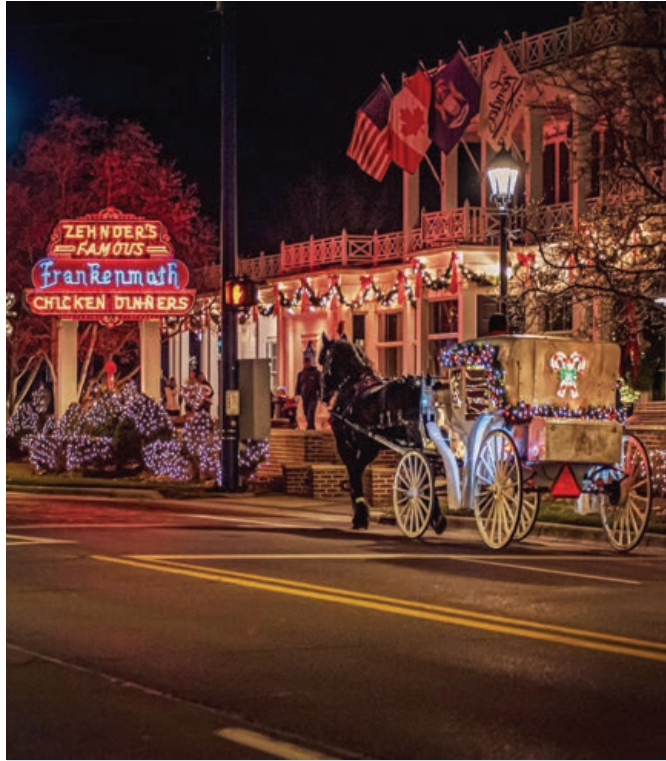
Fantasy Carriage Company Frankenmuth, MI