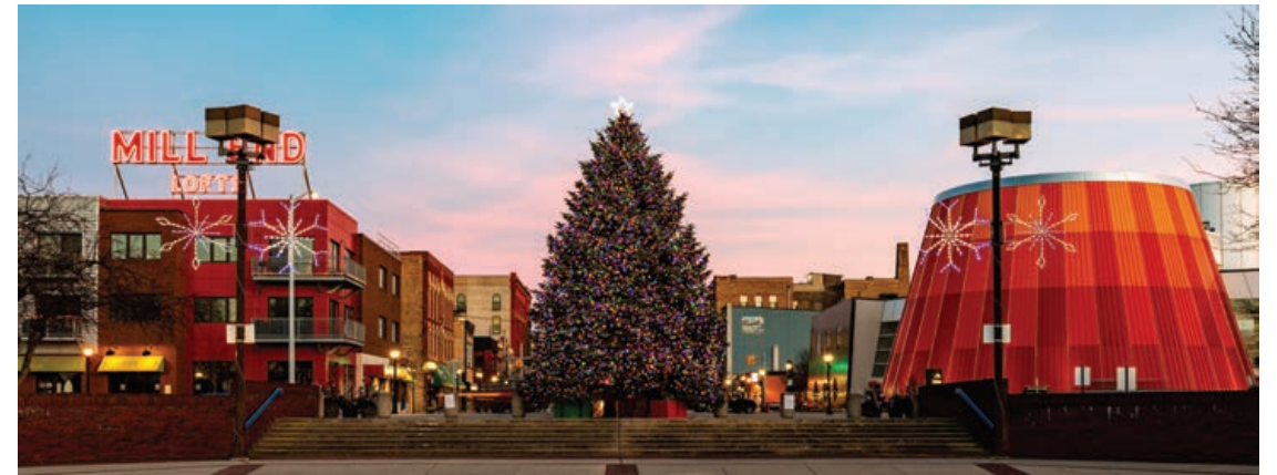
Sundays in the City – Bay City, MI