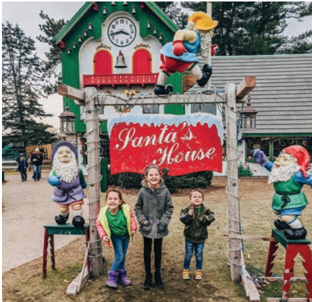
Midland Santa House – Midland, MI