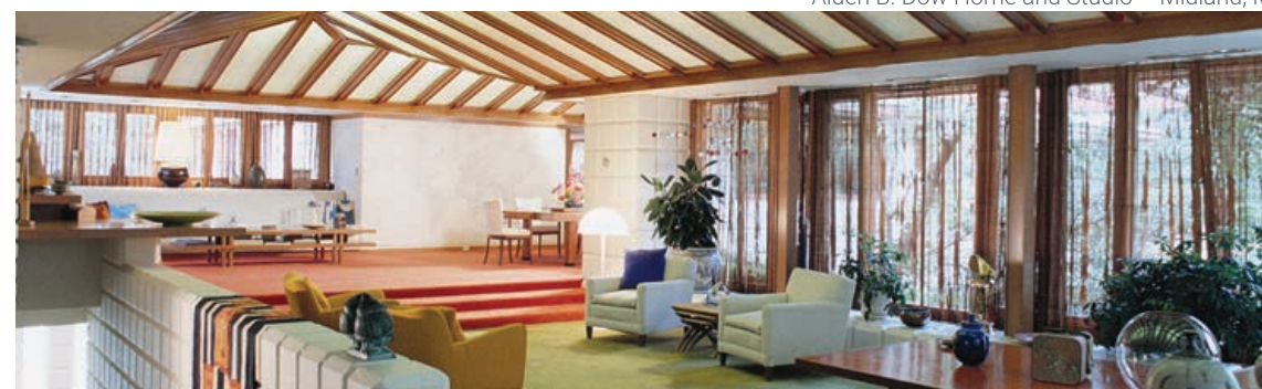
Alden B. Dow Home and Studio – Midland, MI

Take a trip back in time at the French chateau-style castle in the middle of the city, the Castle Museum of Saginaw County History. Discover three floors of fascinating displays, alongside traveling exhibits and special programs.