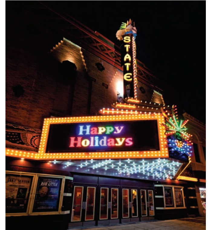
State Theatre of Bay City Bay City, MI

Celebrate the wonders of Christmas at Frankenmuth ChristKindlMarkt, a traditional German Christmas market filled with artisan