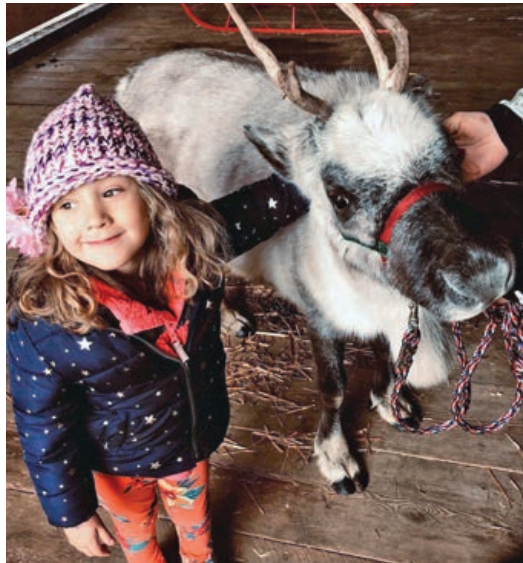
Santa's Reindeer Farm – Frankenmuth, MI