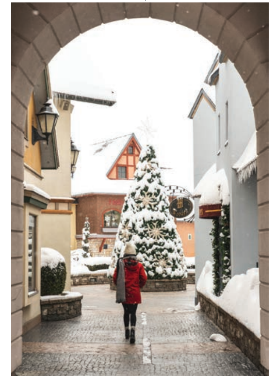
Frankenmuth River Place Shops – Frankenmuth, MI

Hollyday Art Fair (December) Make it an annual tradition to shop the Hollyday Art Fair at Andersen Enrichment Center in Saginaw! With room-upon-room of artisan gifts for the season, find distinctive items, meet Michigan makers, and pick up fresh holly! Savor a soup and sandwich lunch, and take home sweets & treats for your holiday entertaining.