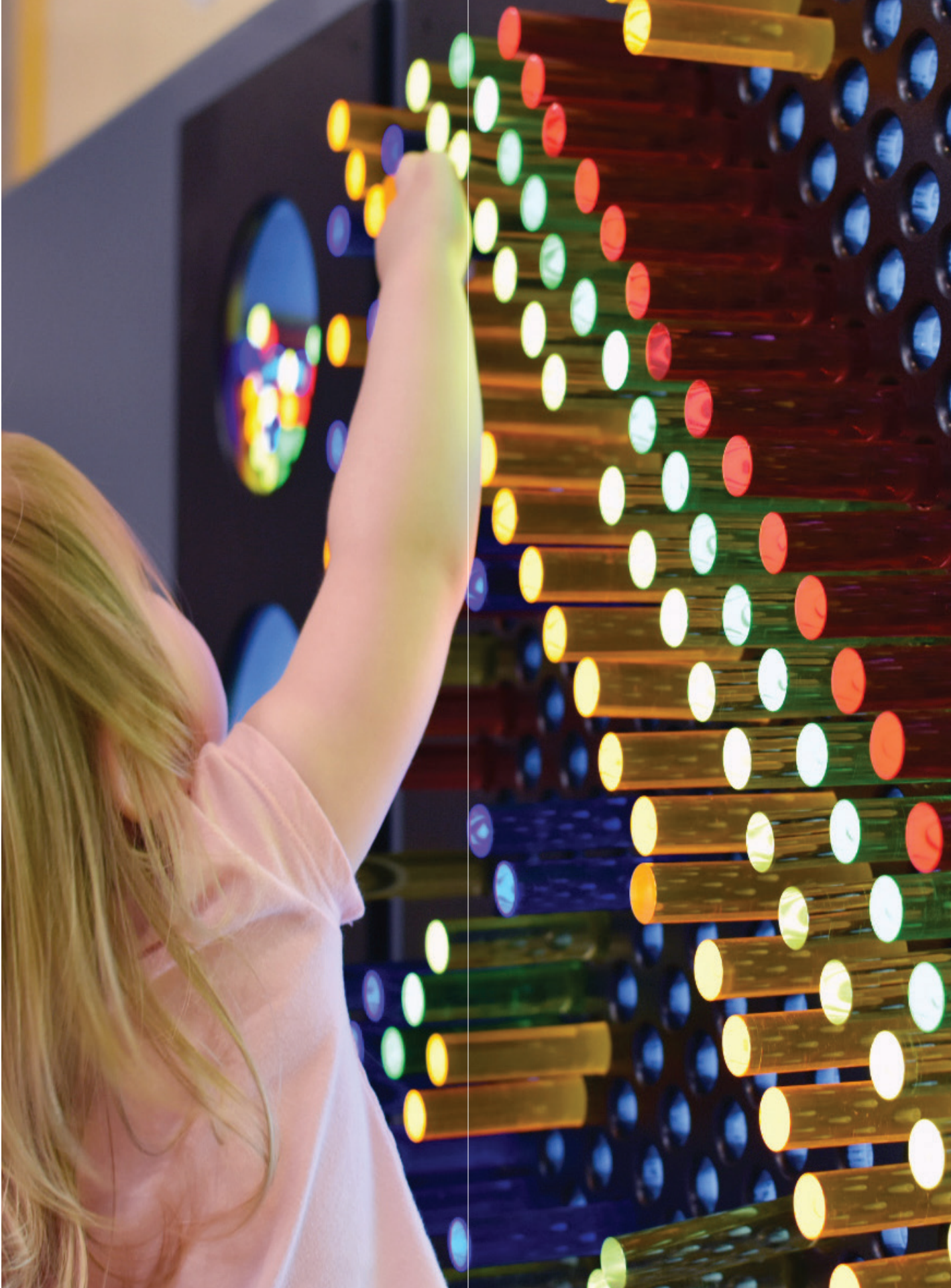
Midland Center for the Arts — Midland, MI

Spend quality time exploring and inventing as a family inside Spark!Lab® Smithsonian at Midland Center for the Arts! Discover pop-up STEM exhibits and experience an interactive space where curiosity is encouraged.