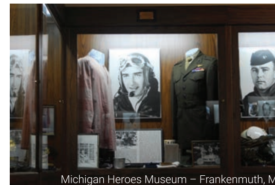
Michigan Heroes Museum – Frankenmuth, MI

Visit the gallery that makes art accessible to all at Studio 23/The Arts Center. Drop into the on-site Craft Bar, a self-service art experience! Choose a project off the menu and receive your packet with instructions and supplies.