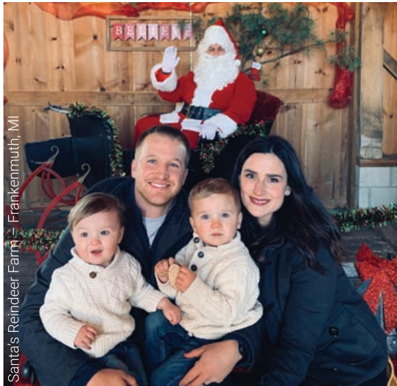
Santa's Reindeer Farm – Frankenmuth, MI