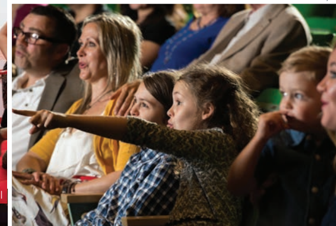
Midland Center for the Arts – Midland, MI