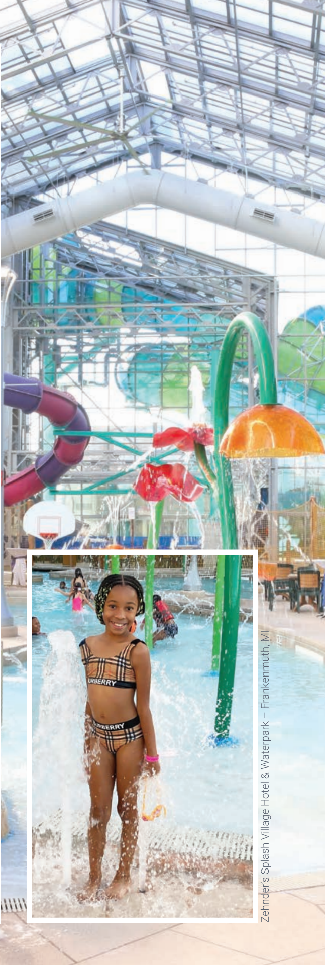
Zehnder's Splash Village Hotel & Waterpark — Frankenmuth, MI

Bring the kids into Brinstar for vintage-to-newer video arcade games and pinball machines — but stay for deliciously creative burgers and fresh-cut fries the whole family will love!