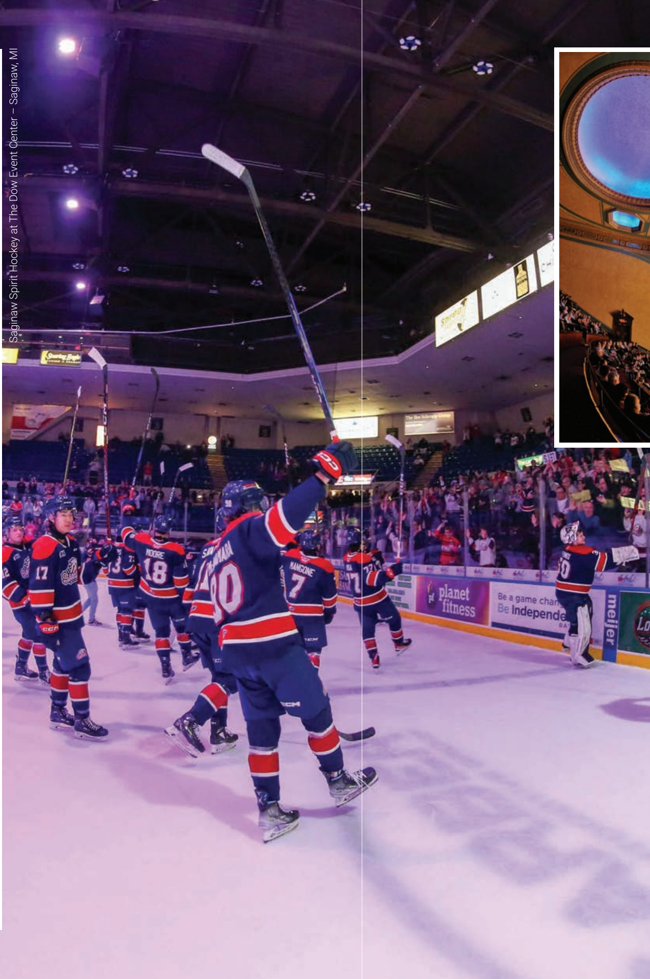
Saginaw Spirit Hockey at The Dow Event Center – Saginaw, MI

Decipher cryptic clues, piece together captivating puzzles, and toy with intriguing gadgets to get your team out of a locked room at Great Lakes Escape Game, Saginaw Escape, or Code Breakers Escape & Puzzle Rooms. Search for answers, but act fast — either solve the puzzles to break out, or run out of time!