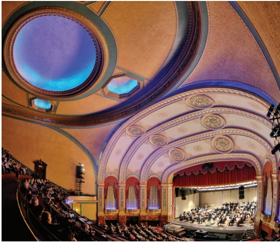
The Temple Theatre – Saginaw, MI