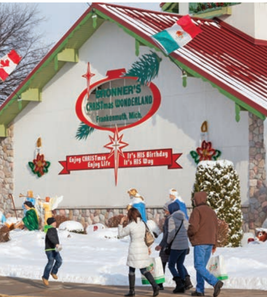
Bronner's CHRISTmas Wonderland – Frankenmuth, MI

The Northern Star Train (December) All aboard The Northern Star Train — tickets are free and the memories are priceless! Operational throughout the Midland Santa House season, take a magical 20-minute ride through town aboard a whimsical train decked out in holiday spirit. Choo-choo!