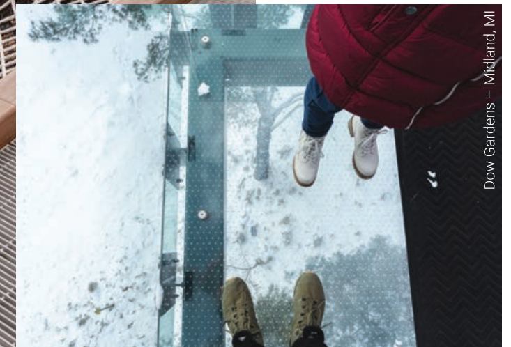
Dow Gardens – Midland, MI