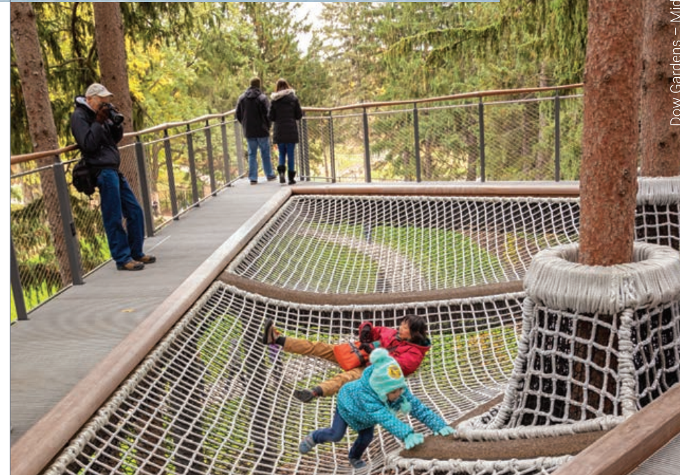
Dow Gardens – Midland, MI