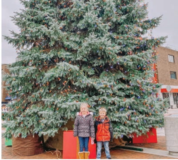
Wenonah Park Tree Lighting – Bay City, MI