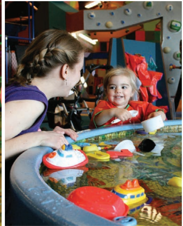
Mid-Michigan Children's Museum — Saginaw, MI