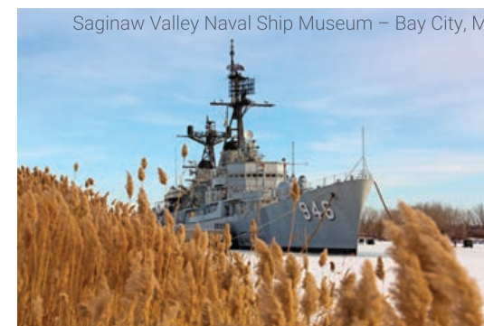
Saginaw Valley Naval Ship Museum – Bay City, MI