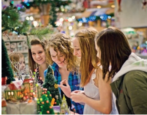
Bronner’s CHRISTmas Wonderland – Frankenmuth, MI

Keep the Christmas spirit alive with a visit to the Nate & Mary Ida Doan Santa House in Bay City. Bring the young and young-at-heart to this cozy log cabin with fascinating displays, and have your photo taken with Santa himself!