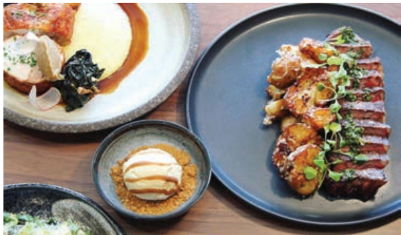
Aster — Midland, MI

Whether you cuddle by candlelight at Prost! Wine Bar & Charcuterie, indulge in Italian cuisine and a dramatic dining experience at Gratzl, delight in delicately crafted homegrown gourmet at Aster, or pair fine wines fermented in-house with decadent menu items at Artisan Urban Bistro, discover tantalizing ambiances and magical evenings at restaurants that are ready for winter date nights!