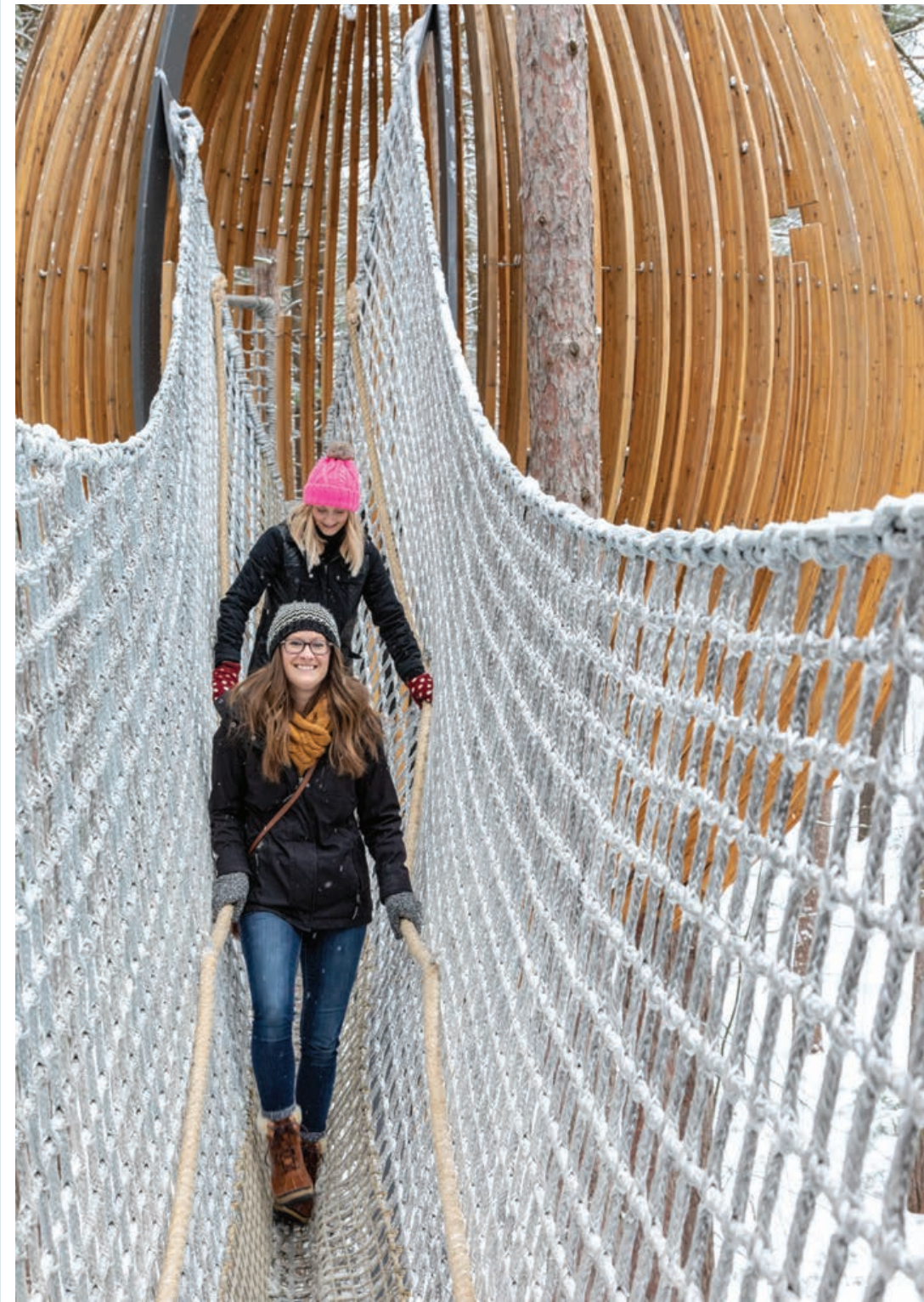
Dow Gardens – Midland, MI