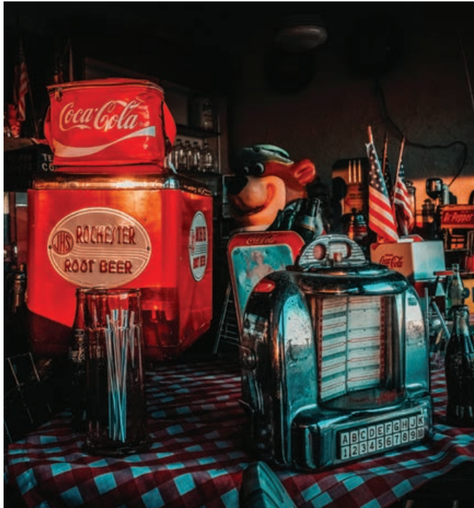
Bay City Antiques Center/Bay Antique Center Bay City, MI