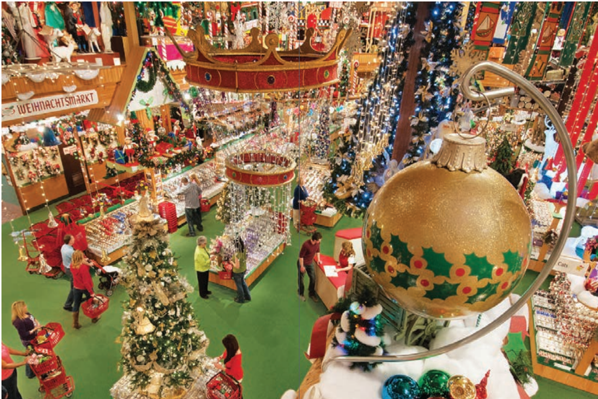
Bronner's CHRISTmas Wonderland Frankenmuth, MI

Place Shops! Sample Michigan-made wine, spirits, and fudge, and discover the kind of shopping experience you'll want to make a winter tradition!