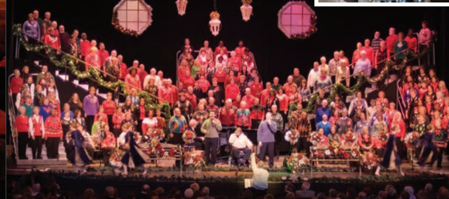
The Dow Event Center – Saginaw, MI