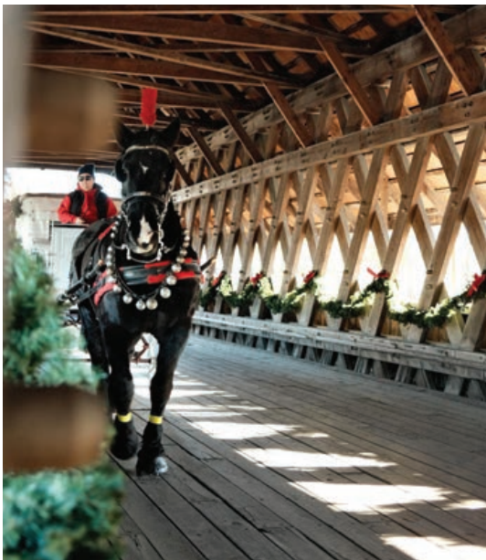
Fantasy Carriage Company – Frankenmuth, MI