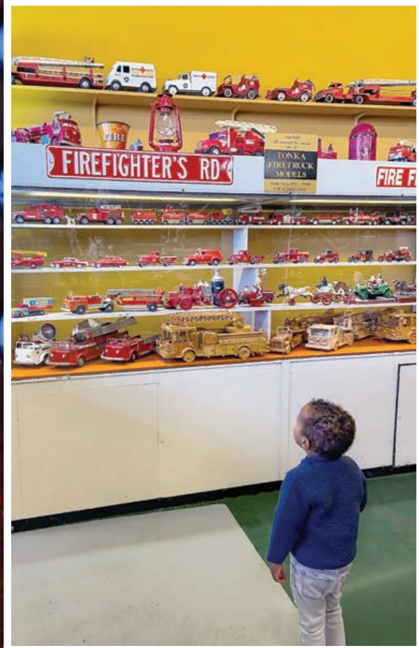
Antique Toy and Firehouse Museum — Bay City, MI