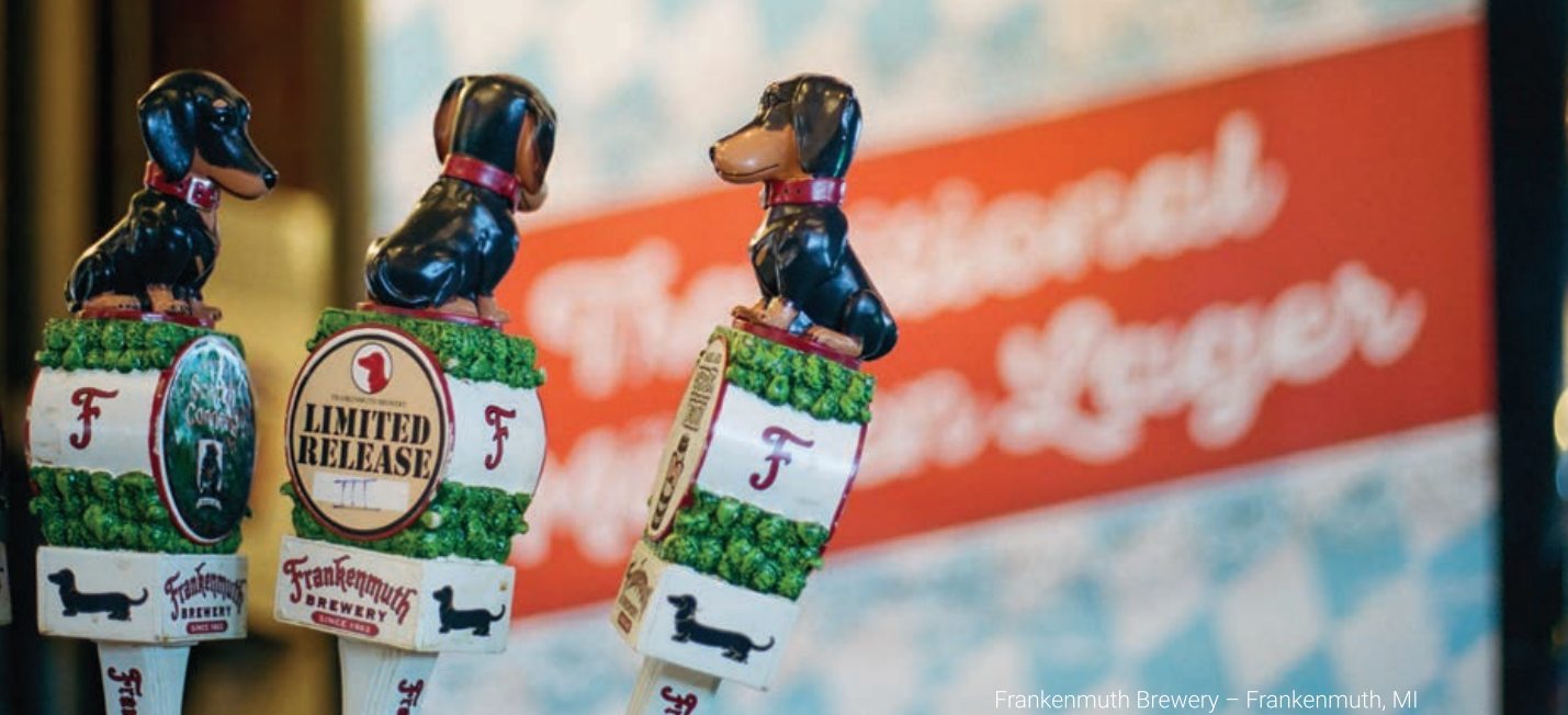
Frankenmuth Brewery – Frankenmuth, MI