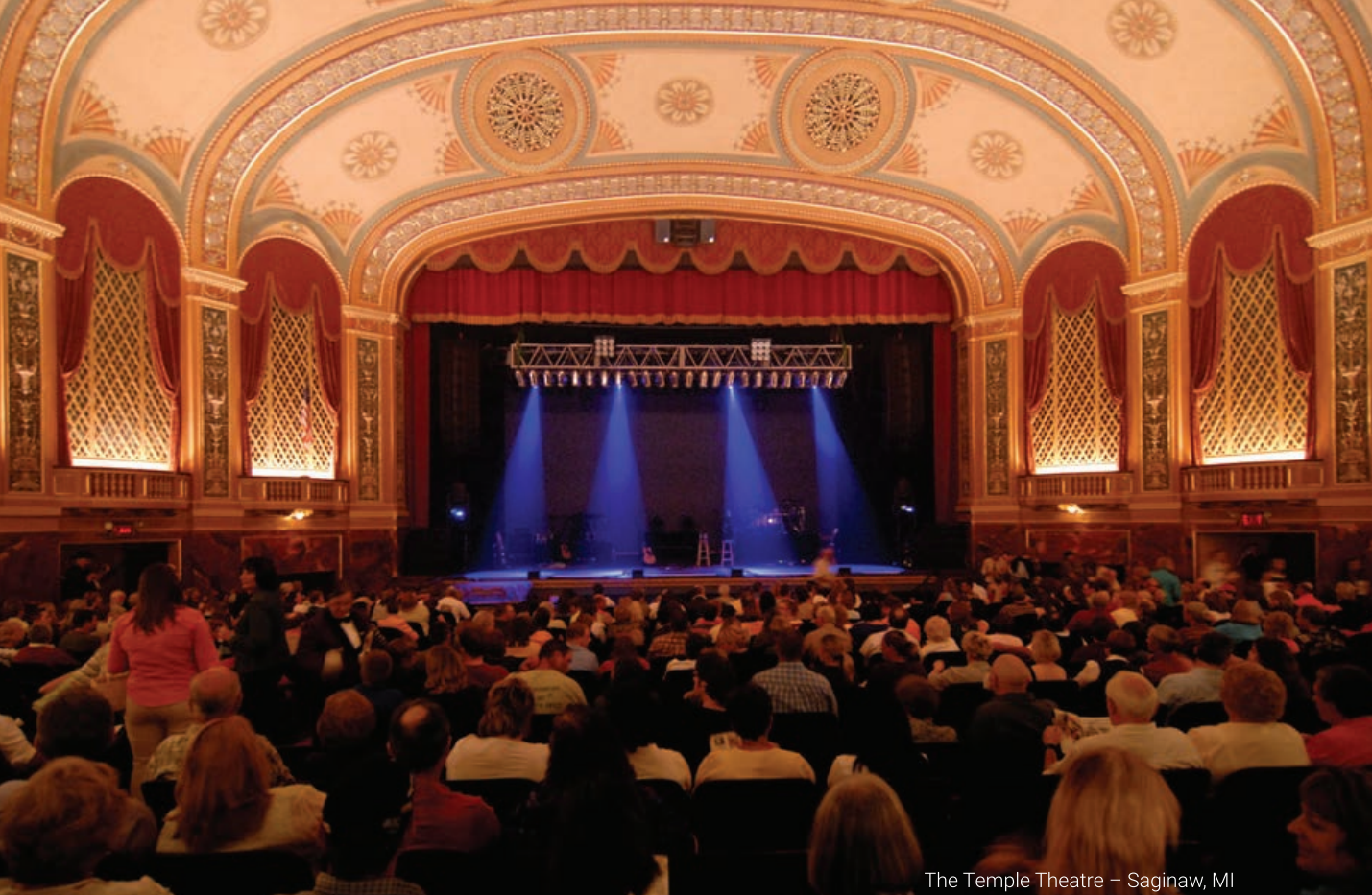
The Temple Theatre – Saginaw, MI