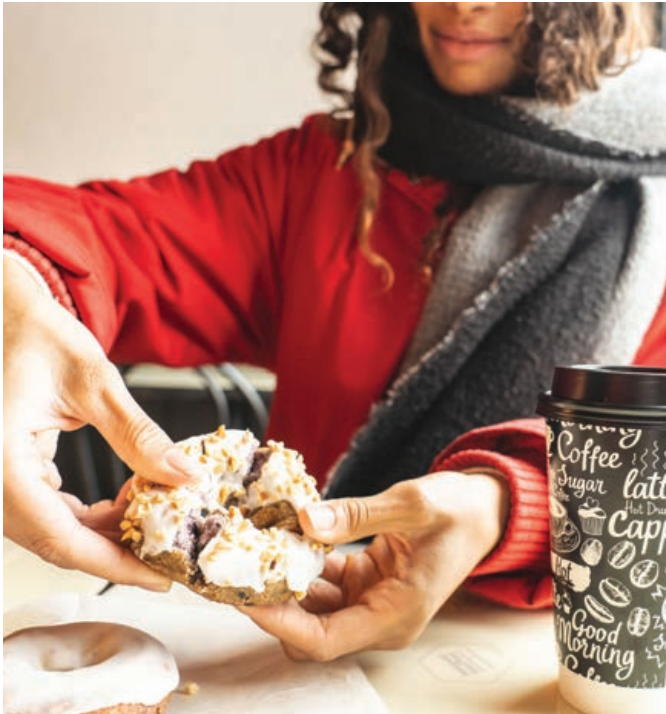
Frankenmuth Kaffee Haus Frankenmuth, MI

Wrap your hands around a nice, warm mug of delicious winter respite! Breathe in the aroma of locally roasted beans from Creation Coffee, Populace Coffee, or Live Oak Coffeehouse — or find just the right cup of tea or a seasonal latte at Grove Tea Lounge. With full menus to small plates for savoring, baked goods and pastries made fresh, and java jolts to mellow-mood teas, let cozy coffee shops and tea lounges warm you up this winter.