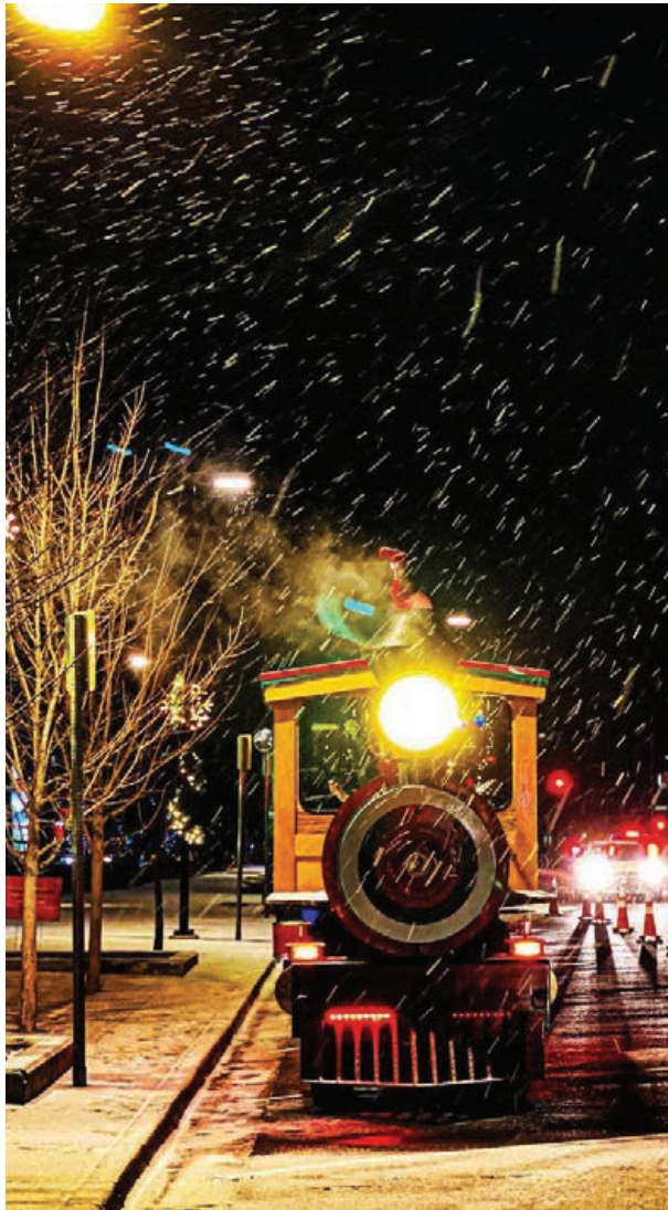
The Northern Star Train – Midland, MI

Channel your family’s Christmas spirit at Holidays in the Heart of the City. Hop on for a free pony ride and visit Santa & Mrs. Claus in Borchard Park. Sing along with carolers and enjoy cookies & hot cocoa while visiting holiday open houses — and take in free horse-drawn wagon rides, holiday concerts, and the finale fireworks show!